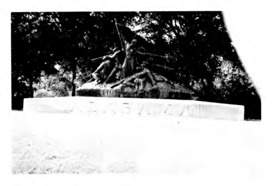
The Alabama Monument.

Only in recent years has a memorial been placed at Vicksburg honoring the Alabamians who gave their lives in the unsuccessful defense of Vicksburg, a major turning point in the outcome of the war.