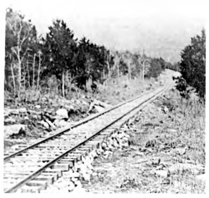
The Monte Sano Dummy Line Railroad