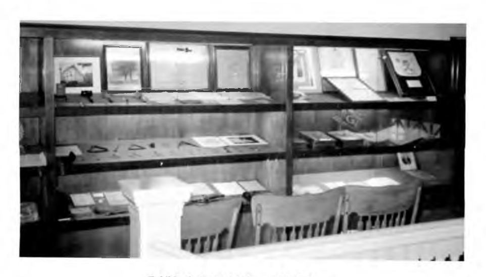
Exhibits depicting the history of the Lodge