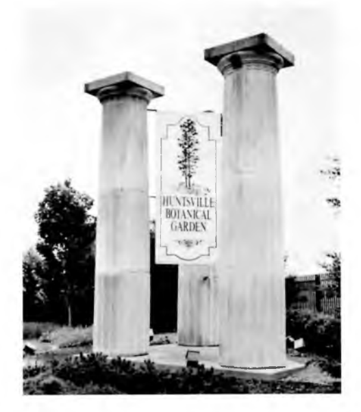
The Garden's main entrance with columns from the third Madison County Courthouse

When Madison County's third courthouse was demolished in 1964, the twenty limestone columns that were the main feature of the structure were salvaged and stored. The columns were moved to the Garden in 1985 to be used for future development. Three of these columns were used in the design of the entrance to the Garden on Bob Wallace Avenue which was built in 1991. The remaining sections are to be used in future garden designs.