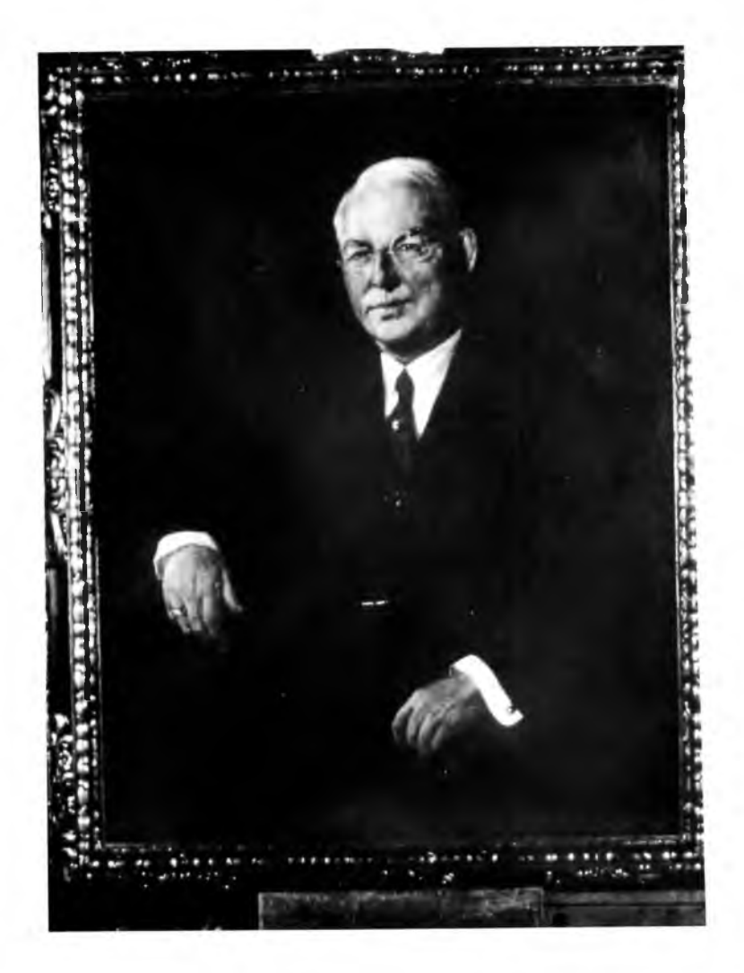
Portrait of Russel Erskine