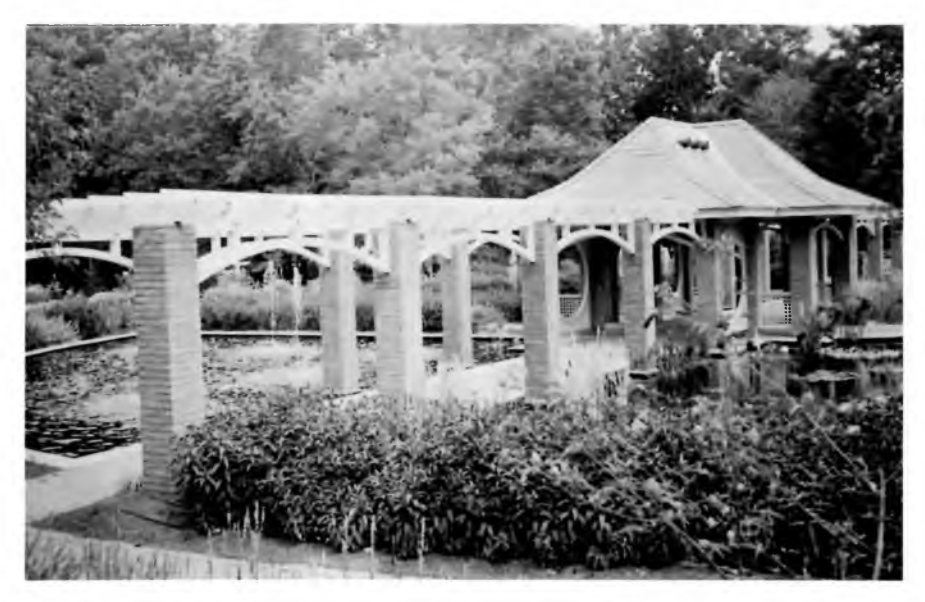
Aquatic Garden and Pavillion

The Central Corridor Gardens flow over five acres and comprise three theme gardens: the Perennial Garden, the Aquatic Garden, and the Annual Garden. The Perennial Garden provides a constant display of color and texture throughout the year. The Aquatic Pavilion is the heart of the Aquatic Garden, with fountains in front and large peaceful pool in the rear, full of water plants. To the west the Summer House surrounded by beds of dazzling color comprise the Annual Garden. Many weddings are held throughout the year in these attractive areas.