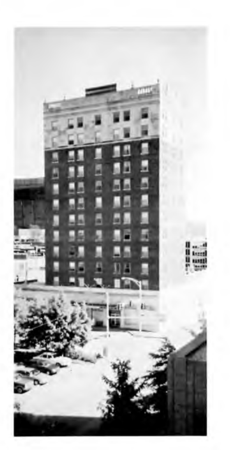
Russel Erskine Hotel

The magnificent hotel was opened in 1930, the tallest and finest within 100 miles.<sup>12</sup> A large portrait of Russel Erskine which hung in the opulent lobby is now a part of the Huntsville Art Museum's permanent collection. The 12-story hotel served the city splendidly with ballrooms, restaurant, and 150 guest rooms with "circulating ice water and electric fans" until the 1980s when it closed and was converted to apartments for assisted living.