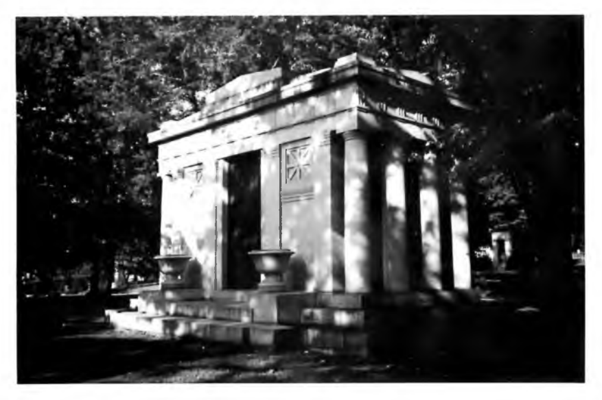
The Erskine Mausoleum in Maple Hill Cemetery

In addition to the hotel venture, Erskine had other interests in Huntsville. In 1916 a main street was built from west to east in Maple Hill Cemetery. To honor his beloved mother who died in 1915, Erskine had constructed beautiful carved limestone and steel gates for the main entrance in 1919.<sup>16</sup> Then in September 1922 he purchased and gave several small parcels of land to the cemetery, to be called the Erskine addition at the east end of this main street. Many of old Huntsville's leading citizens are buried within the three circles in this property. There he constructed a mausoleum using a beaux-arts, neo-classical design.<sup>17</sup>