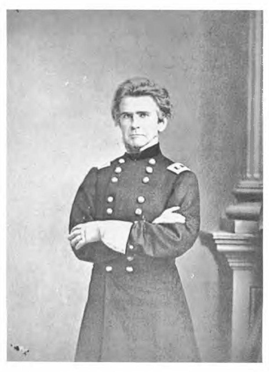
Major General Ormsby MacKnight Mitchel