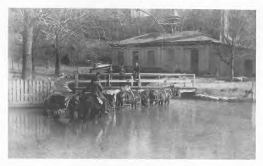
WATERING THE HORSES (ca Early 1860's)

stable and rented horses.) One can see that answers often lead one to more questions.