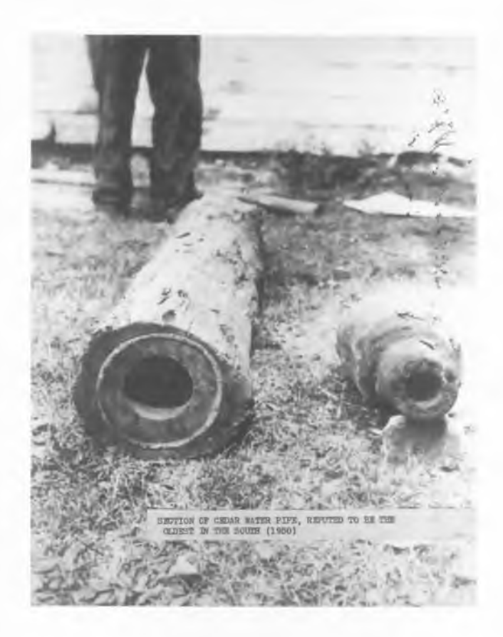
SECTION OF CEDAR WATER PIPE