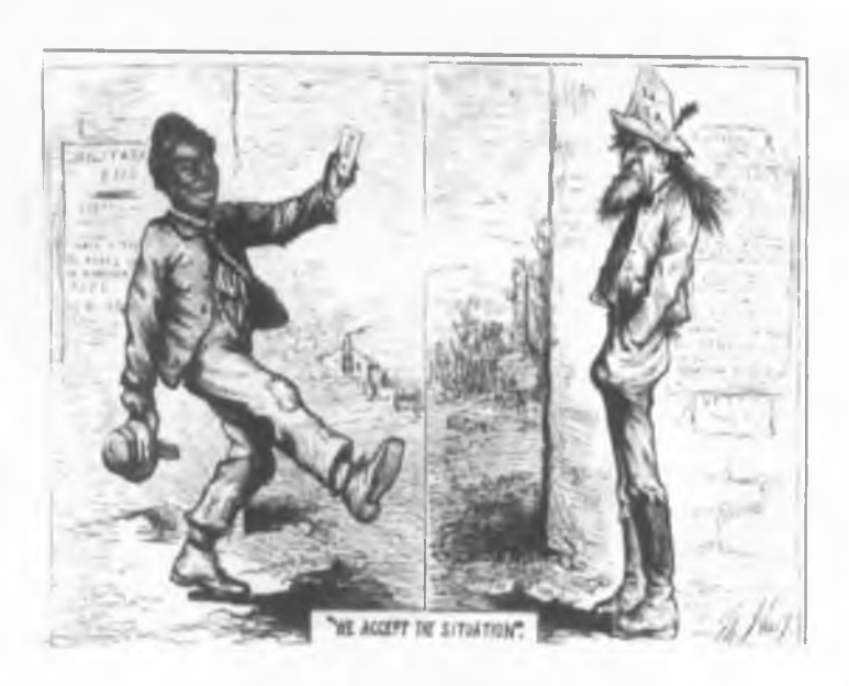
We Accept The Situation HARPER'S WEEKLY April 13, 1867

By tabling a petition from blacks in Mobile asking for the right to vote, it did not address the issue of full political rights for almost half of the state's population. Although slavery had been ended (Congress had passed the 13<sup>th</sup> Amendment on January 31, 1865 and it would be ratified on December 6, 1865) Wiggins point out, "The idea of black suffrage at this time was generally abhorrent in the state. The Huntsville Advocate observed that the black was free, and as a freedman the government would protect him in his legal rights. The Advocate urged its readers to accord the black man what the war had secured for him. But 'legal rights and political privileges are essentially different. He has been granted the former—not the latter.'"<sup>44</sup>