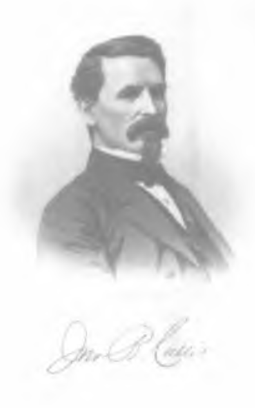
Published By The Huntsville-Madison County Historical Society