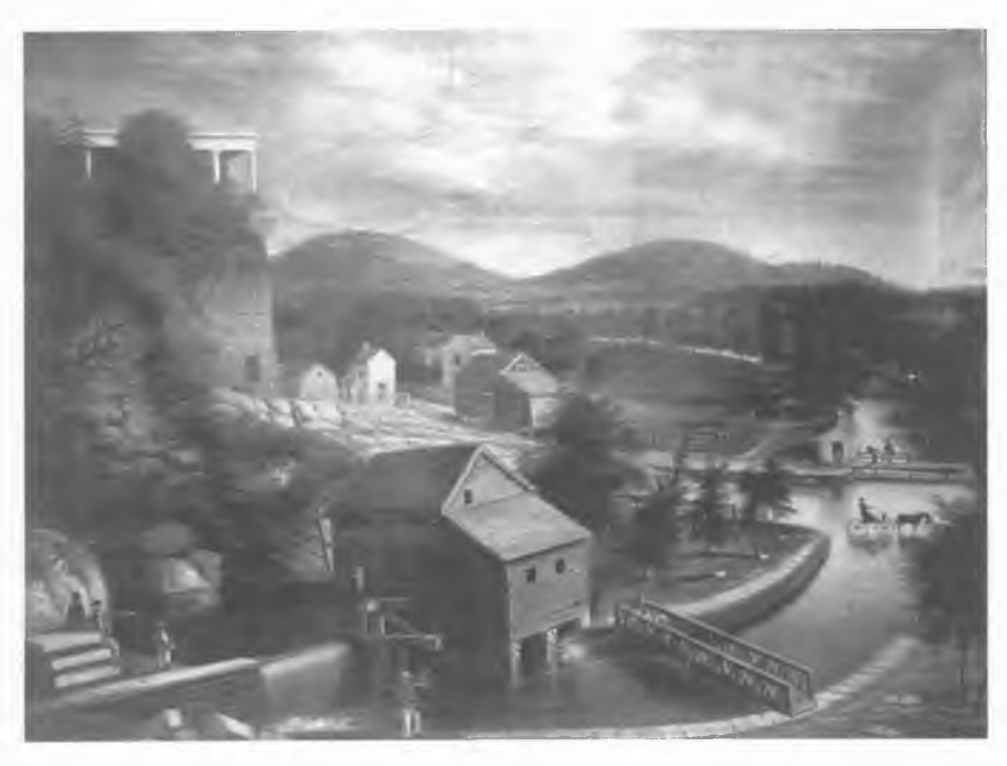
BIG SPRING WILLIAM FRYE - LANDSCAPE PAINTER (ca 1850)