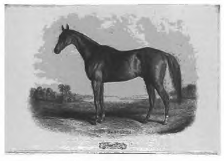
Painted by Edward Troye The painting is currently on loan from Yale and on display at the Museum of Racing in Saratoga Springs, New York.

New York and offered to race Post Boy, an unbeaten dark chestnut from New York at the Union Race Course on Long Island. John Bascomb's handlers walked the horse the entire 850 miles to allow admirers a chance to see the famed colt. Gamblers from across the country placed bets on the race, mostly on the northern horse. In what would become one of the most celebrated horse races of the nineteenth century, the contest began, as one poet remember, as "the drum was sounded by the judge . . . Bascomb won the first and second heat . . . taking in the knowing Northerners by the witty minded Southerners." Southerners rejoiced at the victory, and John Bascomb returned to the South amid great fanfare. 14