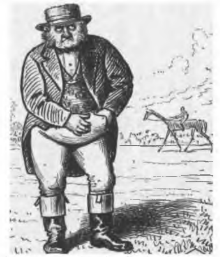
1879 Harper's Sketch of Horse Gambler

These gatherings became a time when white women, men, and children, both rich and poor, could mix freely. Of course, after the women and children went home, the men likely lingered to discuss the merits of the races while enjoying cigars and whiskey and perhaps playing cards. Many of the men would have added up their losses along the way home, perhaps already planning how to make it up at the next race day.