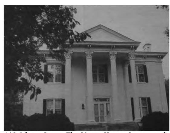
603 Adams Street, The Moore Home

requests the pleasure of your company, Thursday evening, July the twenty-first, eighteen-hundred and ninety-two, from nine to three o'clock. Huntsville, Alabama. complimentary to Signal's Lily Flagg, the Jersey cow of the world. One year's Moore Home