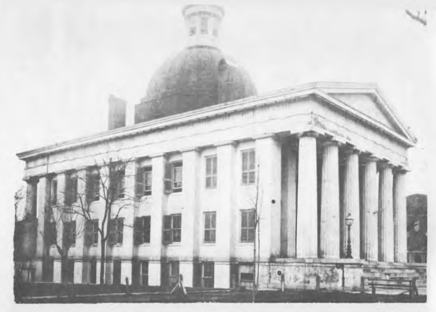
The Madison County Courthouse, 1836