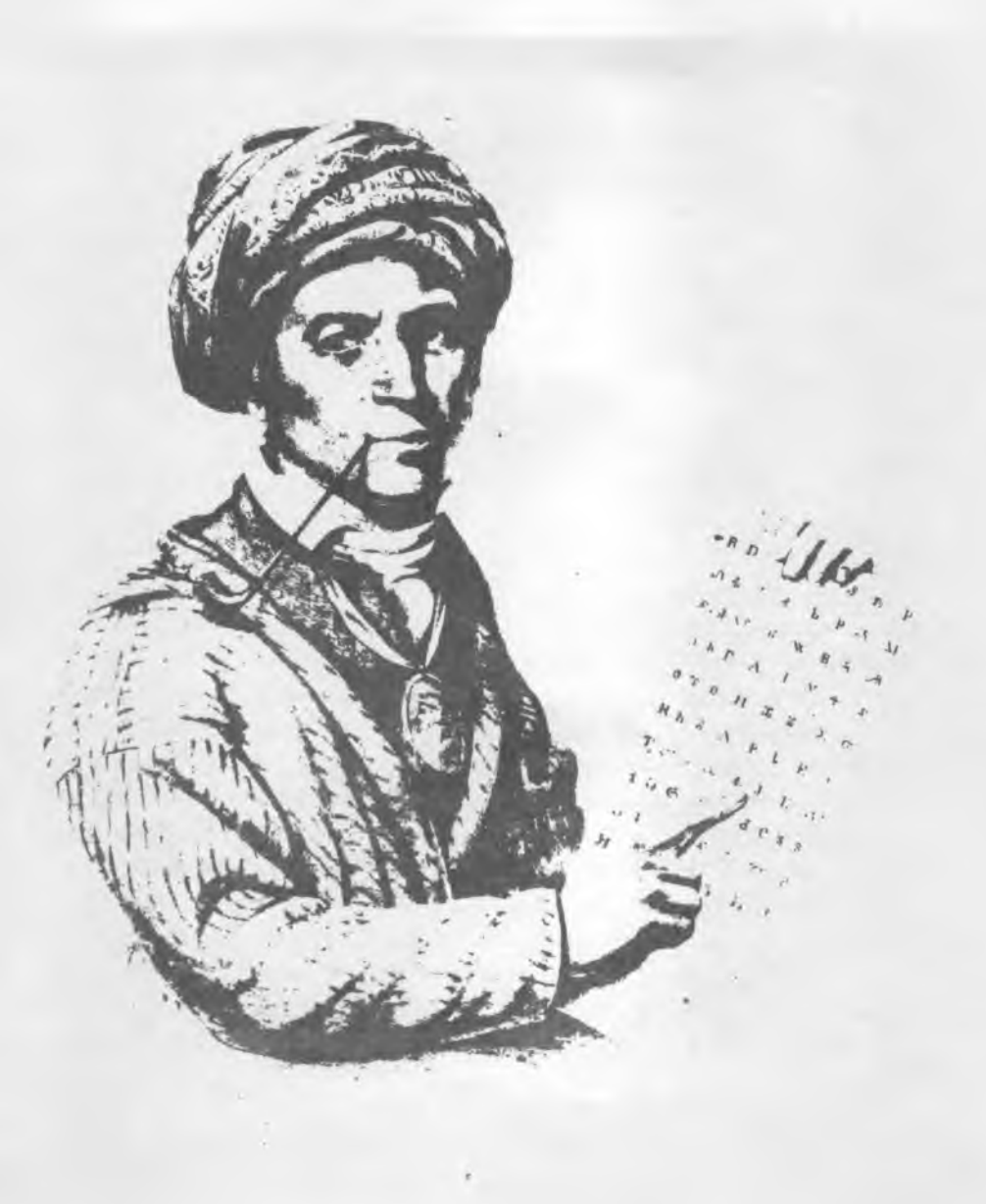
Sequoyah, inventor of the Cherokee alphabet