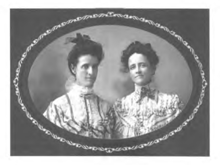
Echoes of the Past