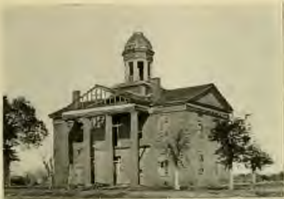
DALLAS ACADEMY, CAHABA, NOW DEMOLISHED