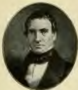
William R. King