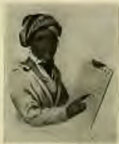
Sequoyah or George Guess Inventor of the Cherokee alphabet, native of Will's Valley, North Alabama