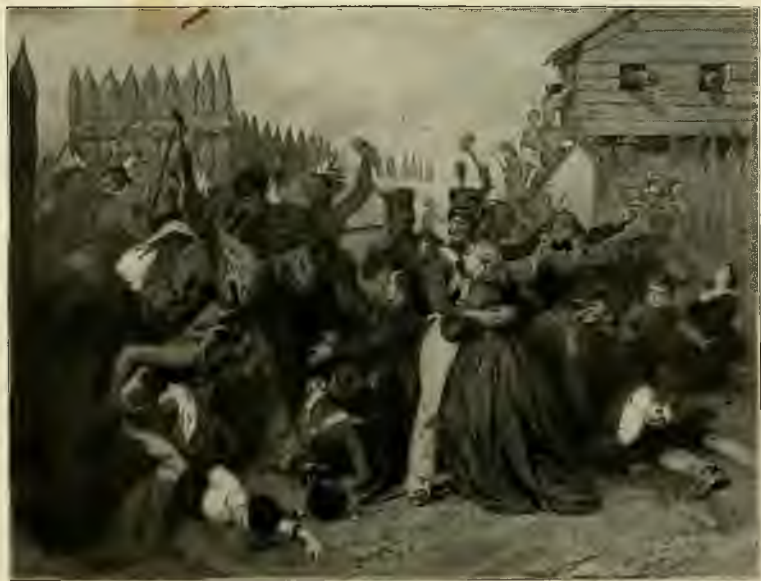
MASSACRE OF FORT MIMS, 1813