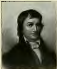
COL. JOHN COFFEE Chief of Staff of Gen. Jackson