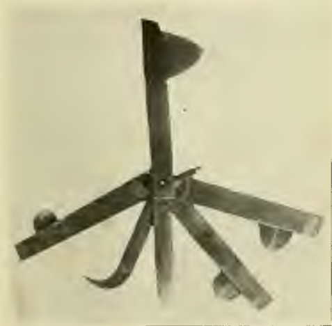
TYPE OF KNIFE USED IN PIONEER TIMES Property of William Weatherford, "Red Eagle," Creek Indian leader