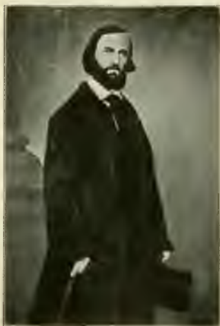
Clement C. Clay, Jr.