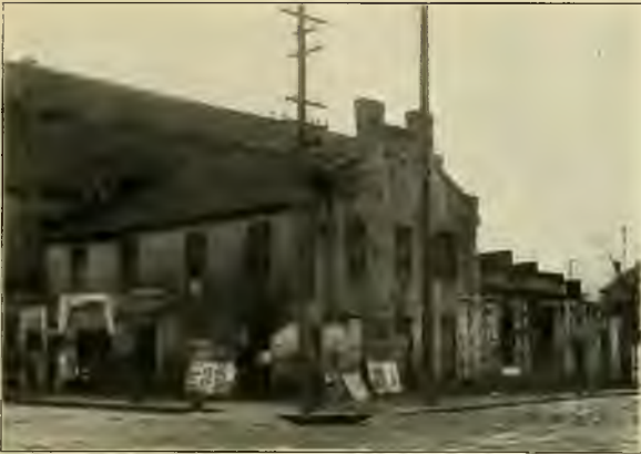
Building in which La Fayette was entertained in Montgomery during his visit to Alabama, 1825, now demolished

ON THIS SITE STOOD, UNTIL DECEMBER 1899, THE HOUSE IN WHICH MARQUIS DE LAFAYETTE WAS GIVEN A PUBLIC RECEPTION AND BALL, APRIL 4, 1825, WHILE ON HIS LAST TOUR THROUGH THE UNITED STATES.