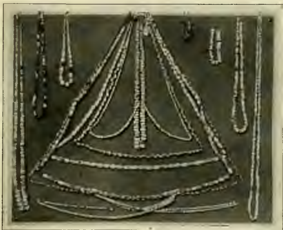
ORIGINAL SHELL BEADS FOUND IN INDIAN CEMETERY AT THE ALIBAMO TOWN, TOASI, NEAR MONTGOMERY