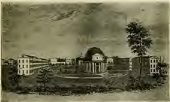
UNIVERSITY OF ALABAMA, TUSCALOOSA. EARLIEST KNOWN VIEW (From La Tourette's Map of Alabama, 1838)