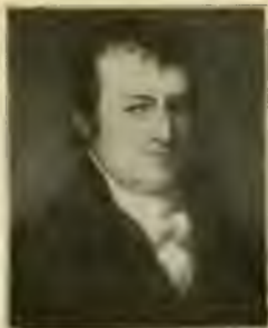
Judge Oliver Fitts Territorial Judge in Alabama section of Mississippi Territory