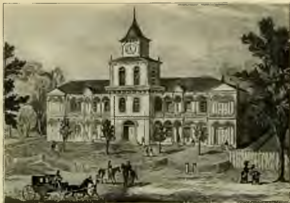
TUSCALOOSA FEMALE COLLEGE