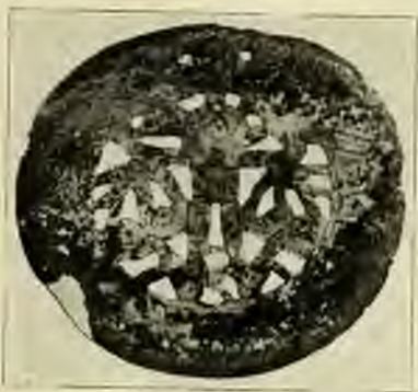
Shell Gorget (ornament), showing human form, found in aboriginal cemetery, Montgomery County