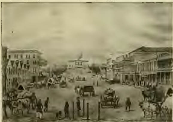
BURNING OF THE CAPITOL OF ALABAMA, MONTGOMERY, DECEMBER 14, 1849 Vol. 1-41