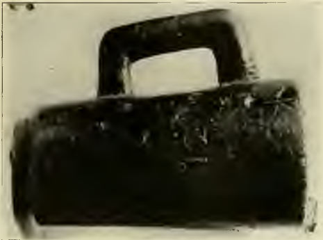
BREECH-BLOCK OF SPANISH CANNON, BROUGHT BY DE SOTO ON HIS EXPEDITION, 1540; THOUGHT TO BE THE OLDEST EUROPEAN RELIC IN AMERICA