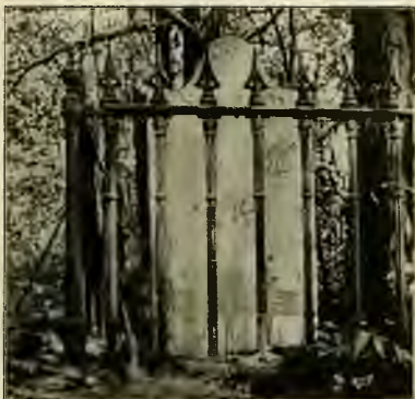
TOMB OF WILLIAM WYATT BIBB, FIRST GOVERNOR OF ALABAMA, IN OLD FAMILY BURIAL GROUND, NEAR COOSADA, ELMORE COUNTY