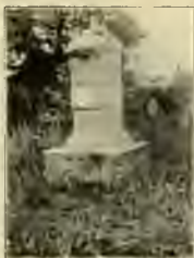
Metal Monument in Old Cahaba Cemetery