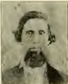
JOHNSON J. HOOPER Journalist and humorist