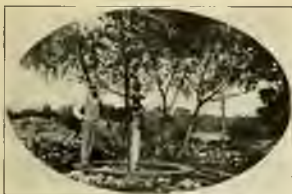
Artesian Fountain at site of Perrine Home