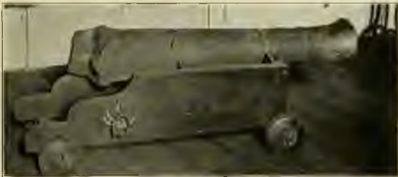
ONE OF EIGHT FRENCH CANNONS MOUNTED AT FORT TOULOUSE, 1714, RESTING ON IMPROVISED CARRIAGE

Both the Spanish breech-block and the French cannon are in the museum of the Alabama State Department of Archives and History