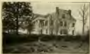
Nicholas Davis House, Maconville