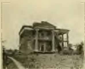
Crocheron Home, Cahaba