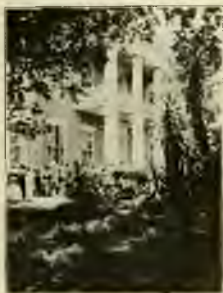
Kirkpatrick Home, only building remaining intact in once city of five thousand people