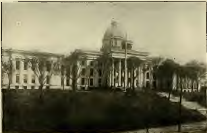
THE ALABAMA STATE CAPITOL, MONTGOMERY