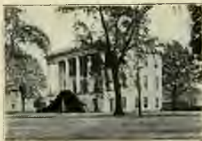
President's Mansion, University of Alabama, erected about 1835, now in use