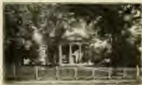
Bierne Residence, Huntsville