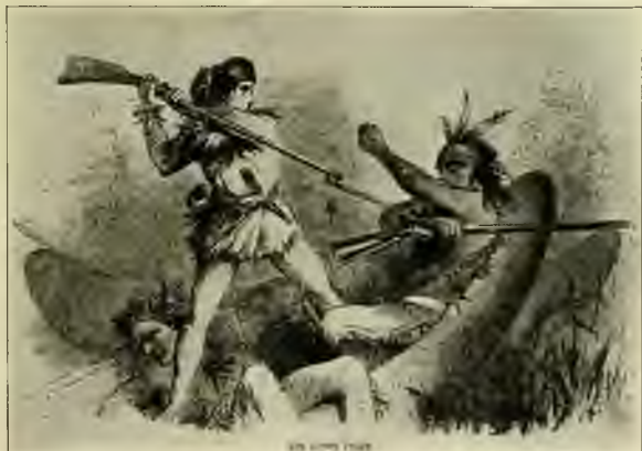
THE CANOE FIGHT

Hero of the canoe fight on the Alabama River during the Creek War in 1813