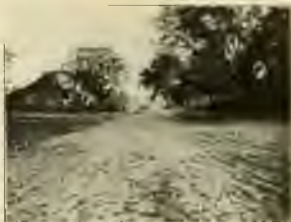
Present day appearance of Vine St., on which the capitol was located