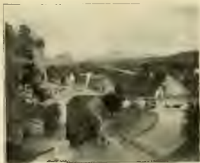
Big Spring and Water Mill, Huntsville