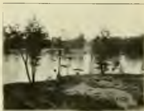
Landing on Alabama River at mouth of Cahaba River