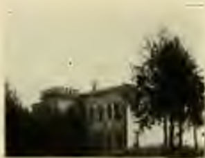
Perrine Mansion at Cahaba, now demolished