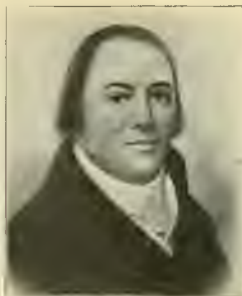
Judge Ephraim Kirby First Superior Court Judge in what is now Alabama