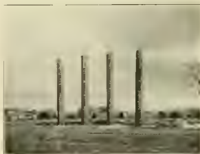
Brick Columns, remains of Dallas Academy