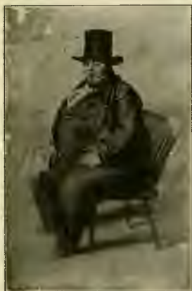
Dixon Hall Lewis