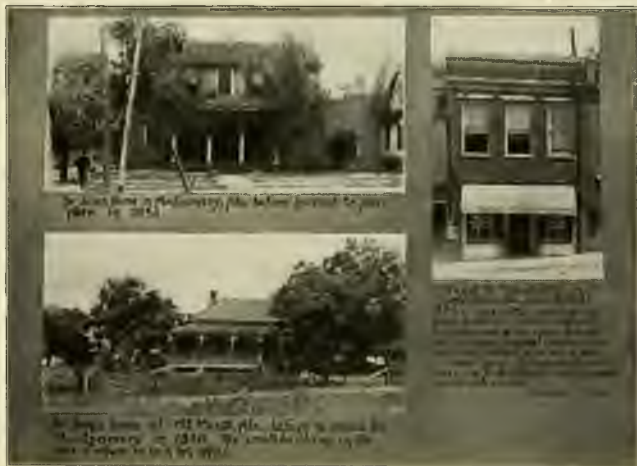
SCENES CONNECTED WITH DR. J. MARION SIMS' EARLY PROFESSIONAL CAREER IN ALABAMA