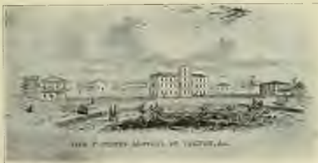
U. S. Arsenal, Mount Vernon, Alabama