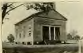
Union Church, now Negro Baptist, erected in early '30s