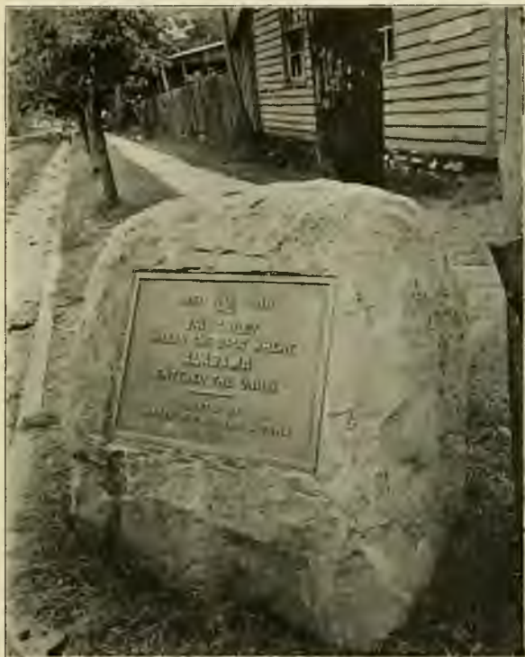
BOULDER AT HUNTSVILLE, MARKING SPOT WHERE ALABAMA ENTERED THE UNION