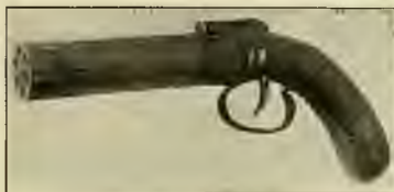
OLD PEPPER BOX Early form of the revolver