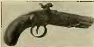
EARLY MAKE OF DERRINGER