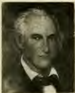
BIRD YOUNG Original of Hooper's "Simon Suggs"