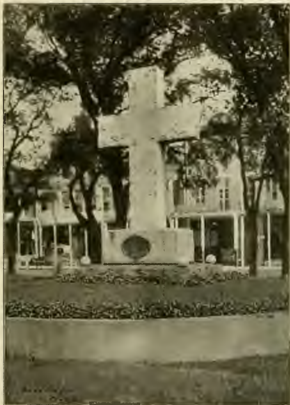
MEMORIAL CROSS ERECTED IN BIENVILLE SQUARE, MOBILE, BY THE ALABAMA BRANCH OF THE COLONIAL DAMES