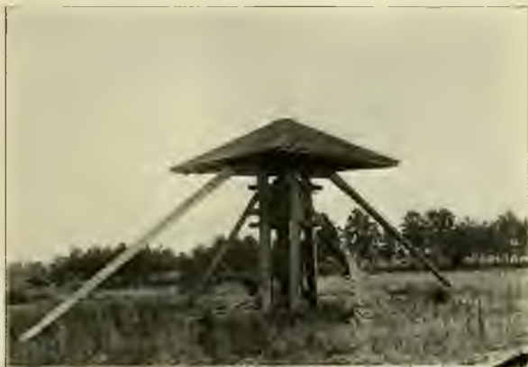
OLD FASHIONED WOODEN-SCREW COTTON PRESS