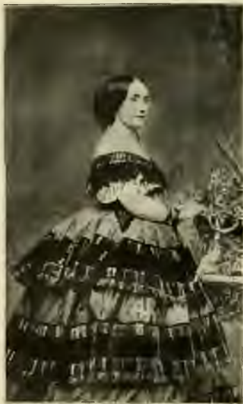
Madame Octavia Walton Le Vert Author of "Madame Le Vert's Travels"