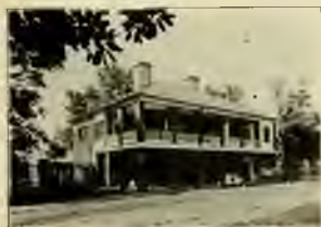
Surgeons' Home at Mt. Vernon Hospital of Insane Negroes, formerly U. S. Barracks