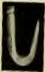
Bone fish hook from Toasi, one of the few found east of the Rocky Mountains.