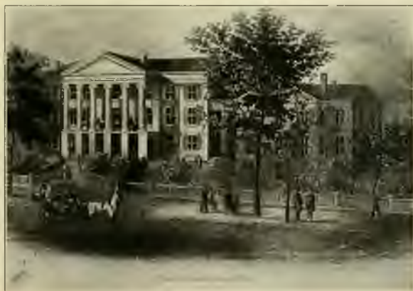
HUNTSVILLE FEMALE COLLEGE