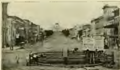
Dexter Ave., Montgomery, showing old artesian basin and Capitol, in which Confederate Government was organized