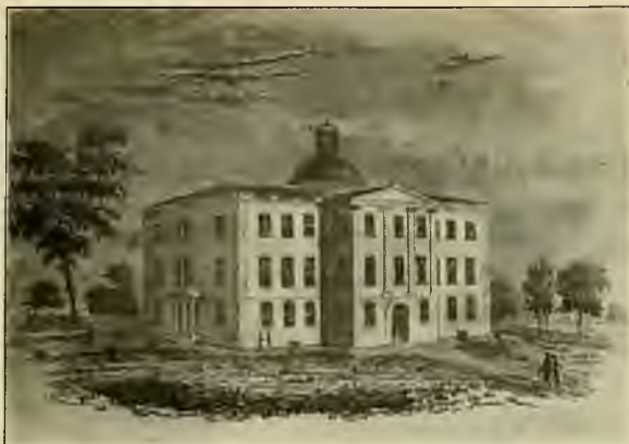
ALABAMA'S STATE HOUSE, TUSCALOOSA From La Tourette's Map of Alabama, 1838