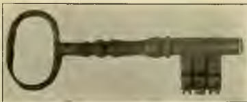
KEY TO THE FIRST STATE HOUSE, CAHABA, 1820-1826