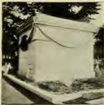
William R. King vault in Oak Cemetery, Selma

WILLIAM R. KING Vice President, Diplomat