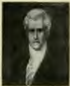
GEN. ANDREW JACKSON Commanding volunteer forces in Creek In- dian War of 1813