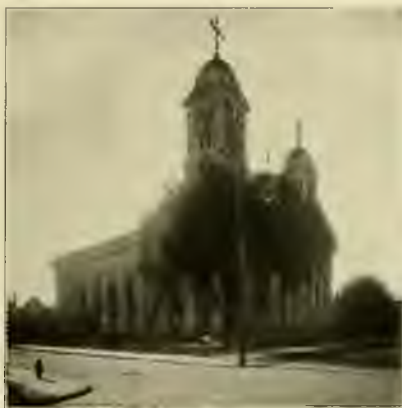
CATHEDRAL OF THE IMMACULATE CONCEPTION, MOBILE