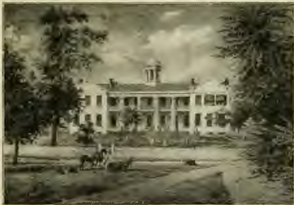
CENTENARY FEMALE COLLEGE, SUMMERFIELD, NOW DEMOLISHED