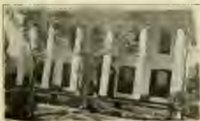
Governor's Mansion, Tuscaloosa