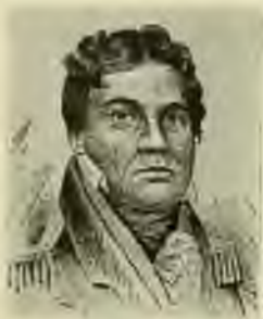
Pushmataha Choctaw chief, who fought with Andrew Jackson's forces in Alabama in the Creek War of 1813.