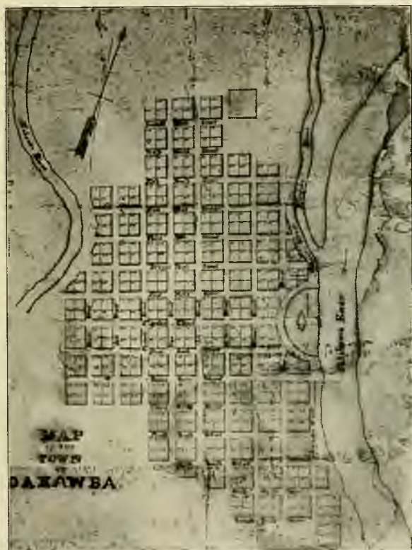
FROM THE ORIGINAL MAP OF CAHABA, ALABAMA'S FIRST STATE CAPITAL