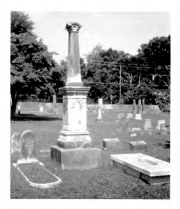
Monument of Governor Robert Patton in Section 7. See page 52