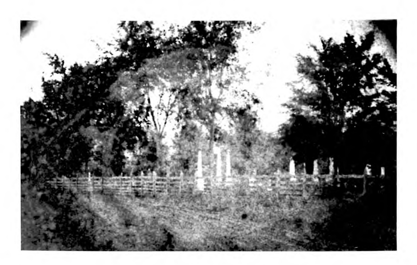
Maple Hill Cemetery circa 1863.