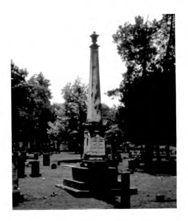
Monument of Governor Thomas Bibb in Section 5. See page 30.