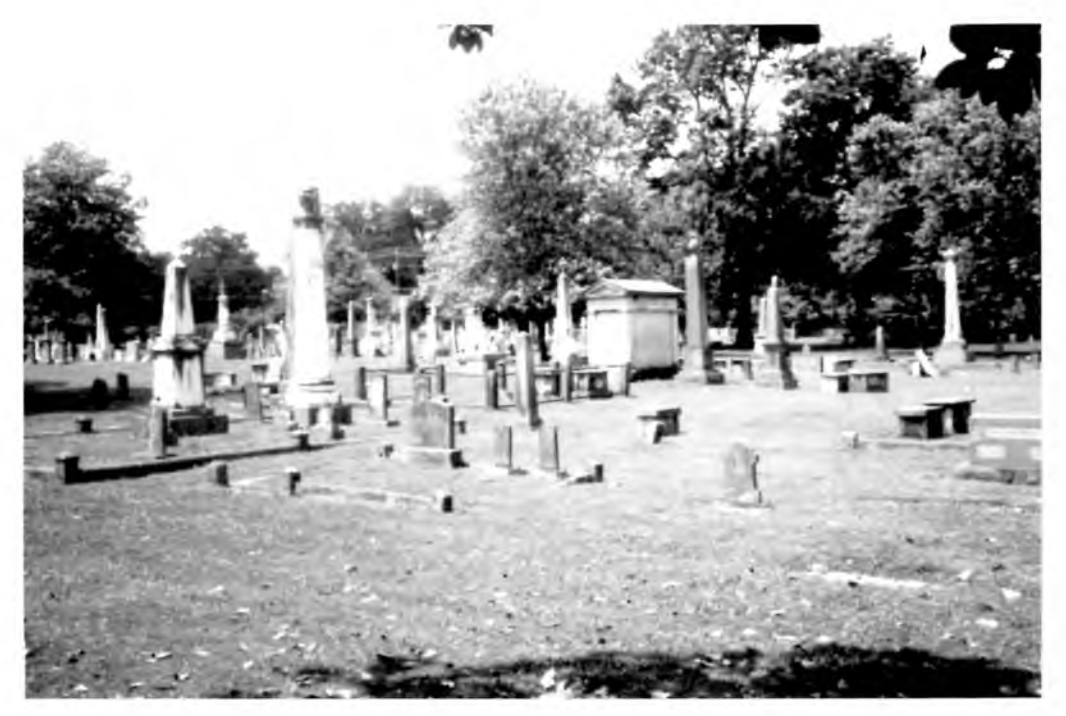
View looking northeast toward Section 2 showing the Bibb Mausoleum.