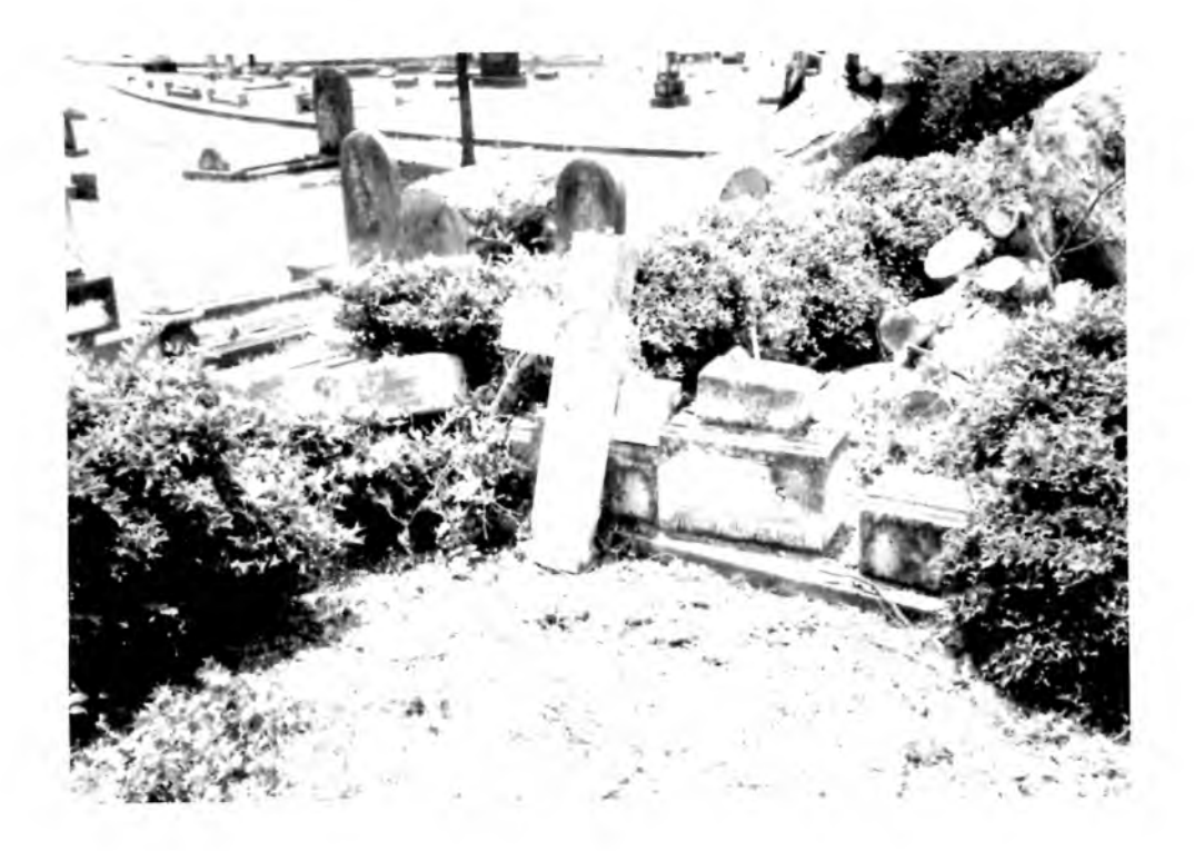
A recent windstorm severely damaged the Spragins-Echols-Watts plot in Section 13. See page 117.