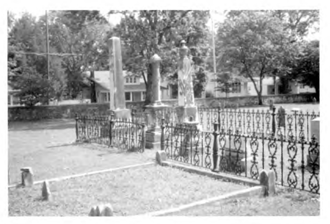
View of Dr. Thomas Fearn's family plot showing iron work and stone wall along Maple Hill Drive in Section 2. See page 8.