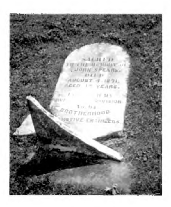
Broken gravestone of John Spears in Section 8. See page 60.