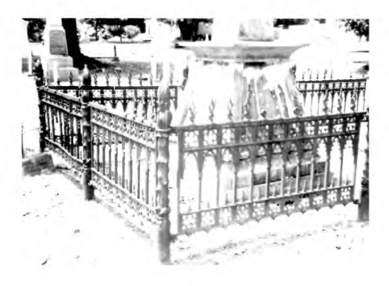
Base of William Brandon's monument in Section 6. See page 43. Two examples of Nineteenth Century iron work.