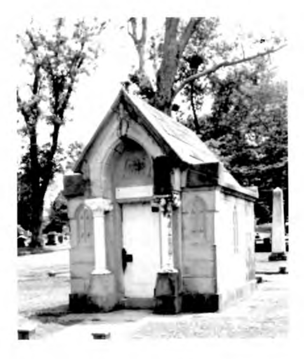
The Burritt Mausoleum in Section 13. See pages 114 and 125.