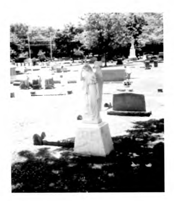
The Lee angel.