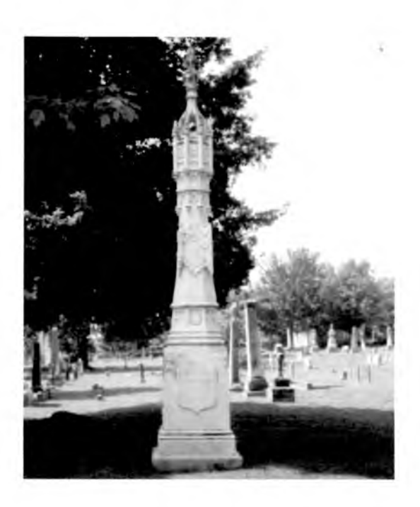
Monument in William Patton plot in Section 6 See page 41.