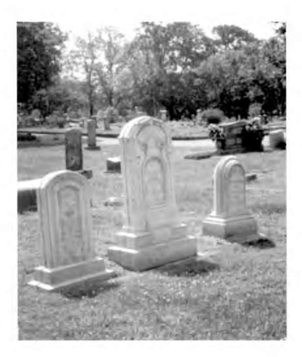
Unique cast iron monuments of the VanDeventer family in Section 13. See page 108.