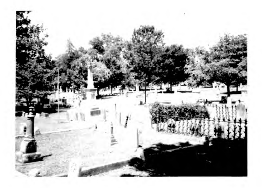
Section 7: Looking toward the Governor Robert Patton marker and Section 8.