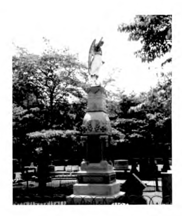
The Fennell angel in Section 15. See page 130.