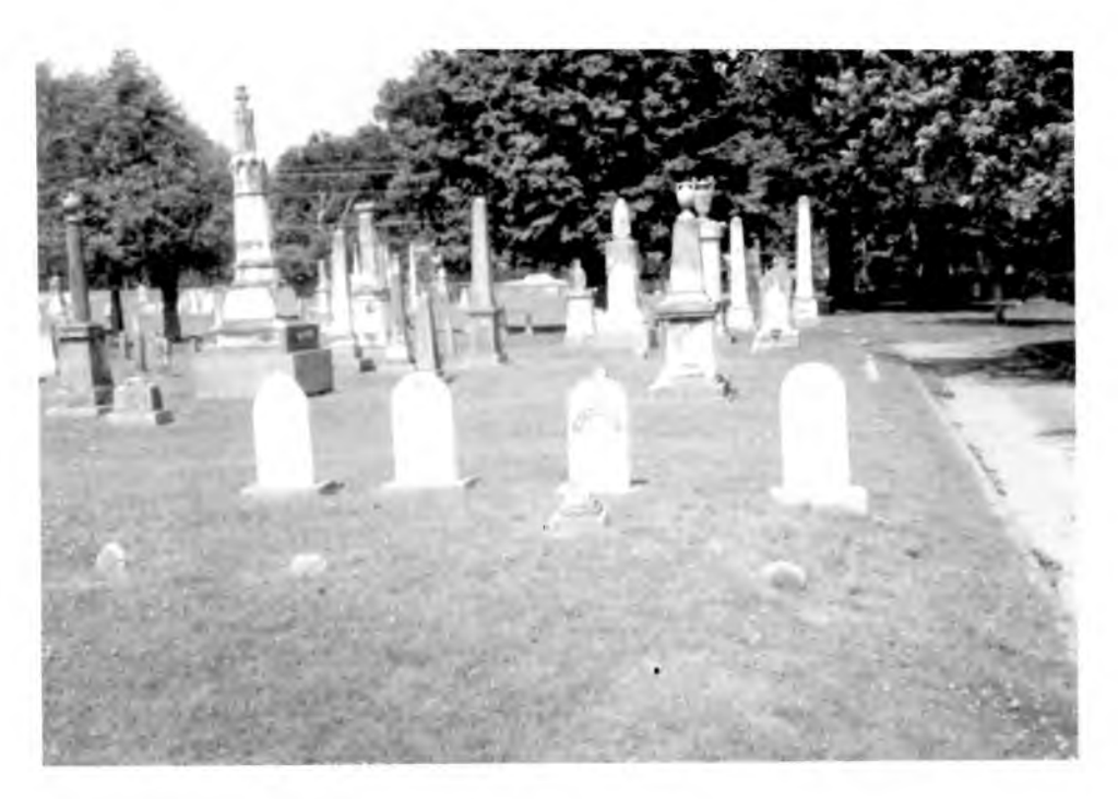
Recently restored markers of the Coles family.