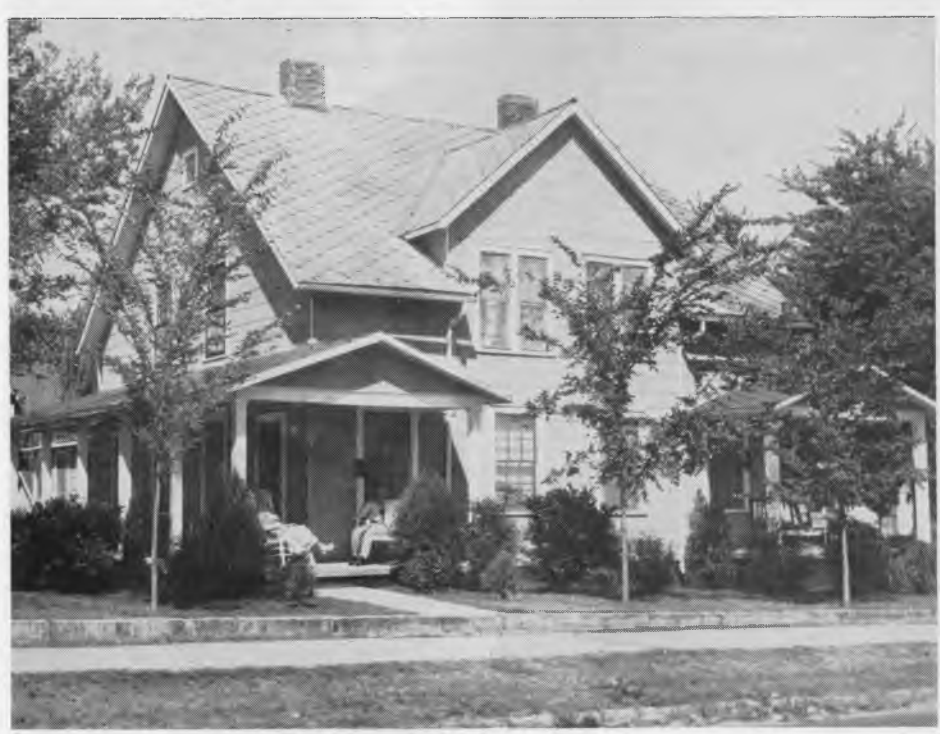
BEAUTIFUL EXAMPLE OF HOME REMODELING IN HUNTSVILLE PARK

Changes and improvements in the community were evident very soon after Lowenstein took over the Huntsville properties. The name of the village was changed from "Merrimack" to "Huntsville Park". On April 18, 1946, announcement was made of the renaming of streets, many of which had been previously designated only by letter symbols.