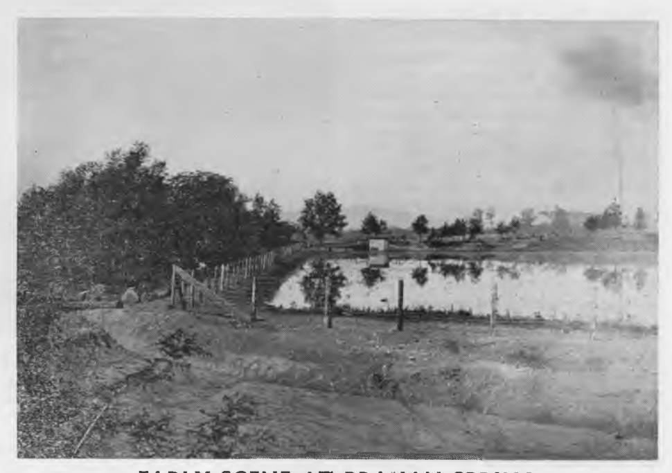
EARLY SCENE AT BRAHAN SPRING