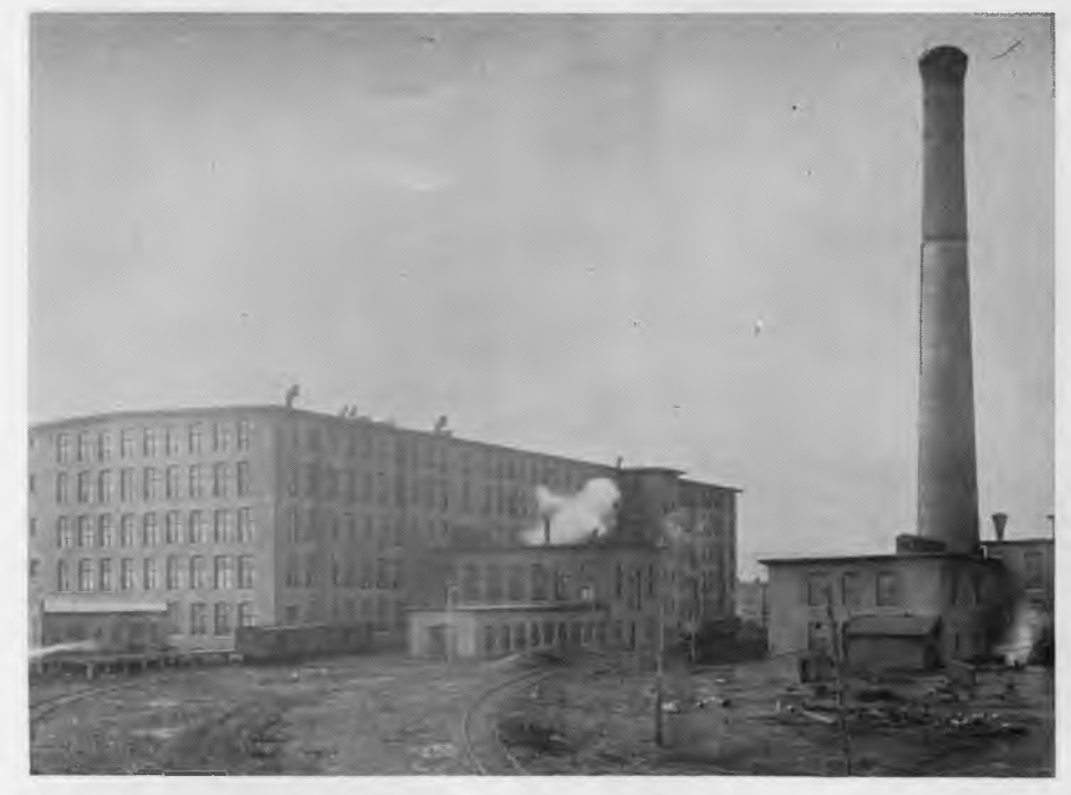
This photograph was taken about 1904 or 1905, shortly after the plant began operating. At that time the clothroom was separate from the mill. Cotton was stored on the first floor of the mill in these early days. A coal car can be seen on the trestle that ran between the mills.