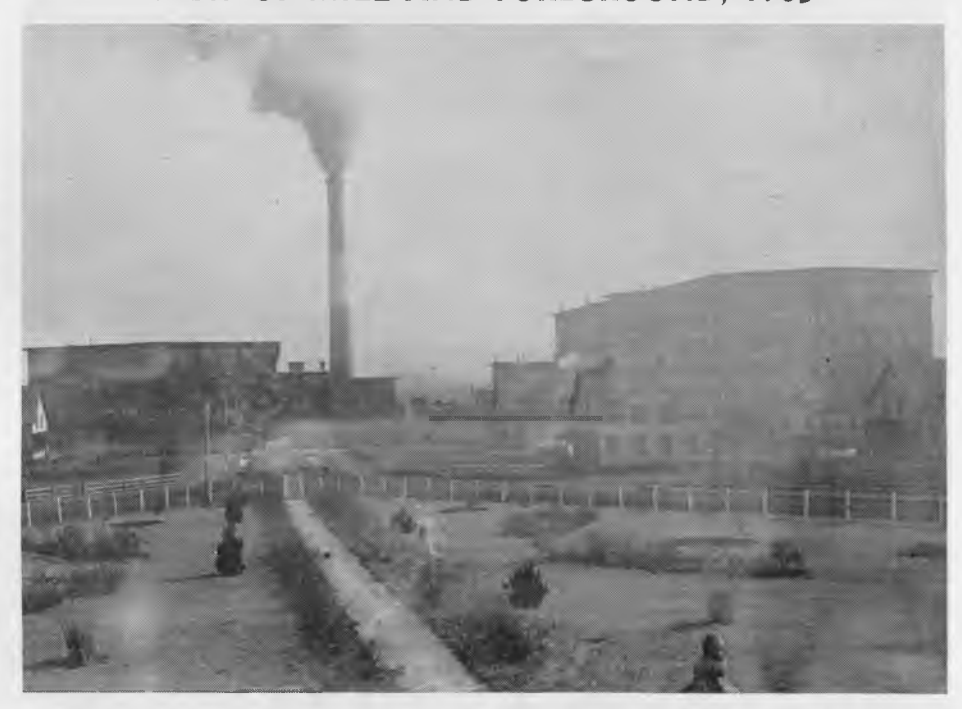
This photograph shows board fences, dirt walks and streets, and recent plantings of shrubbery on lawn in foreground.