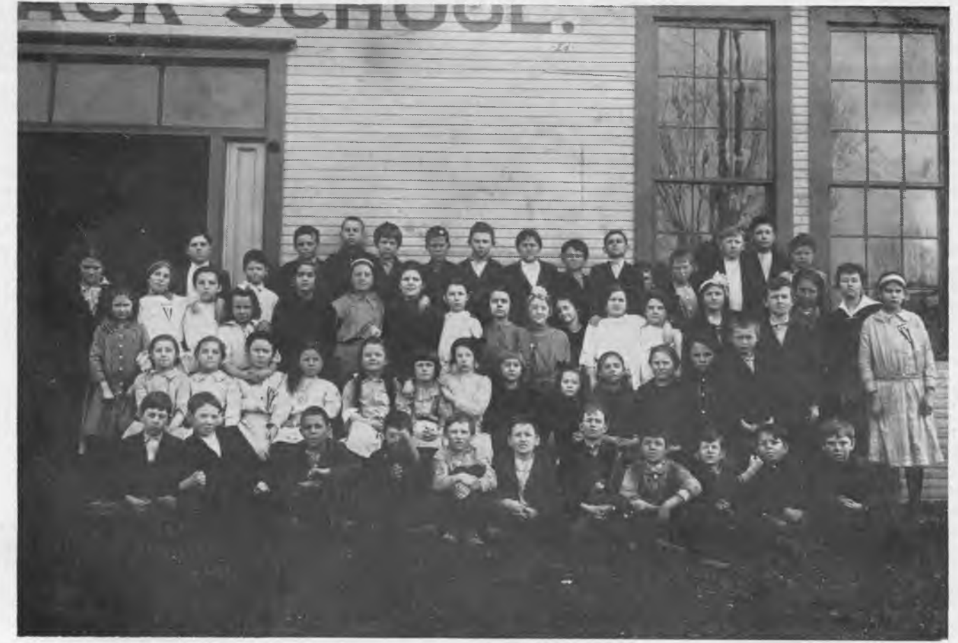
This group of children stands in front of the first school building erected at the present location. It had four rooms and averaged seventy-five children to the room. Miss Laughinghouse was one of the teachers.