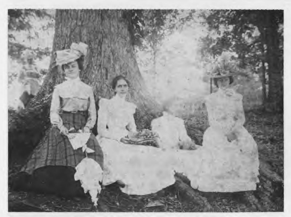
PICNIC AT BRAHAN SPRINGS

This photograph is thought to have been made between 1898 and 1900 and is probably the oldest picture recorded in this book. The ladies are shown enjoying a picnic at Brahan Spring, seated beneath the large oak tree which is still a landmark at that spot.