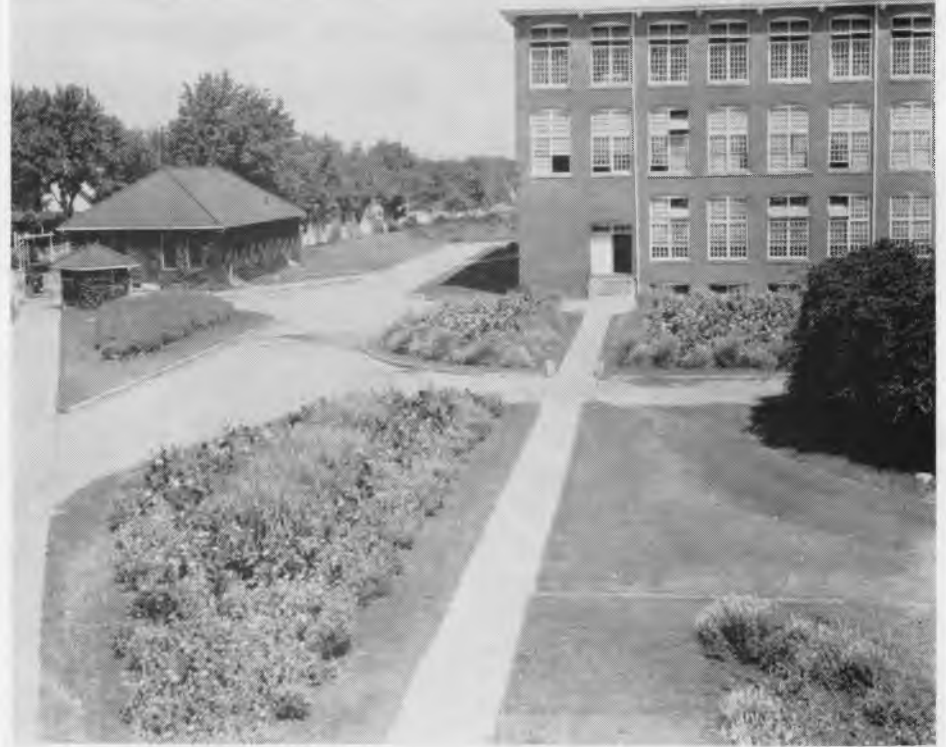
This photograph was made shortly after the paving of Triana Pike and the streets and walks in the mill yard. Many portions of grounds now used as parking lots for automobiles were then covered with flower beds. Large vine at right of picture grew at end of railway trestle.