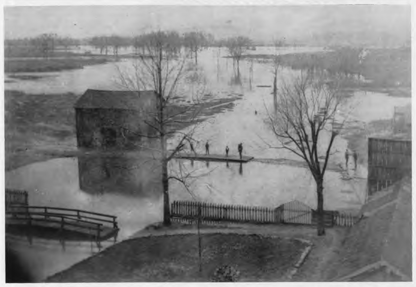
This view, looking westward from the Huntsville Big Spring during flooded conditions in 1875, is representative of the swampy appearance of portions of the West Huntsville area during high water.