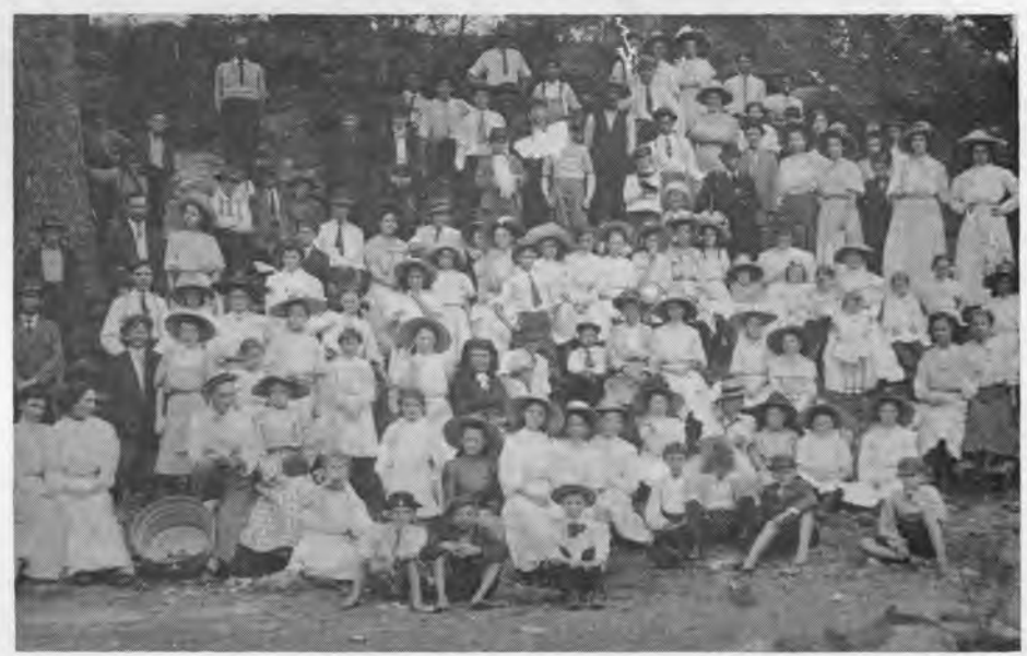
This photograph of the Baptist Sunday School was made around 1909 either at Brahan or Byrd Springs.