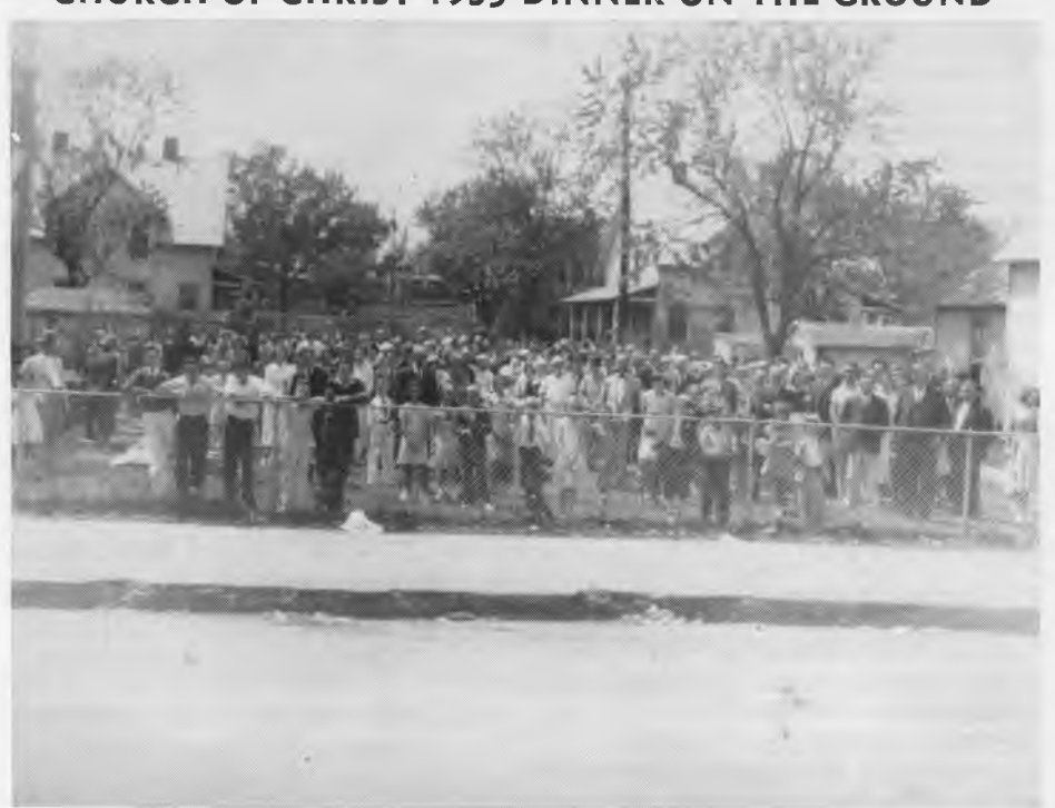
R. E. L. Taylor preached that day to the Church of Christ congregation and dinner was served on the lot between the (old) church and the store building.