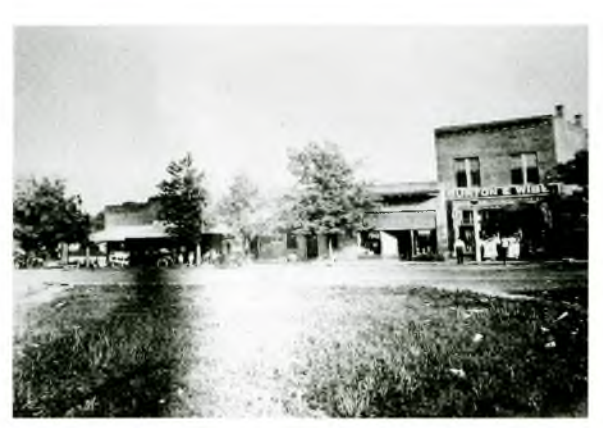
1920's Street Scene

Madison Station, as Madison was called then, grew rapidly and soon tradesmen were attracted to the area. A business district developed on the same location as the present downtown area. Madison Station took on a character retained