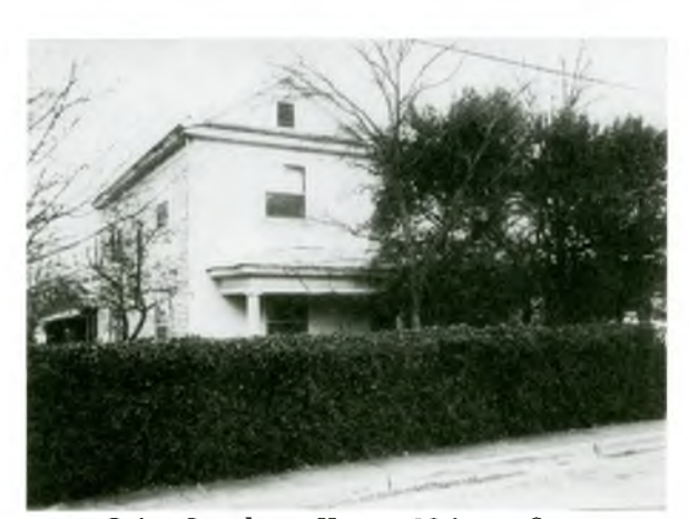
Cain - Steadman Home. 18 Arnett Street

Who knew a leisurely Sunday afternoon ride could turn into a years long restoration/renovation project. My husband and I were killing time when we stopped to look at a sad, neglected old house for sale in Madison's historic district- I had been warned not to even think about another house as we had restored two historic homes in Huntsville, spending literally eleven years in the process. My husband being a native of Huntsville was not too keen on moving