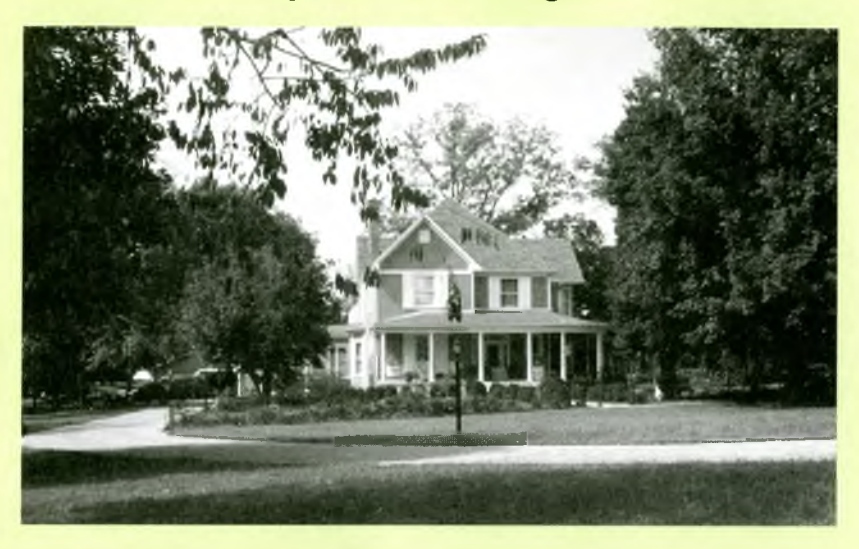
Kyser-Sensenberger House. 1910. 17 Front St.

The Kyser-Jones House has a veranda with Tuscan columns that curve to the right side of the house. This curved portion serves to cover a side entrance to the house. The multi-gabled roof is high pitched with a central peak. In front of the house is one of three similar iron fences in Madison made in Cincinnati by the Stewart Iron Works Co. The iron fence is in the Gothic Revival style with arched top gate posts, diamond points, and fleur-de-lys finials. Note also, the leaded glass window to the side of the entrance of the house. Windows of this type were extremely popular in the late 19th century. Mr. Harvey Anderson built the Kyser-Jones House in 1910. Mr. Anderson was a farmer and co-owner of a hardware store on Main St. with Mr. Frank Hertzler. In 1926, Dr. Kyser purchased the house.