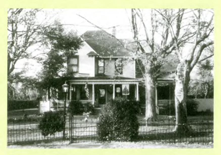
Finney-Vaughn. Ca. 1900. 25 Front St.

The Finney-Robbins House, typical of turn-of-the-century houses, has a steeply pitched roof with an irregular contour. On the left side of the house is a bay window. Bay windows which project out into the environment reflect a change in taste away from the rigid rules of the classical revival. As with the Kyser-Jones House (Photo 7), the Finney-Robbins House has a porch that curves to the side of the house to cover a side entrance. This house is another of the three houses in Madison that has a Gothic Revival iron fence with fleur-de-lys accents, all made by the same company. The use of these similar fences attests to the fact that early Madisonians must have had a strong concensus of taste or at least a sense of keeping up with the Jones! The Finney-Robbins House was built by Mr. Frank Hertzler, co-owner of a hardware store on Main St. with his neighbor, Mr. Harvey Anderson.