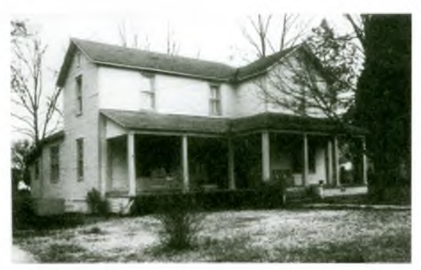
Thomas - Wheeler Home 307 Church Street