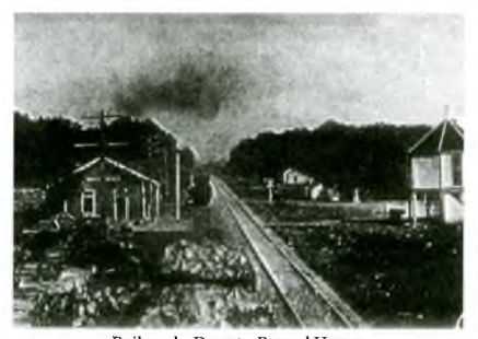
Railroad - Depot - Round House

details and forms in the houses, it is hoped that people will come to understand the late Victorian-early 20th century periods in architecture and the relationship of the Madison houses to these periods. While the houses are closely related stylistically, the history of the people connected with each house is unique and it is the history of