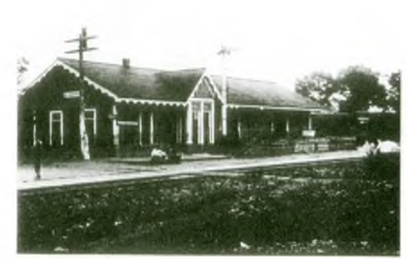
RailRoad Depot, Madison, AL. Depot faced south toward tracks and Main St. from Front Street.

expansion of the town and for a shift in the economy in which farming lost its supremacy. Anther factor contributing to the growth and economic shift of Madison was the new Huntsville- Madison County Jetport in 1966. Madison has