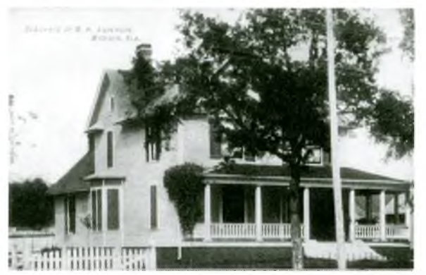
Kyser-Sensenberger House. 17 Front St.

We bought our house in 1997 at an estate auction. The house was dilapidated, the roof was falling in, and there were holes in the floors and buckets on the back staircase catching water. My husband saw the potential