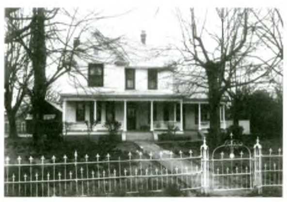
Finney-Vaughn. 25 Front St.

When we purchased it, the Front Street house was very sound structurally but needed some tender loving care. Neither of us fully understood or appreciated the time, effort or financial requirements associated with living in and maintaining older historical structures. The first year we personally applied more than