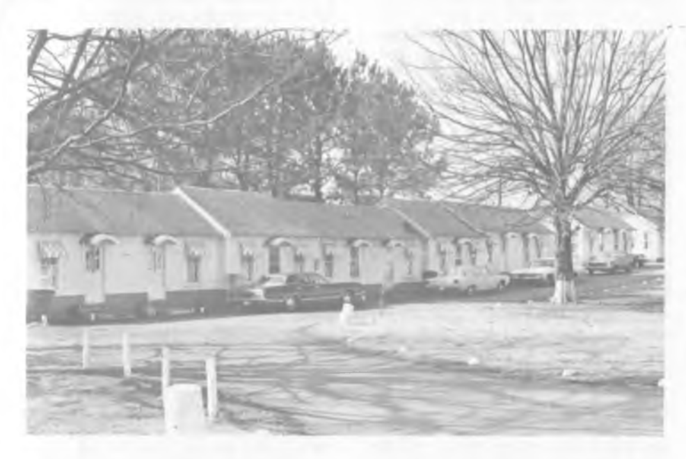
Maple Grove Motel illustrating two early phases of motel design.