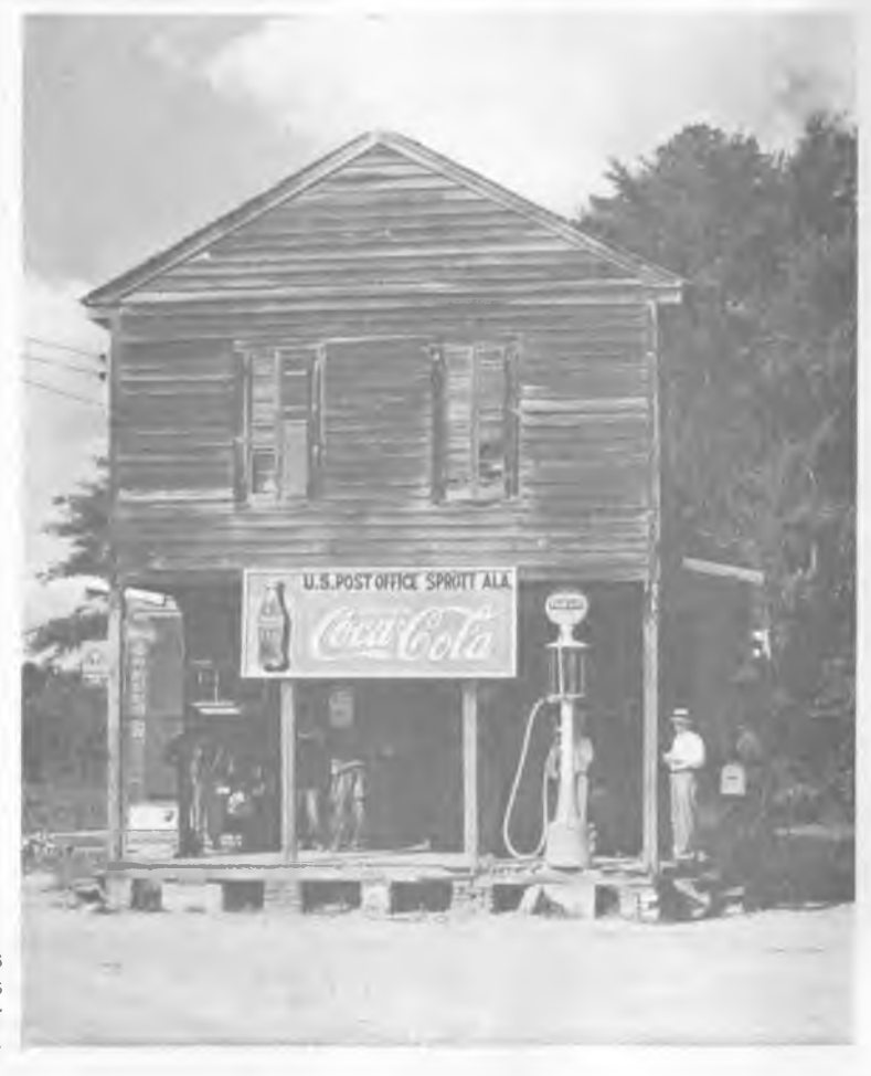
Crossroads store and gas pump. Walker Evans, 1936.