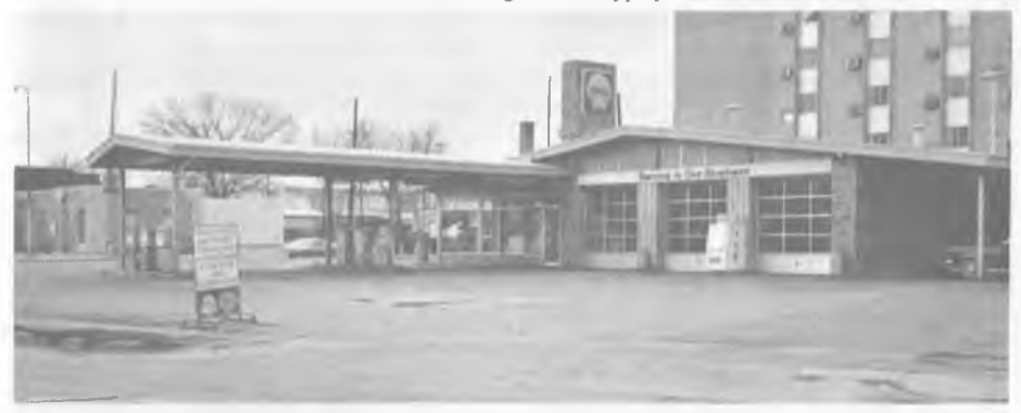
top, nineteen-fifties; middle, nineteen-sixties; bottom, late nineteen-seventies.