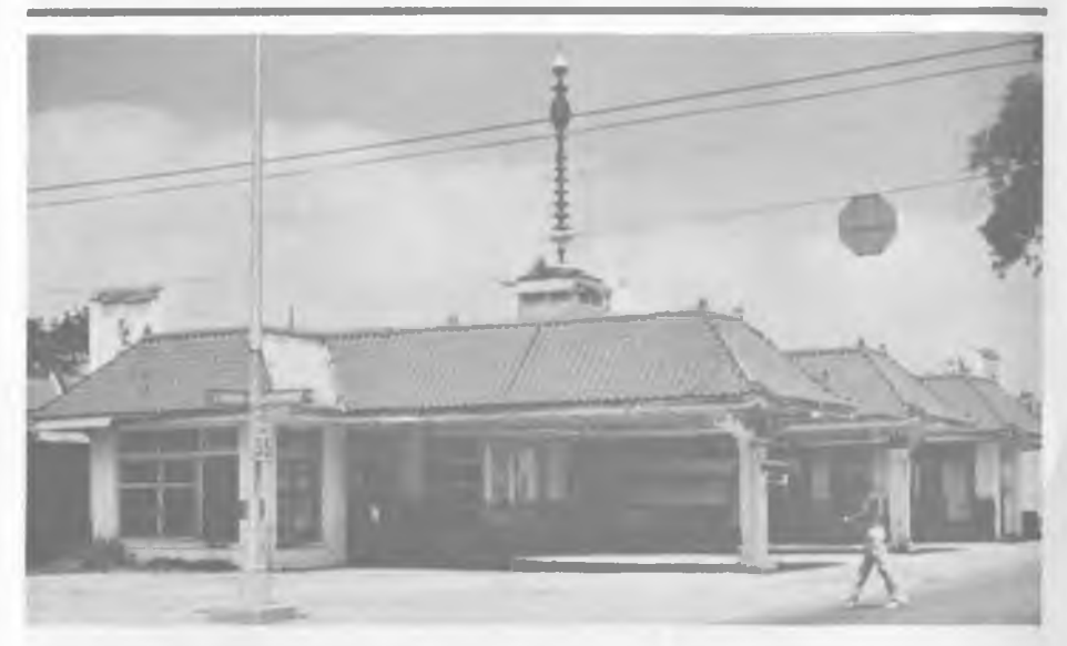
Above, Mobile's Chinese station; below, Mammy's Cupboard in Natchez.