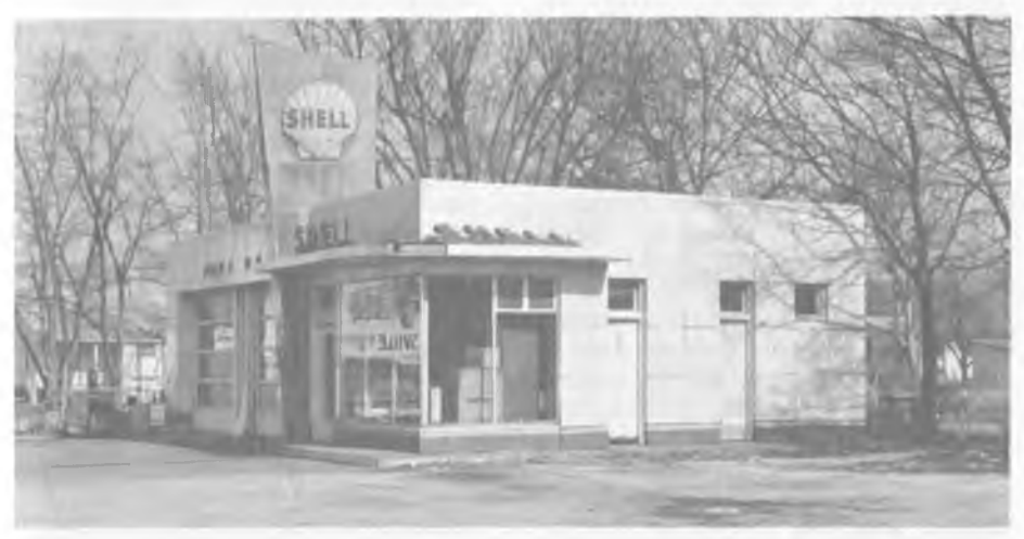
Three decades of Shell station design which typify the national trends: