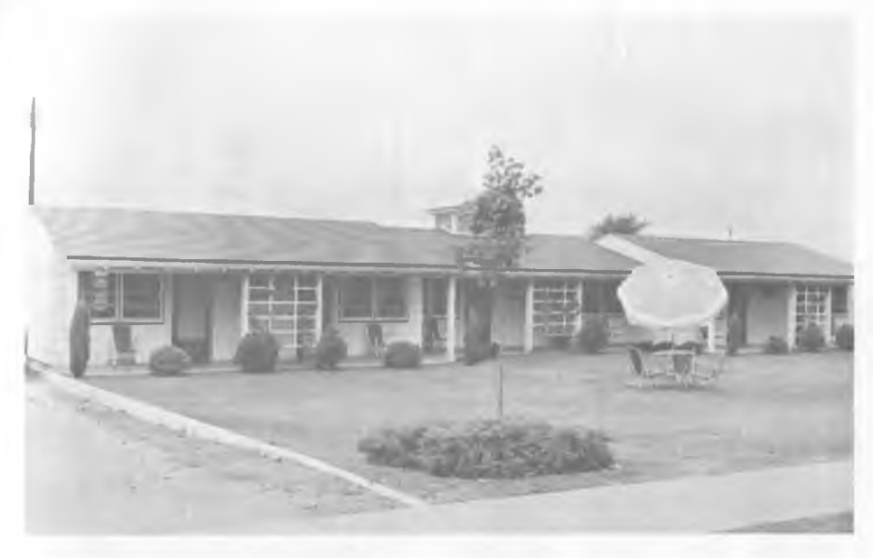
The Monte Plaza Motel, above, and the El Rose Motel, below.