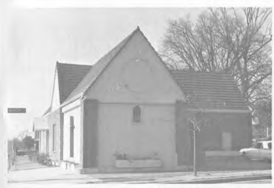
The Pan Am station, above, now serves as a church, while the West Holmes Street station, below, stands abandoned.