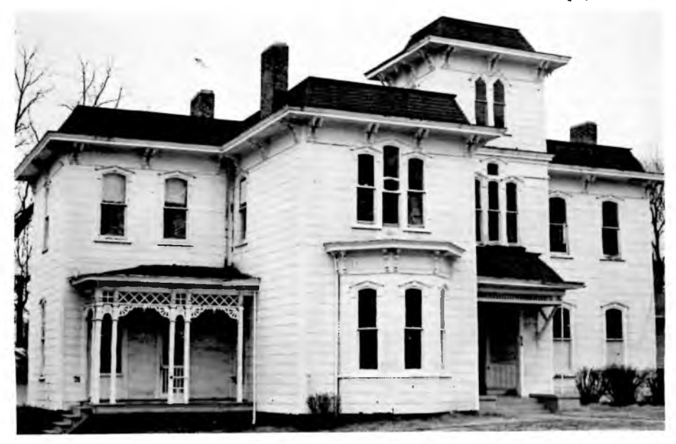
705 Randolph, 1889

Obviously a lot of land was needed to accommodate all these separate structures. The kitchen was removed from the house to minimize the danger of fire to the main structure and to keep it cooler since the cooking fire had to be kept burning all summer. This dispersal of household activities was rendered functional by the presence of slaves who carried out the chores. The result was a town with homes set on spacious grounds but concentrated within a mile of the courthouse.