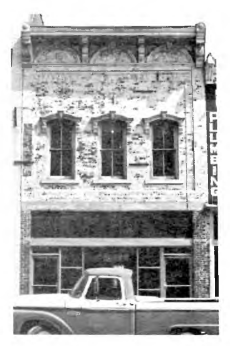
BEFORE: This two-story brick store house at 106 South Side Square was built in 1883 but through the years has suffered thoughtless modernizations and wanton neglect.

take advantage of the rehabilitation provisions of the tax law, he must have the rehabilitation certified by the Secretary of the Interior. This is