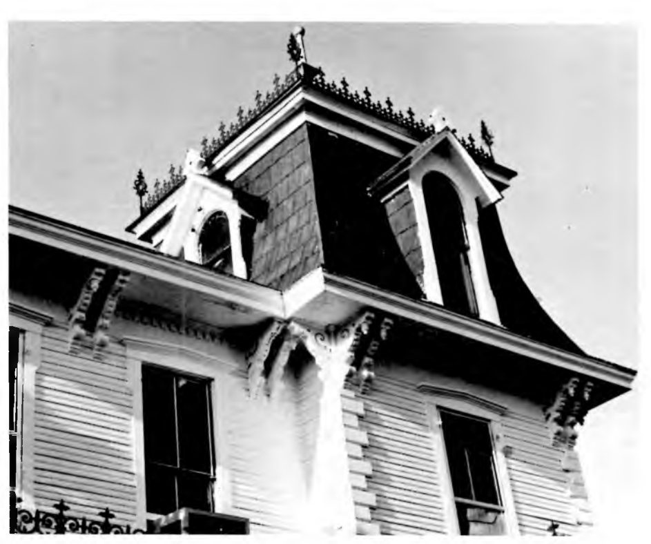
127 Walker, 1889