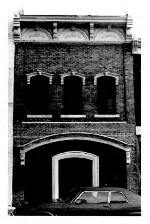
AFTER: A sensitive renovation has highlighted the surviving original elements, the cleaned brick and repainted cornice, while remodeling the ground floor to both harmonize with the existing design and provide a contemporary entrance.

sion for review and evaluation, and they will then notify the owner whether the project is consistent with the Secretary of the Interior's Standards for Rehabilitation. Upon completion of the rehabilitation work, the owner must notify the Technical Preservation Services Division, through the SHPO, that the project has been completed and submit appropriate materials documenting it.