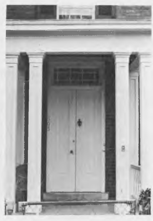
Cabaniss House, 603 Randolph

The main body of the Cabaniss House is the traditional three-bay Federal design, but the porch has square paneled columns, the door is double with each leaf having a single full length panel, and the toplight is rectangular rather than fan-shaped, all distinctly Greek Revival treatments.