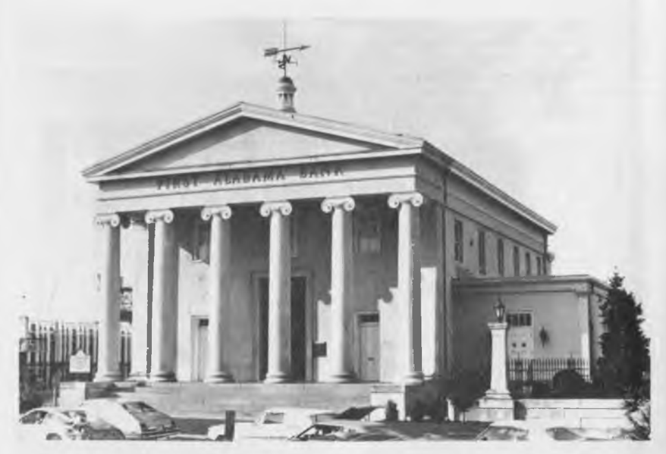
First Alabama Bank, West Side Square