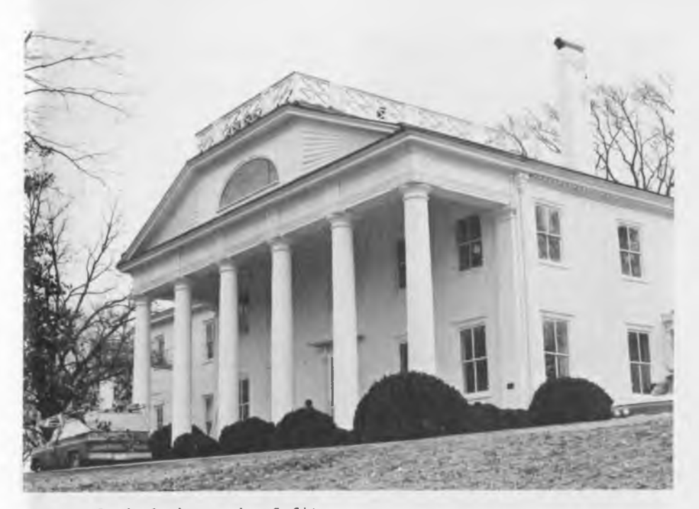
Pope House, 403 Echols

Steele had the task of fitting a giant portico onto a Federal house. Greek Revival was the current rage, but a two-story porch in that massive style would overwhelm the delicate detailing of the existing structure. The solution he chose was to erect a portico with the scale of the Greek Revival but lightened with Federally derived motifs. It features six colossal columns of the Roman Doric order which are unfluted and more elongated than the Greek and hence less massive. pal Church of the Nativity