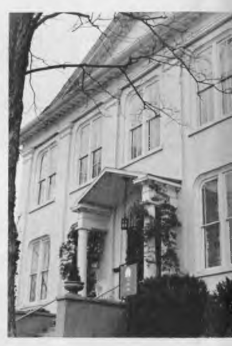
Cox House, 311 Lincoln

At a still later date, an owner desired to update the house to the Italianate style. During this remodeling which probably occurred shortly after the Civil War, the windows were rounded at the corners and the double Italianate front doors were installed. The last alter-