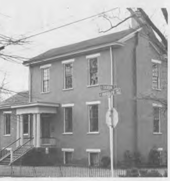
Steele House, 519 Randolph

Steele's own home at 519 Randolph fitted this description before later alterations were made. Greek Revival details were added to the house after it was completed; these