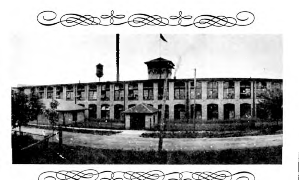
LINCOLN MILL Destroyed by fire - February 19, 1980