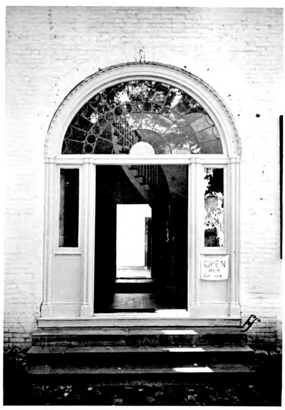
The front entry of the Weeden House