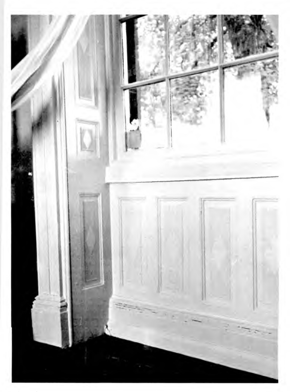
This window in the northeast parlor of the Weeden House is elaborately ornamented with a variety of decorative motifs.