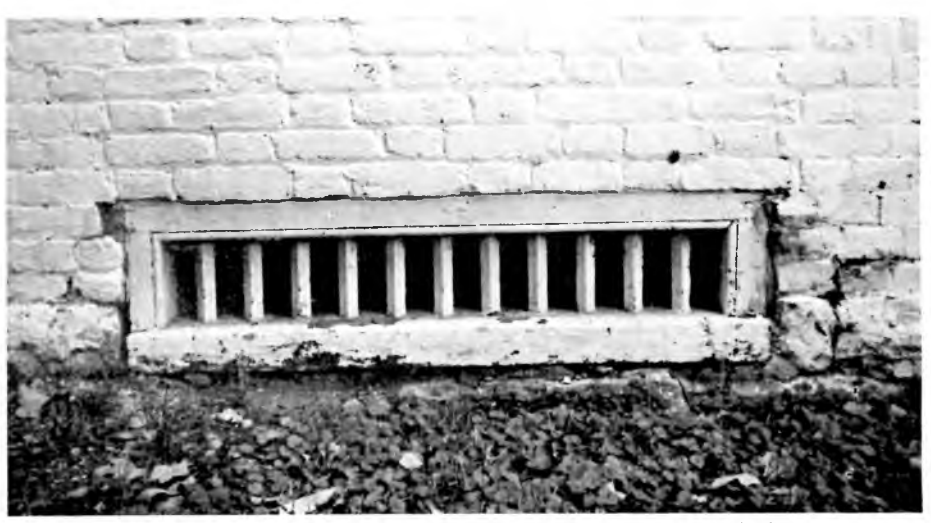
A foundation vent illustrating the diagonally placed bars and the three-quarter round mold framing the opening. Notice the Flemish bond of the surrounding brickwork.

The design of the wooden foundation vents is common for houses of this period but is, nevertheless, very elegant for so prosaic a device. The vertical bars of the vents are