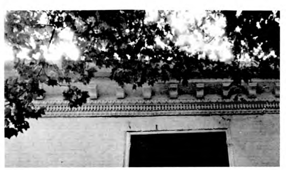
The roof cornice and frieze on the front facade.

carved piece. (These flutes are repeated at a much smaller scale on one of the upstairs mantels—an interesting example of design continuity.) The underside of the boxed cornice is decorated with a series of carved wooden blocks called, in the Corinthian order, modil—lions.