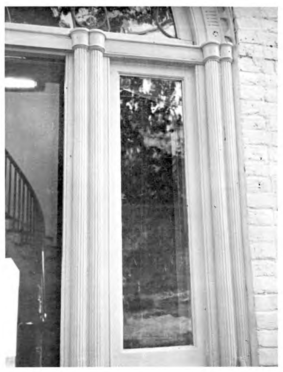
The sidelights of the front entry are flanked by extremely attenuated, reeded columns grouped in pairs. The leaded glass of the sidelights has been replaced.