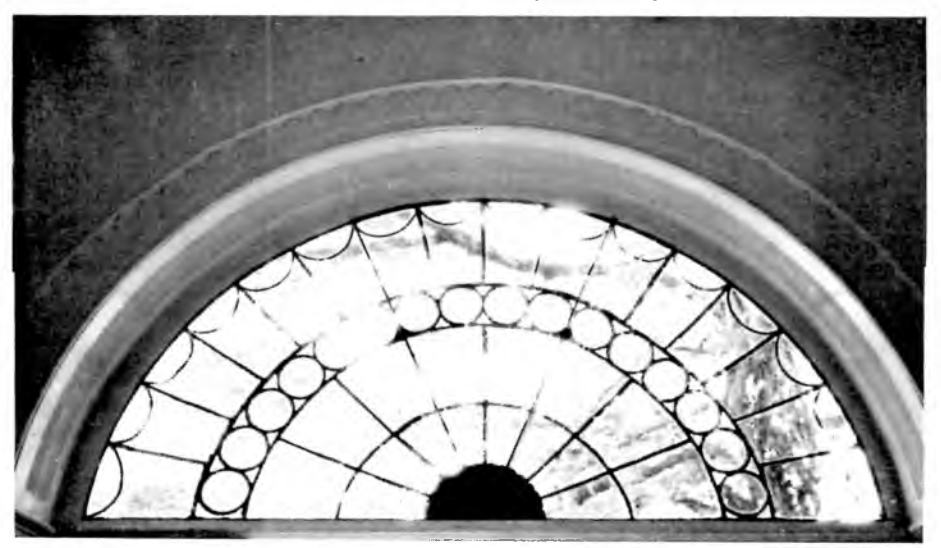
The leaded-glass fanlight of the front entry as seen from the inside.

The pine flooring in the entry is fairly narrow, less than three inches wide, and has tight joints, whereas flooring five to six inches wide with open joints is usual for the period and is found in the other Weeden House rooms. It was first thought that later flooring had been laid over the original wide flooring in the