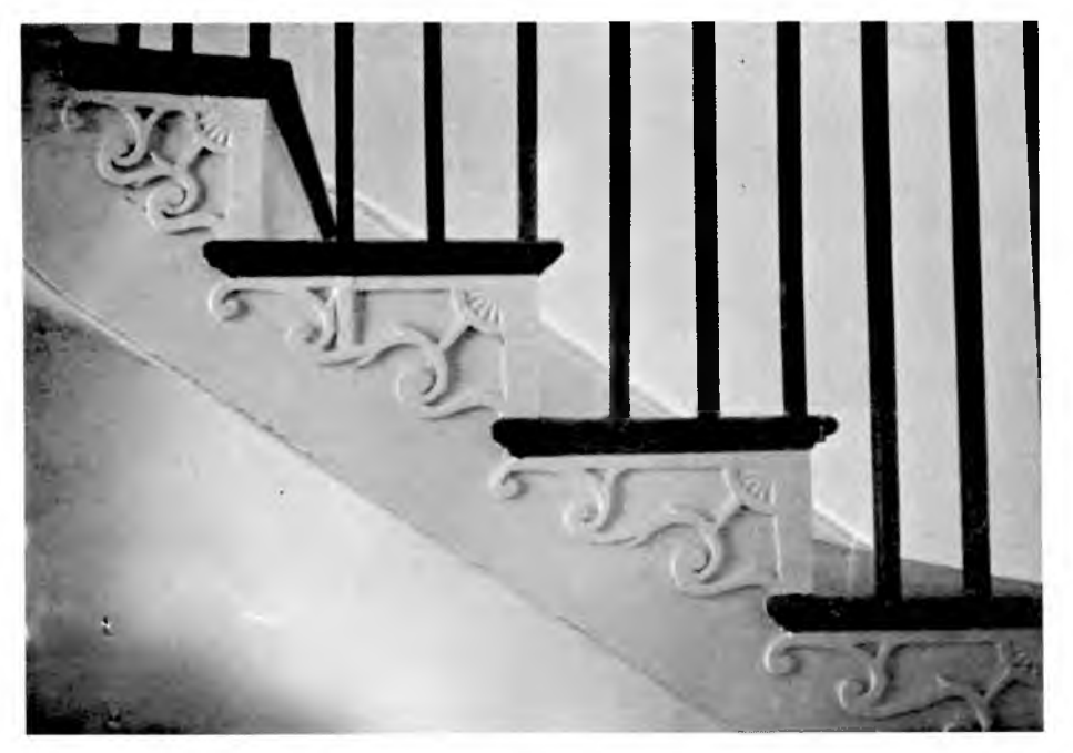
This detail of the stair scrolls shows how the pattern compresses as the stairway begins to curve.

ters have been observed by this writer, either here or elsewhere, although there must be some exceptions.