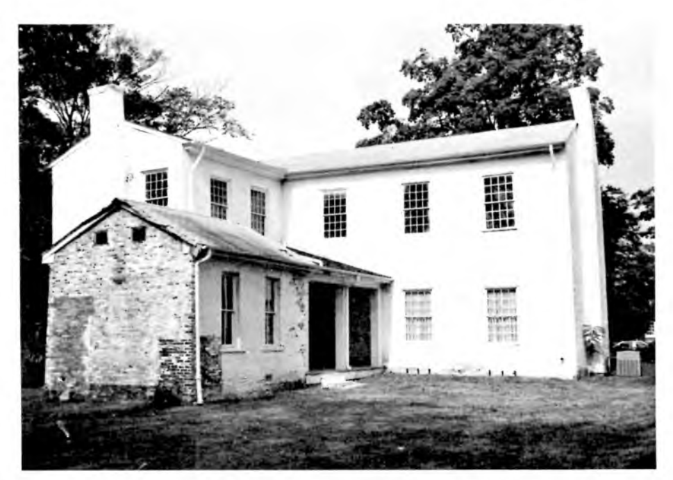
Rear view of the Weeden House from the southeast