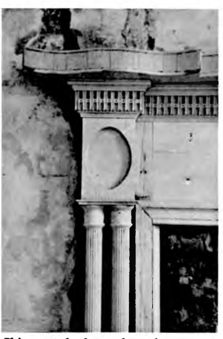
This mantel, located on the unrestored second floor of the Weeden House, displays the delicate reeding and fluting that were typical of Federal period decoration.

is a replication of the original finish and, moreover, is the most frequent color found on Federal and Greek Revival mantels, a conclusion that is based on the results of scraping numerous mantels. The black color contrasts handsomely with the strong Adamesque colors, such as the deep pink found in the dining room. On