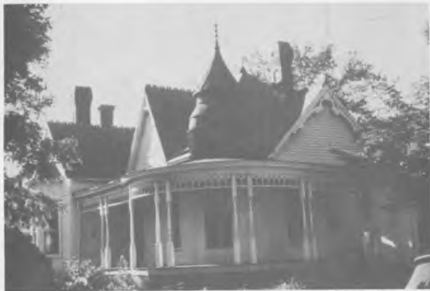
W. Holmes Avenue. A Victorian cottage with Moorish turret. Yet another one in the urban renewal area. 1968 photograph.