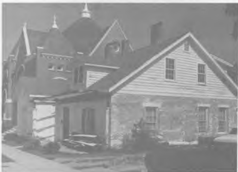
203 Lincoln Street. The O'Neal-Miller House. Owned by the Central Presbyterian Church, this house was demolished in 1982 to provide open space for future church needs.