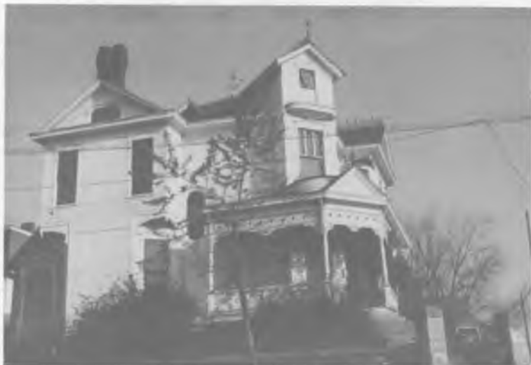
Fountain Row (formerly named Oak Street). The Hutchens Home was near the present Public Library. 1963 photograph.

325 Franklin Street - northeast corner of Franklin and Gates. The George R. Holmes Home. The Huntsville Clinic was located in this house prior to its demolition. A brick office building is presently on this site.