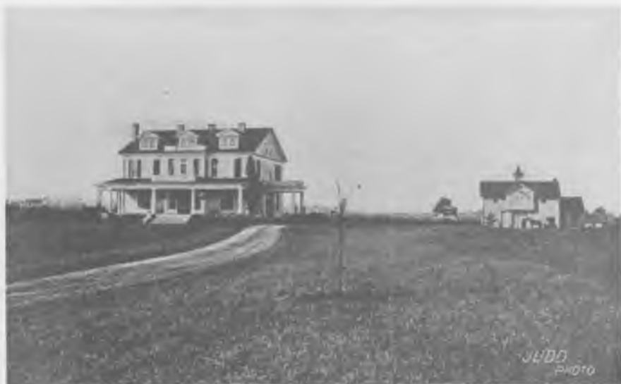
Oakwood Road at Pulaski Pike. Orchard Place, home of Maj. Milton Moss. Built c. 1904, it was originally called Hilltop. In 1925 the house and 228 acres were purchased for use as a Golf and Country Club. After the house burned in August 1933, the barn was used for a while as the clubhouse. Huntsville Country Club still occupies this site.