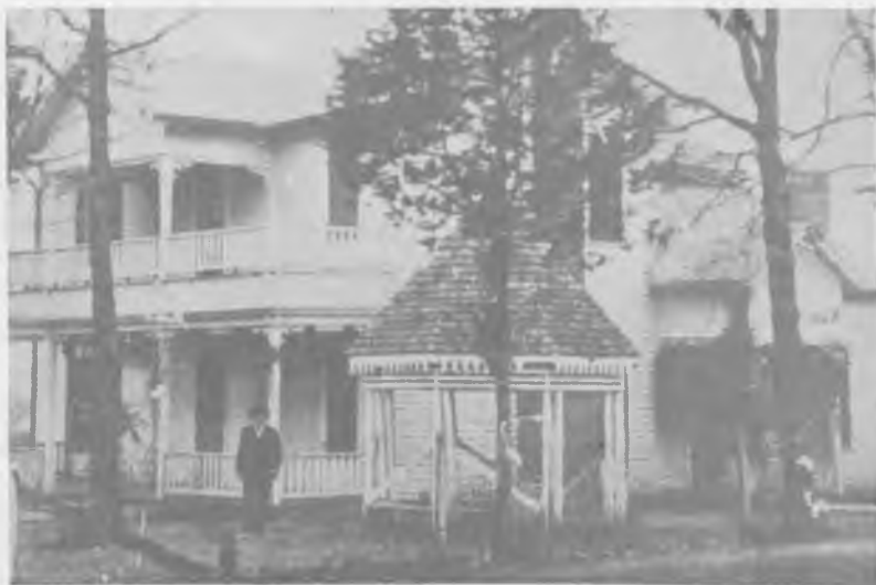
Church Street. The Hertzler Home.