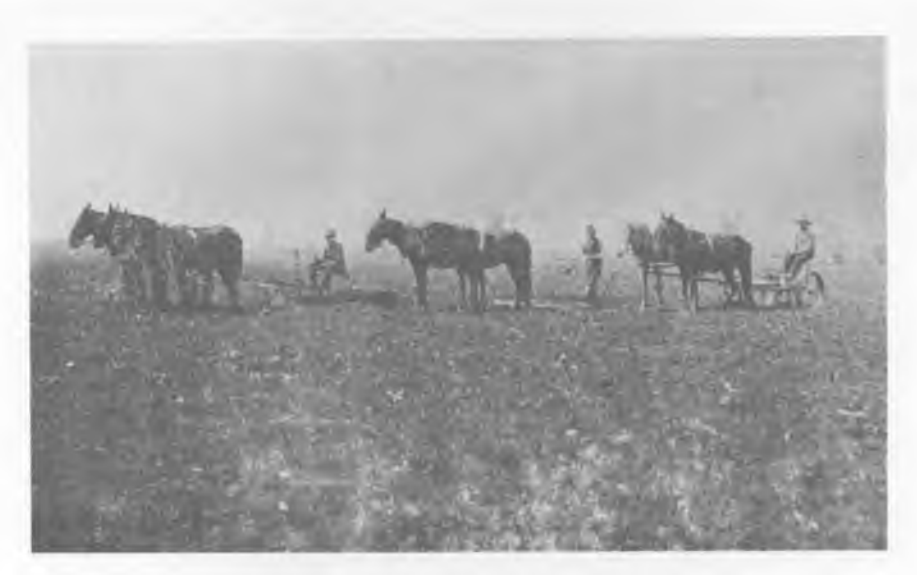
Four Horse Double Disk Slant Tooth Harrow PLANTING CORN AT CAVE SPRING FARM The Chauffeur of a one-mule-power bull tongue will never make a record-breaking corn crop.

Field crops produced in Madison County - $11,656,500. Live Stock sold - $3,607,000. Total production - $15,263.500.