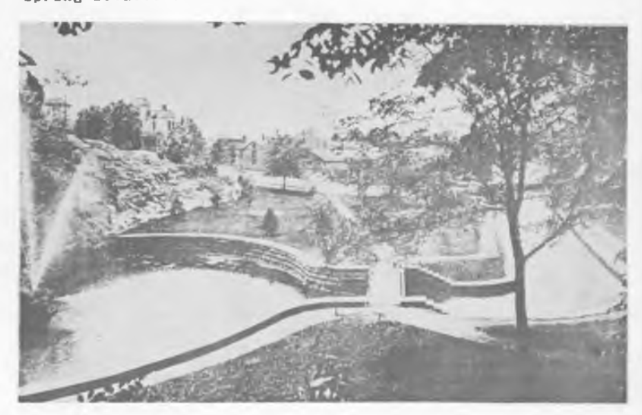
HUNTSVILLE'S BIG SPRING - THE BEAUTY SPOT OF THE SOUTH

Owing to the altitude of about 650 feet, the mild climate, the freedom from malaria, the pure water and the cleanliness, Huntsville is the healthiest place to be found anywhere. During the Spanish American War the surgeon general of the United States Army declared that Huntsville in Madison County was the second healthiest