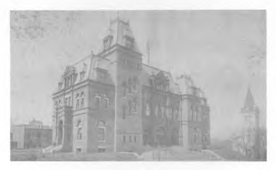
UNITED STATES GOVERNMENT BUILDING

Commonly known as the Post Office, this structure was built during 1888-90 at a cost of $95,000. It was located on the west side of Greene Street between Eustis and Randolph avenues and was demolished in 1954. A municipal parking lot now occupies the site.