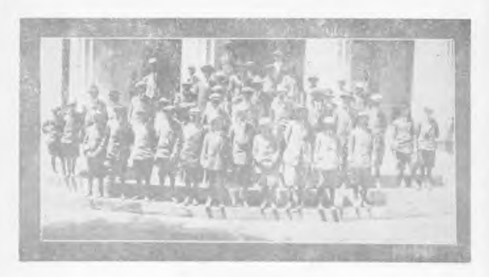
MADISON COUNTY PIG CLUB