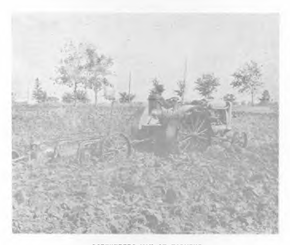
SCIENTIFIC WAY OF FARMING

Several hundred of these tractors are now in use on Madison County Farms.