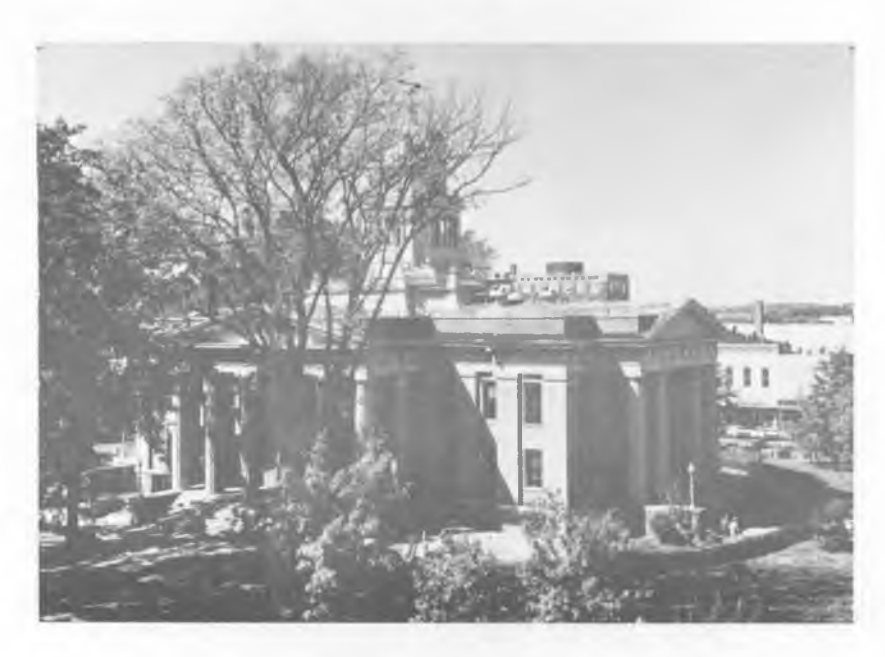
COUNTY COURT HOUSE

Built in 1913 at a cost of $110,000; demolished in 1964 to make way for the present courthouse. This view is from the southeast corner of the square.