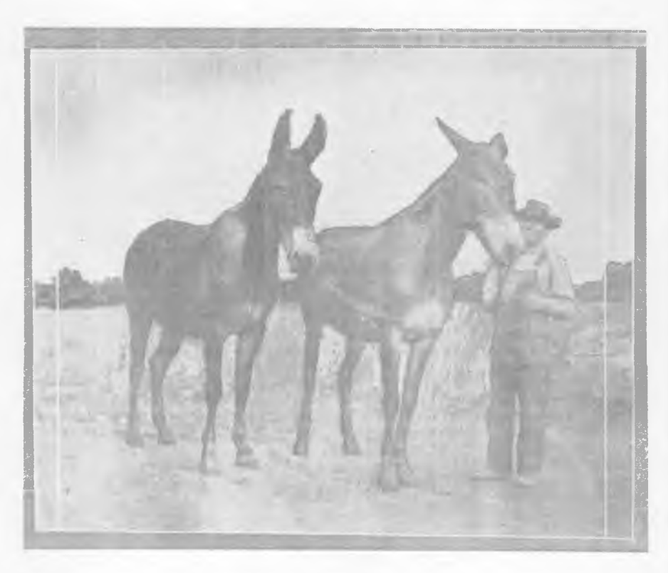
A MADISON COUNTY PRODUCT

Madison County is unsurpassed as a live stock and hog producing county. The Tennessee Valley produces the finest horses in the United States. The Piedmont Stock Farm is equal to any blooded stock farm in the United States. Hog raising in Madison County has untold advantages and beef is produced very cheaply. Conditions all favor the cheapest production. Live Stock can be raised 40 per cent cheaper than in the North.