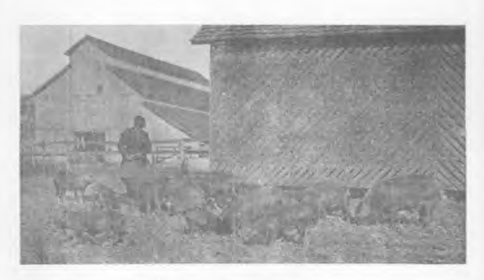
CAVE SPRING FARM BERKSHIRES