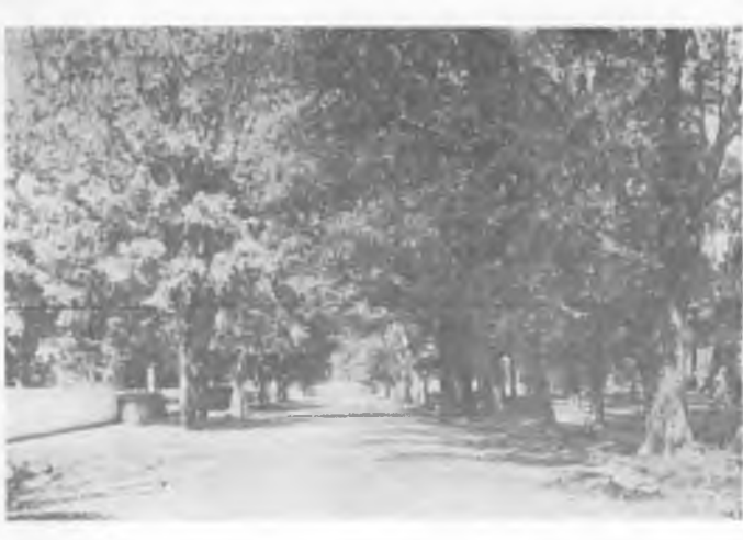
FRANKLIN STREET LOOKING SOUTH

Electric power rate is two cents per kilowatt for all over five hundred kilowatt hours. For Cotton Mills the rate is first 35,000 kilowatt hours, 1 cent. All over 35,000 hours is eight mills.