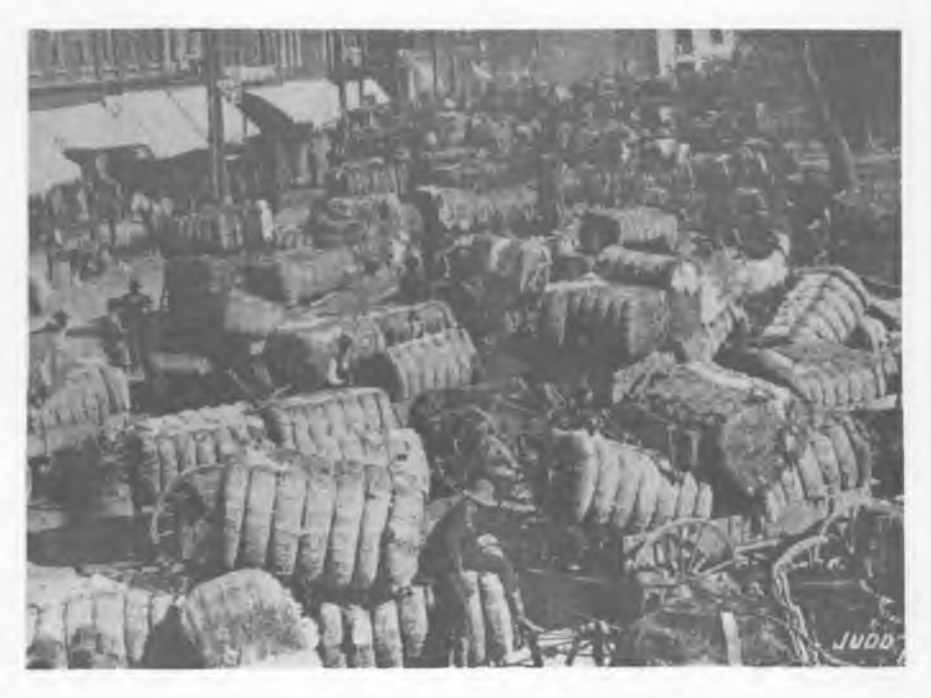
STREET SCENE OF COTTON IN HUNTSVILLE

Many other edifices, the architecture of which is so striking yet so appealing, still mark the place of their erection.