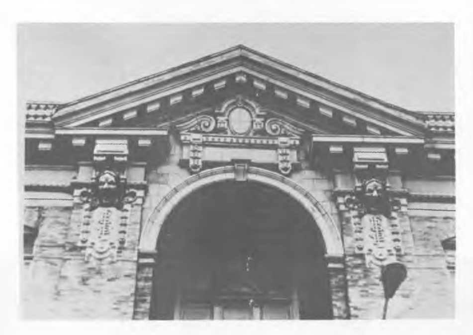
Detail of the richly decorated central pediment of the Elks building. The arch is flanked by theatrical masks and the intertwined letters B.P.O.E.

The Elks Theatre, constructed in 1906 at a cost of $110,000, was located on the north side of Eustis Avenue between Greene Street and East Side Square. It was demolished in 1967.