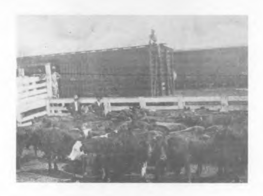
Live Stock can be raised 40 per cent cheaper than in the North