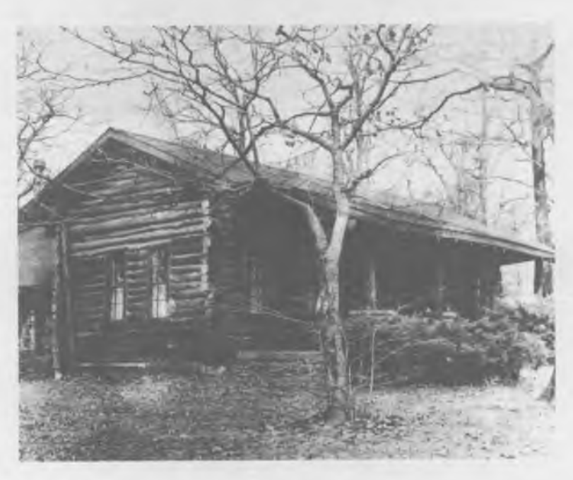
Old log house on Panorama Drive, Monte Sano, 1970 view.

Quite a few of the men puffed slowly at long pipes, filled with tobacco furnished from his plantation by Charles Cabaniss, owner of the first cotton mill in Alabama, whose father had been that extensive Virginia planter who had placed upon the market the famous Cavendish brand of the leaf.