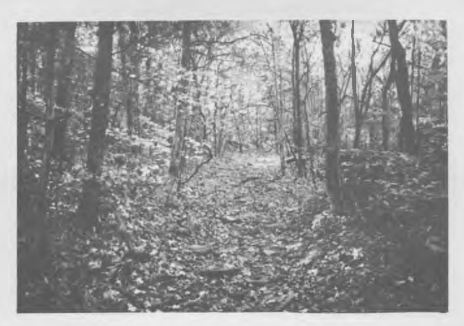
The old Blevins Gap road today seems hardly more than a wide footpath; however, in years past, the road was used by wagons and buggies, as well as by pedestrians. At one time, a stage-coach regularly traveled the road.

Decatur [a county from 1821-1825 in the area between the Flint and Tennessee Rivers]3 I went five miles when I came to Blevins gap, an opening in an otherwise impassable mountain. and after wading through creeks and mud holes, eight miles far-ther I came to Huntsville, the county seat of Madison County, being the first village I have seen for two hundred and eight miles and containing the first brick dwelling house I have seen since leaving Virginia.