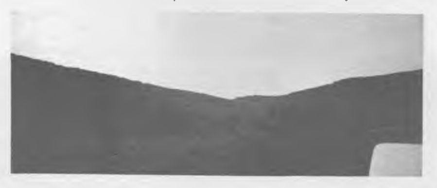
Blevins Gap from the Big Cove area east of Green Mountain.

leaving Flint, which is the boundary between