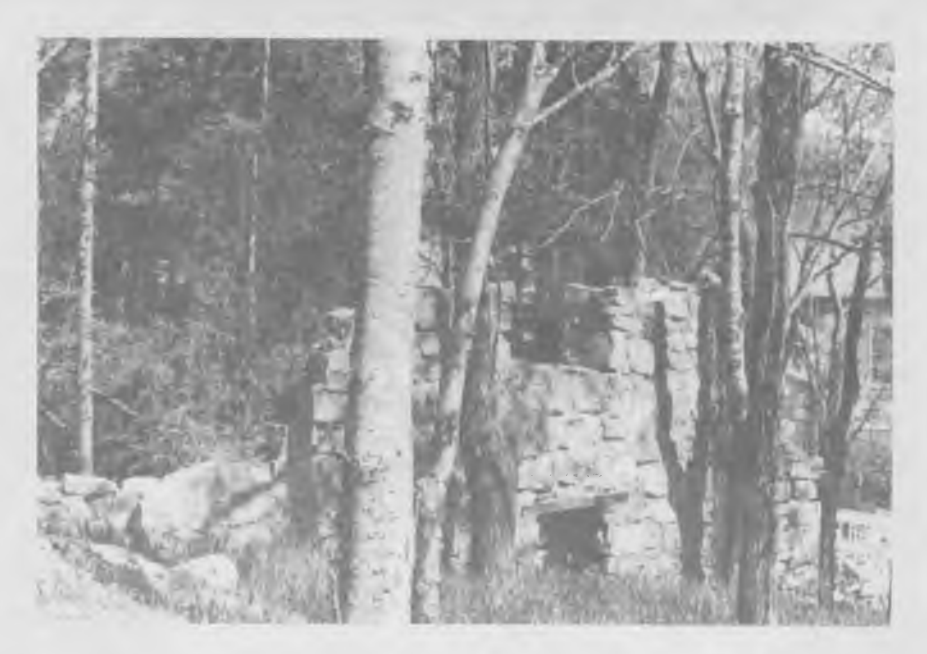
Part of the stone walls remain from the bottling house of Monte Sano Dairy.

wagon-load of milk to Huntsville, she came upon a number of soldiers marching in the oppressive heat. Taking pity upon them in their discomfort, she gave them some of her cool, refreshing milk to drink. They were troops from the Spanish American War who were stationed in Huntsville during the late 1890's.