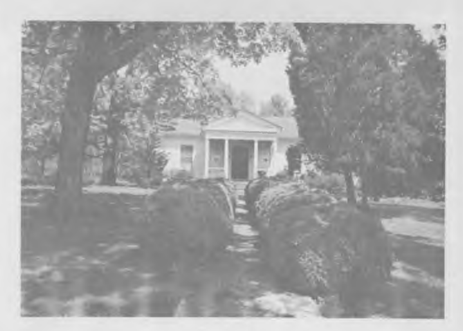
The Withers-Chapman-Johnson House, 2409 Dairy Lane (formerly Gaboury Lane). Although surrounded by modern homes, the property retains its plantation atmosphere due to the two-acre hillside lawn with its towering trees and huge old boxwoods.

cellent condition with only minor changes having been made over the years. The gabled-roof frame structure is sheathed with clapboard and rests on a low limestone foundation. A small unfinished cellar is located under the southeast corner of the house.