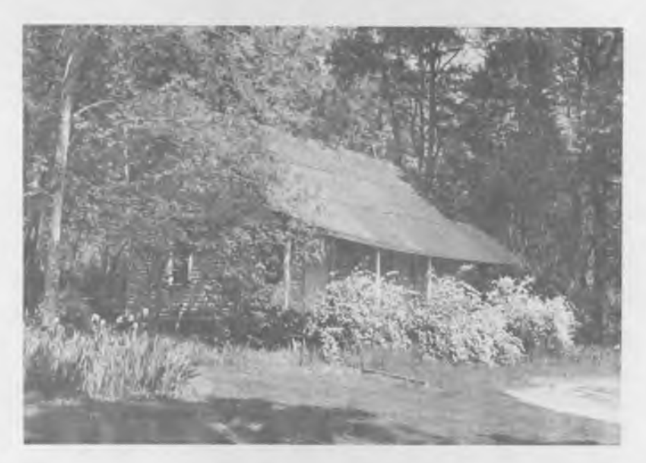
The two-room servants quarters cabin dates from the early days of the Christian plantation and possibly predates the house.

of George Kaiser ... as Tenants in Common and not as joint tenants." The patent mentions "appurtenances" but not "tenements," indicating that no permanent dwelling was built on the property at that time.