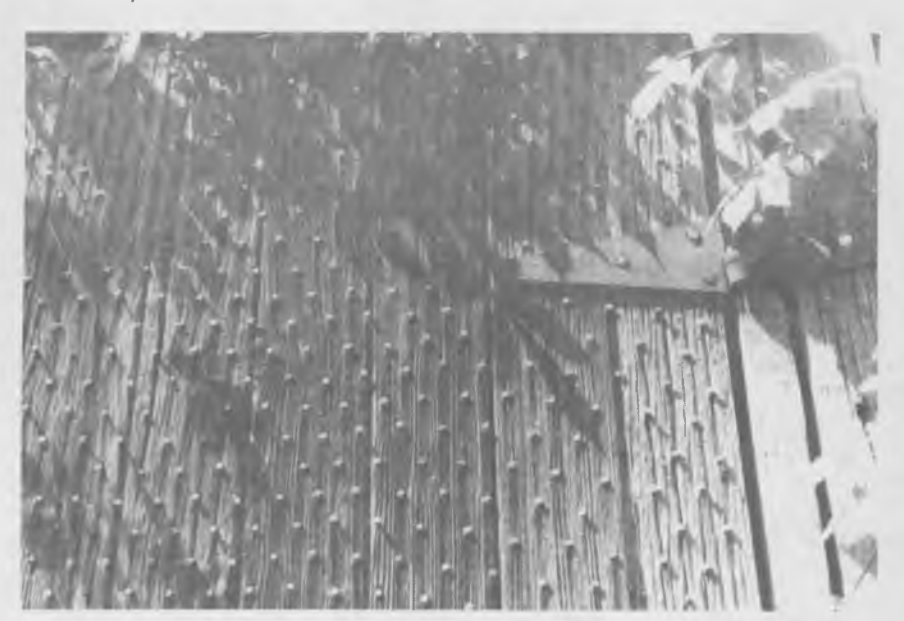
Detail of the nail-studded batten door of the smokehouse.

When he took office, the state was financially embar-rassed because of mismanagement of the state bank. He was able to remedy the problem through sound business practices and set the state on a more sound financial footing. His term was characterized by wisdom and devotion to duty.