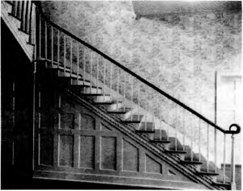
Fig.15 Federal Staircase. Woodlawn , circa 1825. Near Florence, Lauderdale County.

Imagine the amount of time needed to set up this dense complex view of doorway, mirror, and reflection, and to wait for the optimum moment when light would be streaming through the main entrance door (out of the view) at the right. This detail interior view is shot in vertical format, as seen elsewhere in situations where Johnston wanted to focus viewer attention on significant architectural elements. (The vertical format is used in three of the four interior views she made of the Rhea-Burleson-McEntire House .)