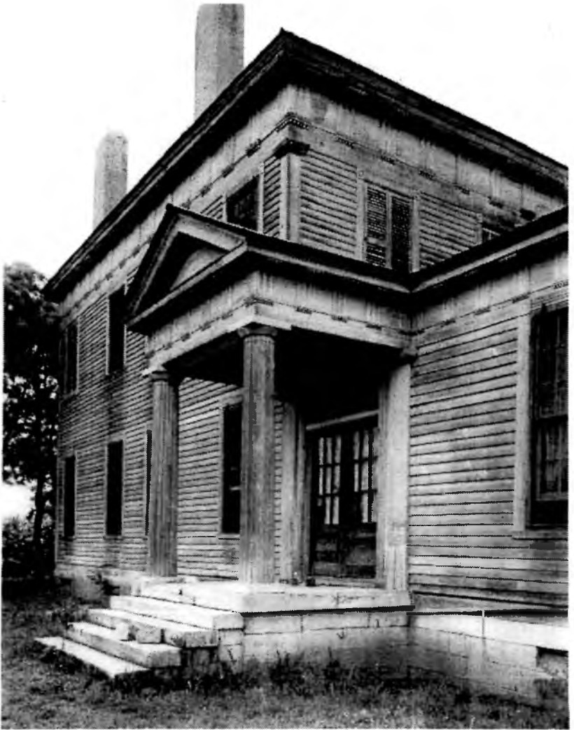
Fig. 18 Side portico. Barton Hall , circa 1847-49. Near Cherokee, Colbert County.

They include one of Johnston's most elegant views of a Tennessee Valley building.