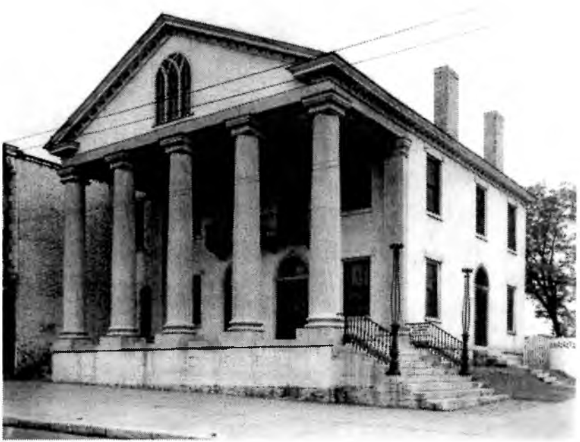
Fig.8 Decatur Branch, State Bank of Alabama, circa 1834-1836. Decatur, Morgan County.