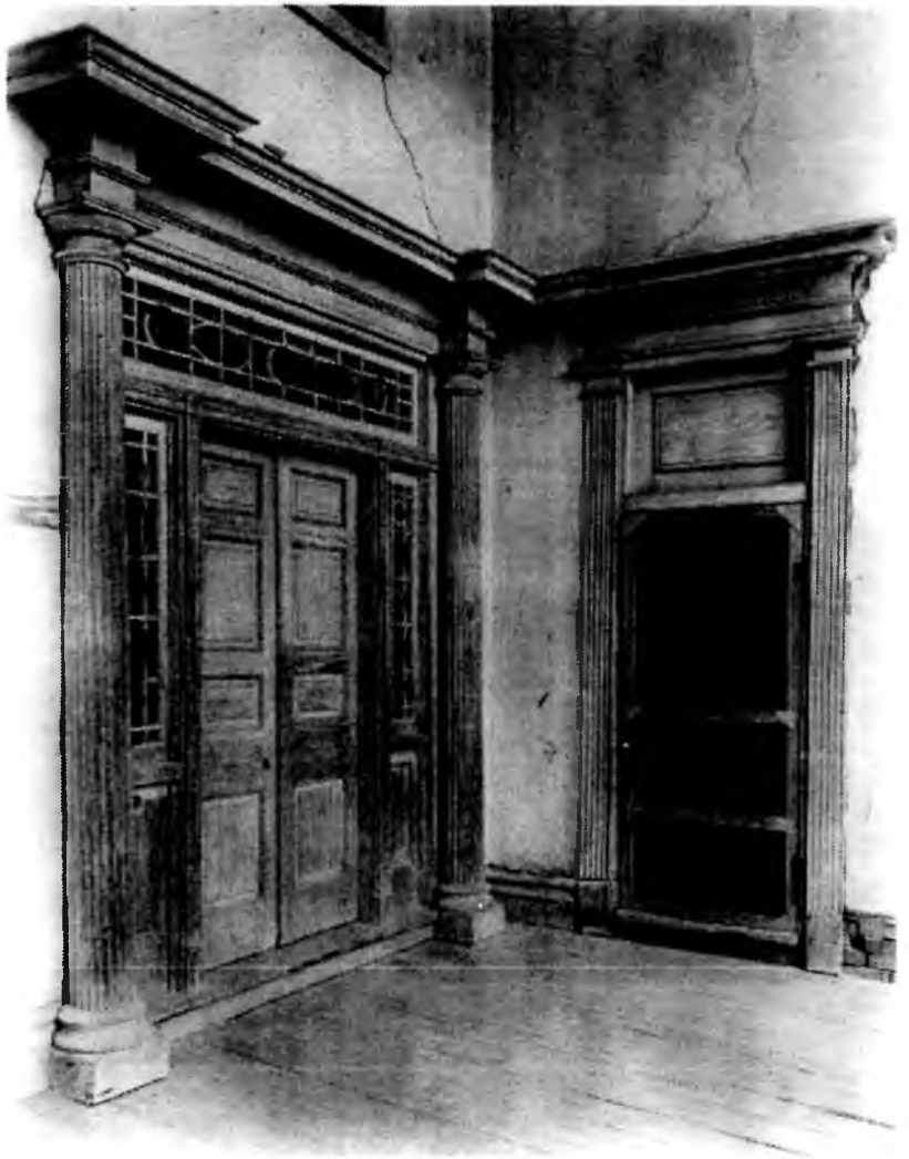
Fig.21 Two doorways on portico porch. Saunders-Goode-Hall House, circa 1830-35. Near Town Creek, Lawrence County.

The doorways in this view can be glimpsed between the portico columns in the overall view (Fig.20) on the facing page.