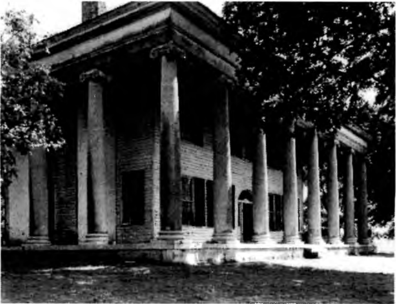
Fig.2 The Forks of Cypress. 1830. Formerly near Florence, Lauderdale County. Struck by lightning and burned June 6, 1966.