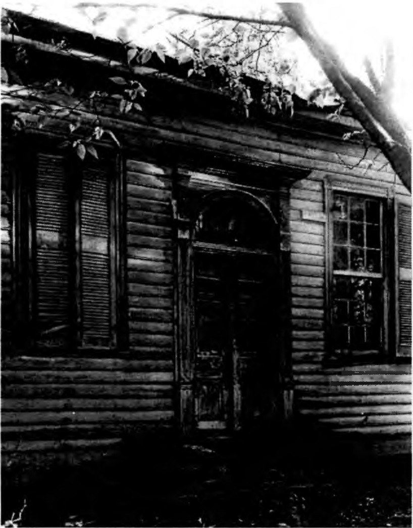
Fig.4 Entrance. W.W. James House, circa 1825. Formerly near Courtland, Lawrence County. Demolished circa 1940.

One unusual building photographed by Johnston exemplifies a type of building that is often lost—the small service building. Today, when viewing an imposing historic house preserved from centuries past, it is easy to ignore that it may be the sole survivor of a formerly large domestic complex of many buildings. A surviving big house was often originally the heart of a galaxy of numerous small service buildings, typically one-story structures, each with a single function.