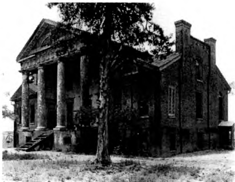
Fig.22 Portico and right wing. Saunders-Goode-Hall House, circa 1830-35. Near Town Creek, Lawrence County.