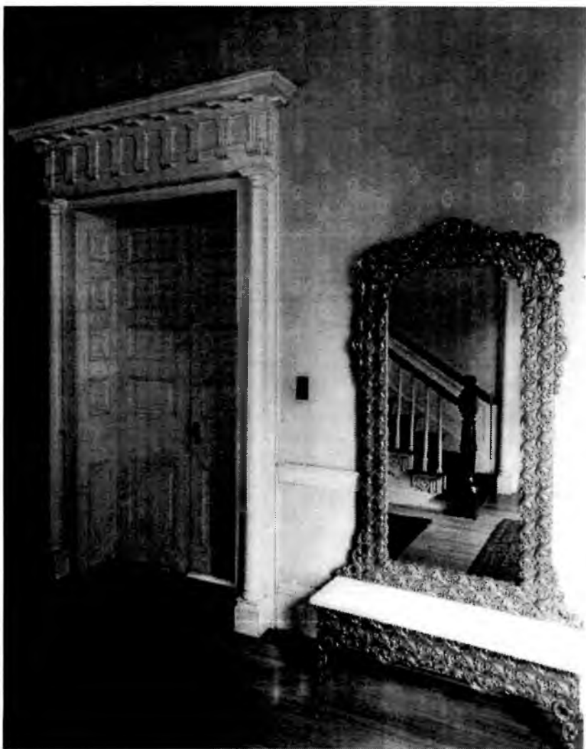
Fig. 17 Doorway, mirror, and reflection. Rhea-Burleson-McEntire House, circa 1836. Decatur, Morgan County.