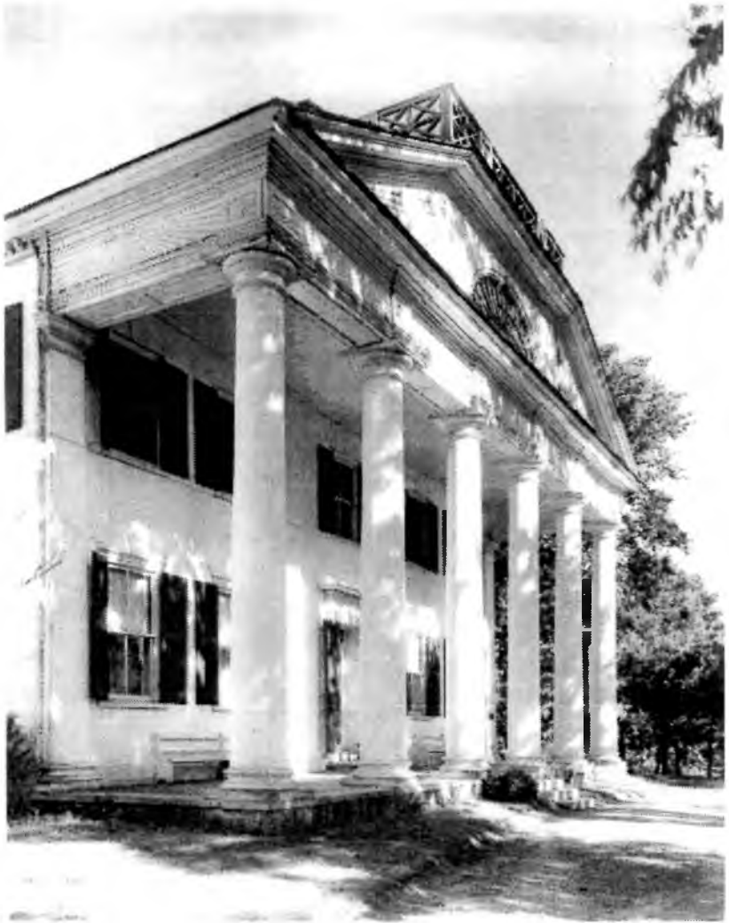
Fig. 1 Portico, 1840s, at LeRoy Pope House. Huntsville, Madison County.

Note: All illustrations in this article are made from photographs taken in May 1939 by Frances Benjamin Johnston. They are reproduced by permission of the Prints and Photographs Division, Library of Congress, Washington, D.C.