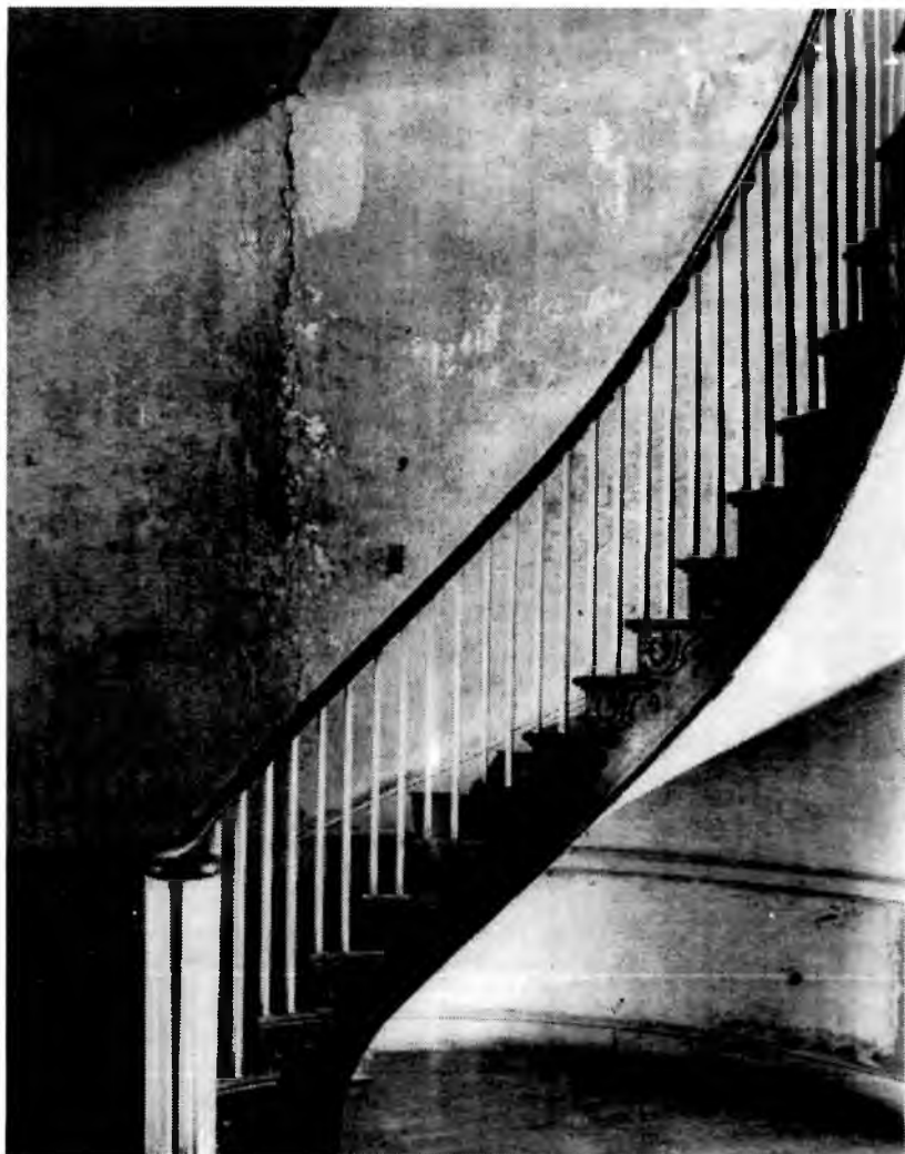
Fig.14 Spiral Stairway. Belle Mina, circa 1826-35. Near Mooresville, Limestone County.

Another challenging factor in making interior shots is seen in this view. When fabric or paint has deteriorated near a primary feature, it may be difficult to compose an interior view to exclude the distracting blemish. Here, the peeling paint on the wall would have been hard to exclude from any view of this staircase.