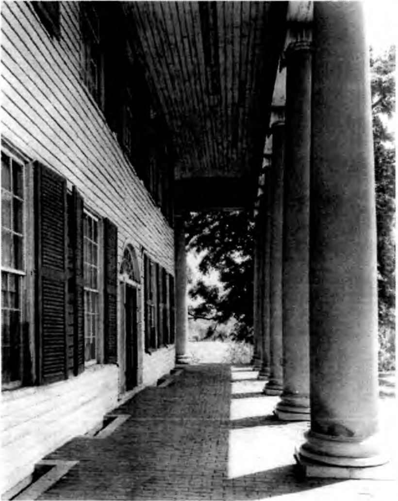
Fig.3 Porch. The Forks of Cypress. 1830. Formerly near Florence, Lauderdale County. Struck by lightning and burned June 6, 1966.

the rhythm of architectural elements on the left. These elements are nicely balanced in an elegant asymmetrical composition that effectively conveys the grandeur of this lost masterpiece. Similarly, in her oblique view of the main elevation (Fig.2, page 12), notice how she located her camera to show sunlight along the right edges of the columns.