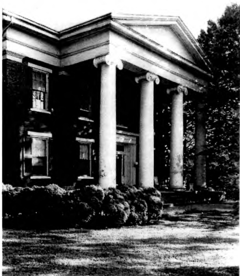
Fig. 7 Bibb-Bradley-Beirne House, circa 1835. Huntsville, Madison County.

to photograph its facade with the light coming from the left (Fig. 5, page 17). In the early afternoon, she shot the LeRoy Pope House in full sunlight (Fig. 1, page 10) and then the Bibb-Bradley-Beirne House (Fig. 7, above) in the lengthening shadows of the late afternoon sun.