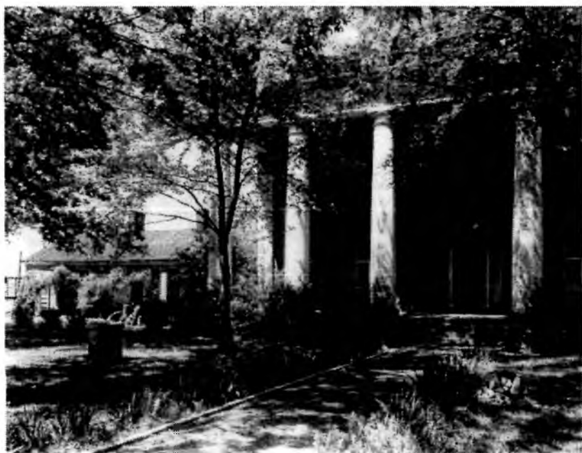
Fig.12 Portico, left side. Belle Mina, circa 1826-35. Near Mooresville, Limestone County.

Lighting is especially daunting. For Johnston, lighting of interior views was just as weather dependent as for exterior scenes. She appears to have used natural light only. No artificial floodlights highlight important details or soften dark shadows. Sunny days were best, just as for exterior views, when strong sunlight could stream inside through undraped windows and open doors.