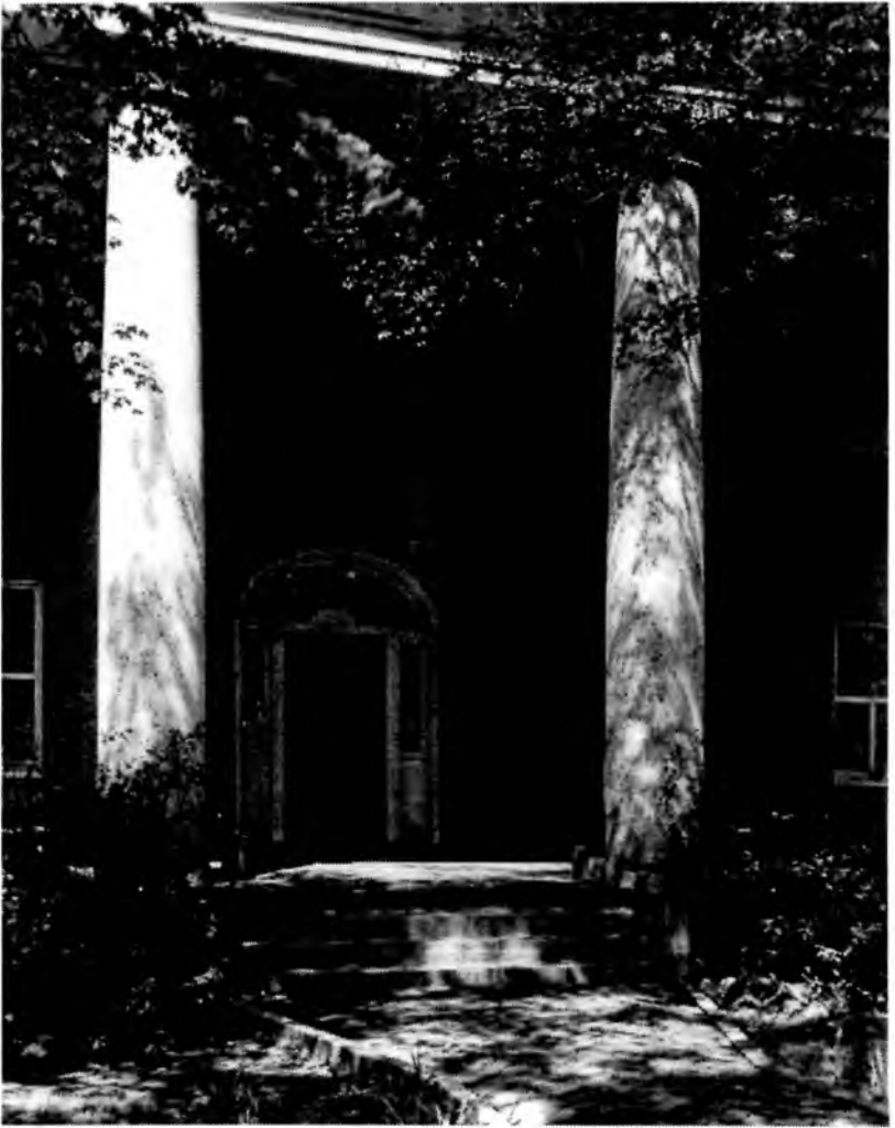
Fig.13 Main entrance. Belle Mina, circa 1826-35. Near Mooresville, Limestone County.