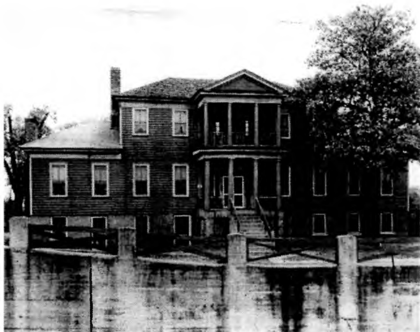
Fig.9 Dancy-Polk House, circa 1829. Decatur, Morgan County.