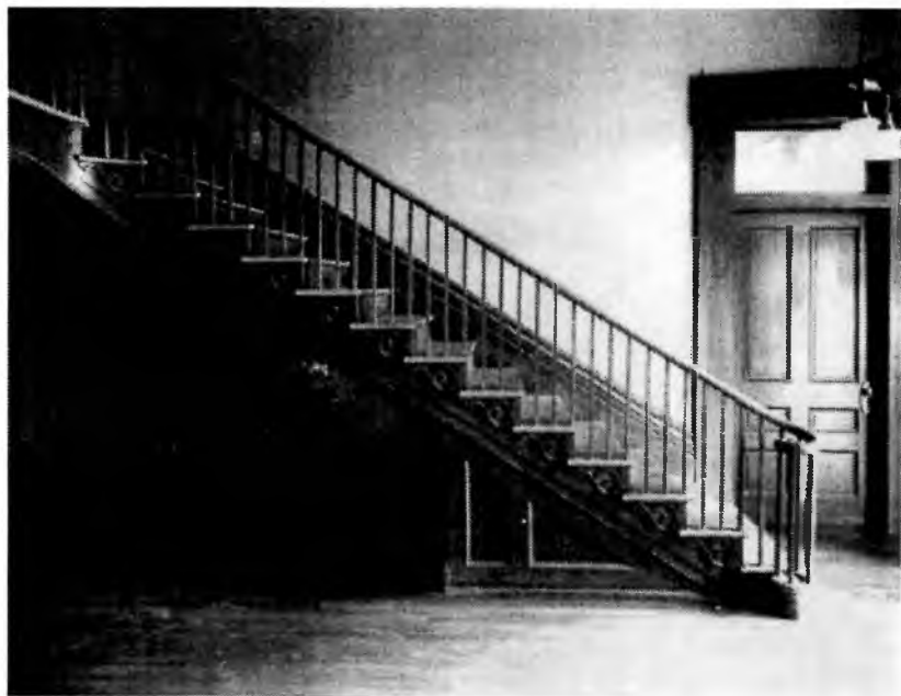
Fig.19 Flight of stairs. Barton Hall, circa 1847-49. Near Cherokee, Colbert County.

Saunders-Goode-Hall House is constructed of brick in a three-part H-shape plan, with a central two-story pavilion flanked by one and one-half-story wings.