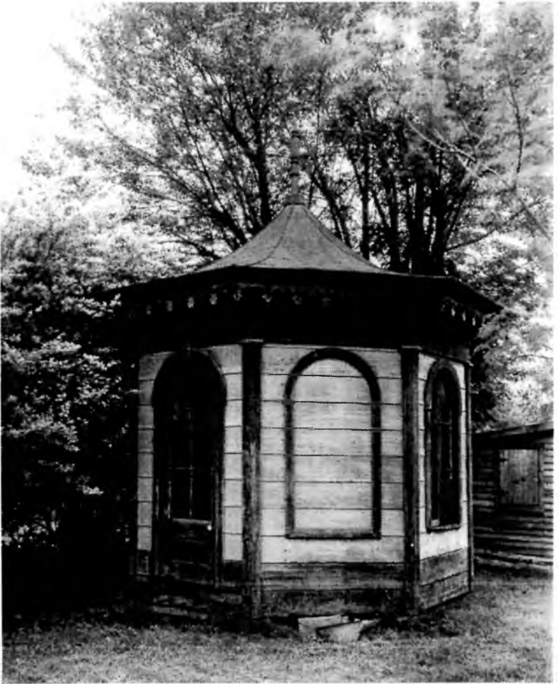
Fig.6 Office, 19th century, at Beaty-Mason House , Athens, Limestone County.

salient architectural feature, which is often a doorway or window, has vertical proportions, the vertical view can complement and enhance perception of the vertical architectural feature (See Fig.6 above). Also, the vertical view, like the partial view, can easily exclude undesirable adjacent distractions that would be seen in a horizontal view of the same feature. The vertical view is thus frequently employed in challenging situations.