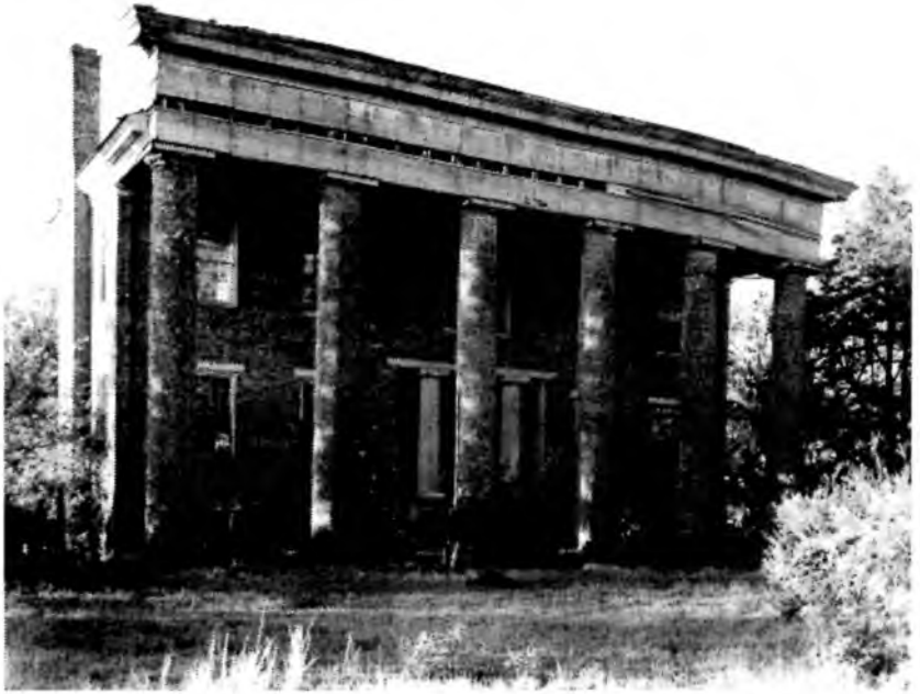
Fig.5 David Wade House, circa 1840. Formerly near Huntsville, Madison County. Demolished 1940.

When the function is no longer needed, the service building is rarely maintained, let alone preserved. Most are torn down. We know them by familiar names—outhouse, spring-house, well-house, icehouse, kitchen—but these small buildings are becoming increasingly rare to experience first-hand.