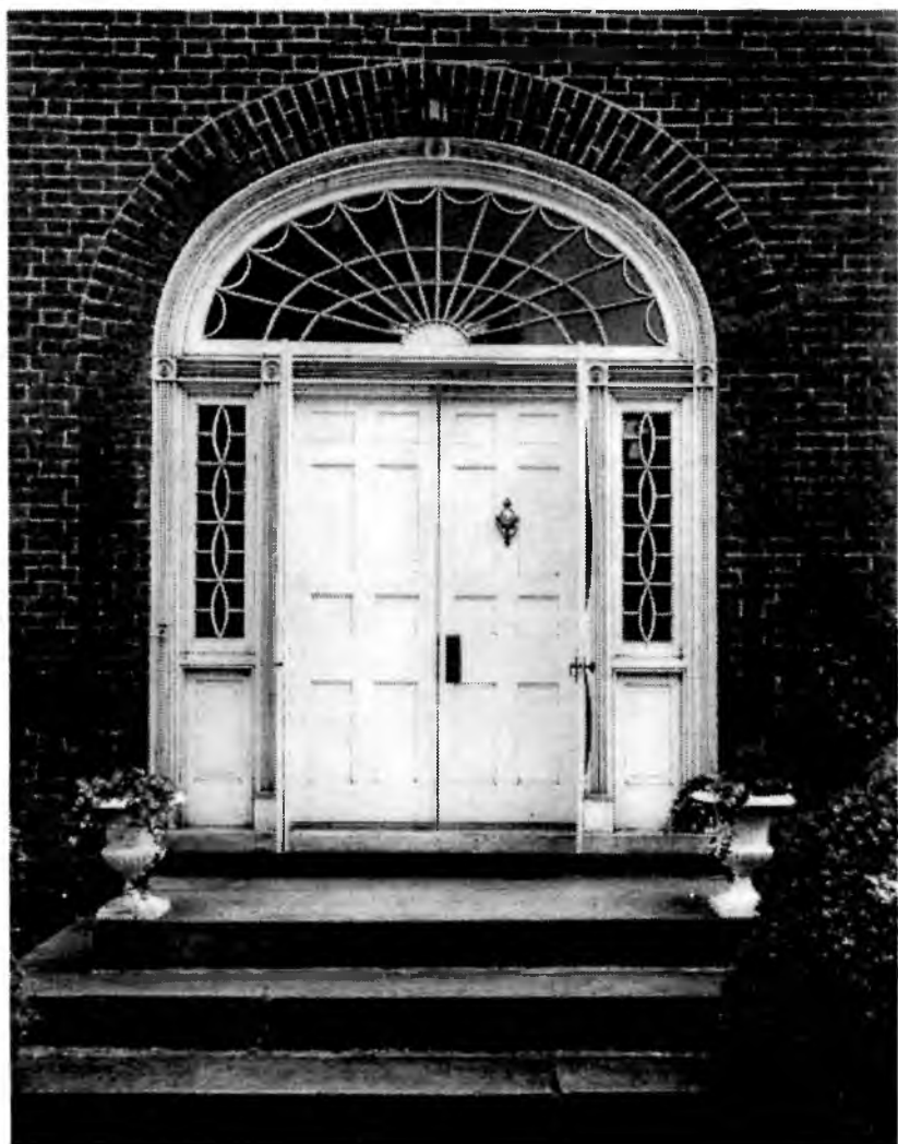
Fig.16 Fanlight doorway. Woodlawn, circa 1825. Near Florence, Lauderdale County.

Fortunately, the historic architectural appearance of the house is known through an extraordinary 19th century photograph that clearly shows the tetrastyle (four-columned) portico. The photograph taken on April 23, 1865, documents a memorial concert on that day for Abraham Lincoln. The photograph shows a brass band playing on the roof of the house, facing toward an encampment of Union soldiers. 11