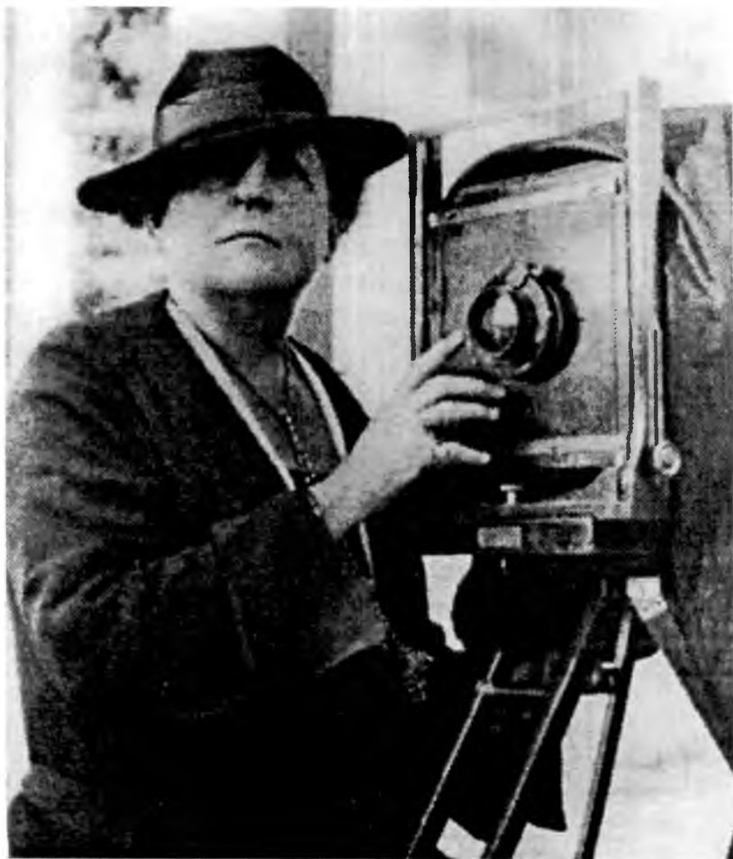
The photographer Frances Benjamin Johnston (1864-1952) Made about 1936, this self-portrait with her view camera shows Johnston at about age 72, several years before she photographed Tennessee Valley architecture in May 1939.

Prints and Photographs Division, The Library of Congress, Washington, D.C.