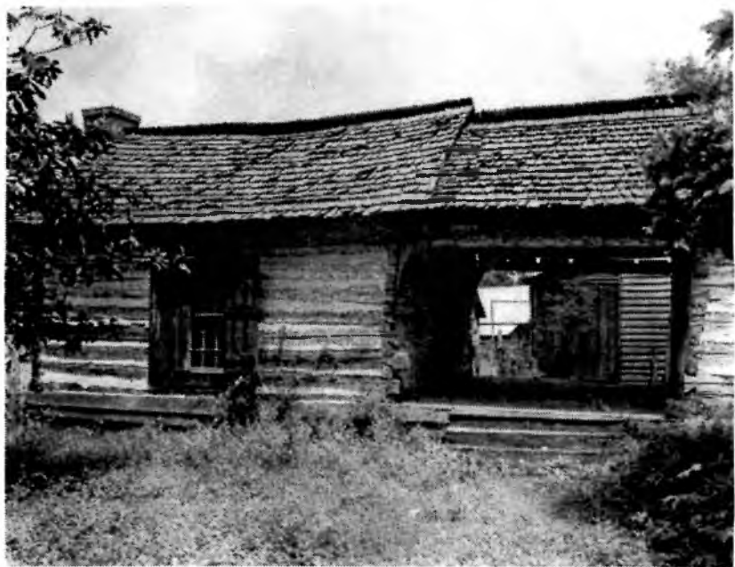
Fig.10 Log house, circa 1818, at Pond Spring (Gen. Wheeler home), near Courtland, Lawrence County.