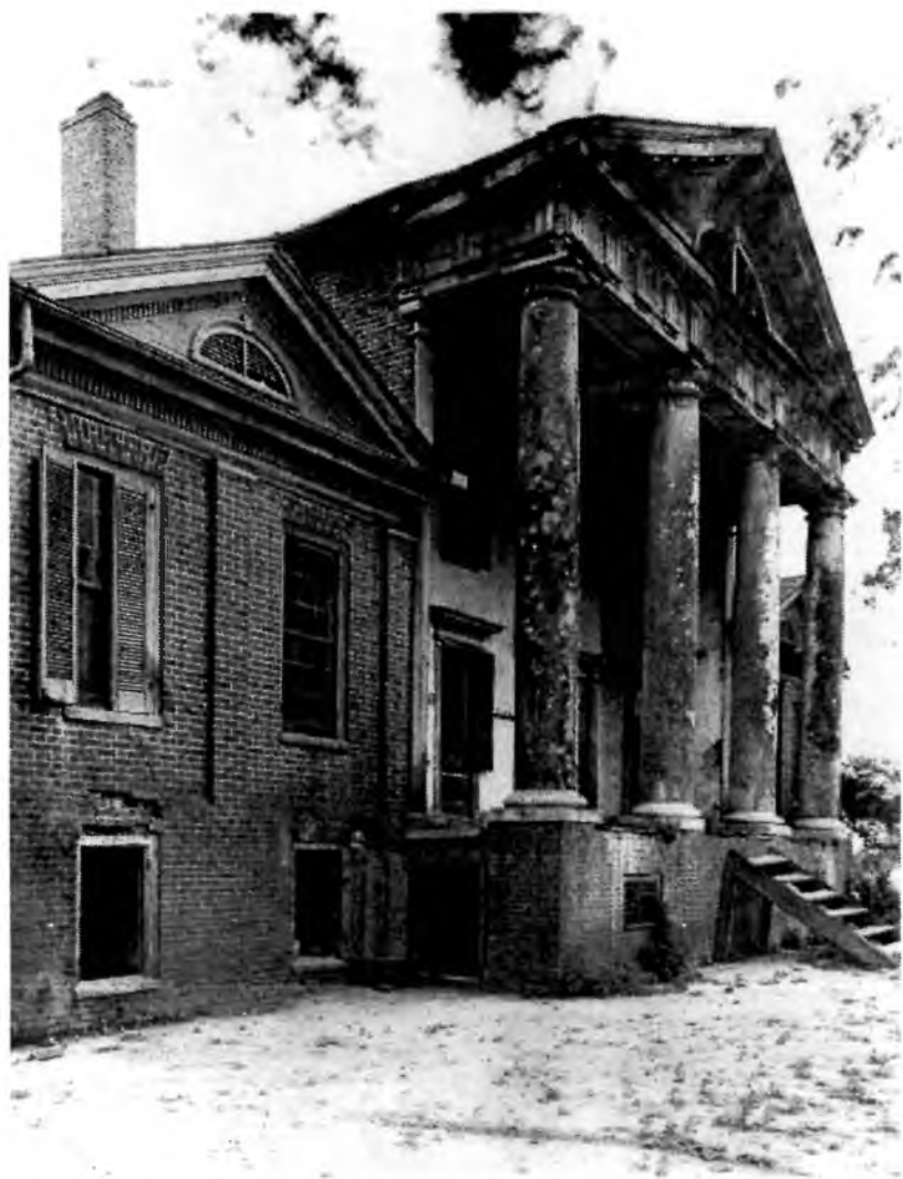
Fig.20 Saunders-Goode-Hall House, circa 1830-35. Near Town Creek, Lawrence County.