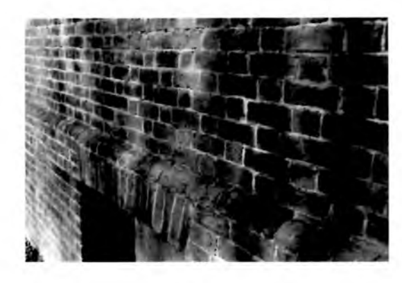
Cotton Hill's convex molded brick water table. Photograph by Lakin Boyd, 2004

Cotton Hill originally had exterior blinds, not shutters as we call them today. Blinds have blades with openings between them, whereas shutters are solid-paneled to exclude light and air when closed and were used primarily on commercial buildings for security purposes. In contracts of the early 19th-century, blinds are referred to as "Venetian blinds" and functioned to block the sun and discourage the entry of insects with-