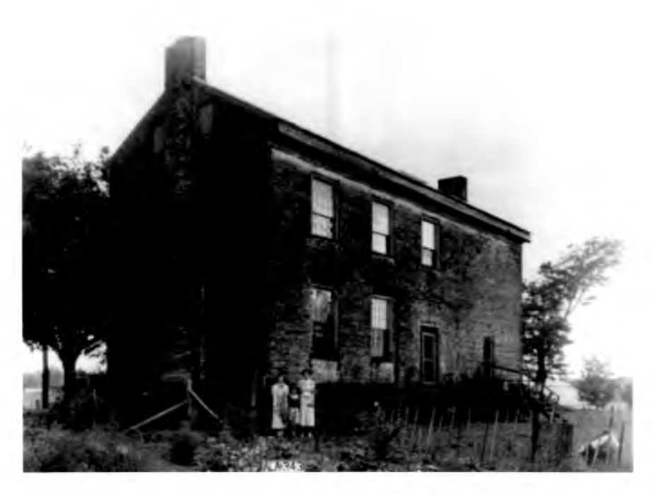
Cotton Hill in 1935 showing the north-facing rear and east side elevations. Historic American Buildings Survey, Alex Bush, photographer, May 21, 1935

a cooking fireplace, and there is only one basement window on the west end of the back wall, suggesting the practicality of the builder. Why place a basement window under a porch? A one-story frame room was constructed after the date of the HABS photo, but it has been replaced by a later owner with a two-story brick ell that is visible in the 2004 photograph that appears on the cover.