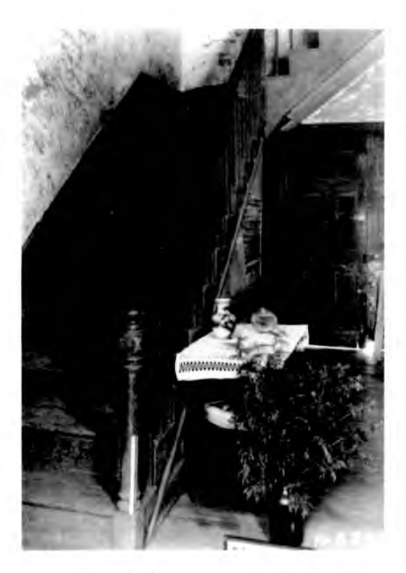
Stairs on west side of entry hall.

including those in the basement, were plastered. Laths (strips of wood) were nailed to ceiling joists to provide groundwork for the plaster. The stairs are boxed and plastered in this manner.