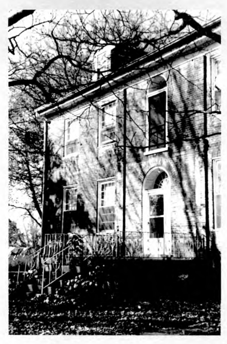
Cotton Hill in 1981; the two dormers were added after 1935 and have since been removed.