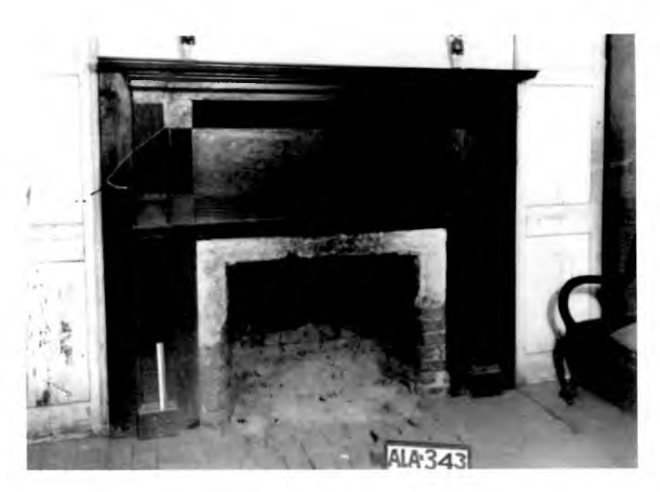
Mantel and flanking cupboards in second-floor east room.