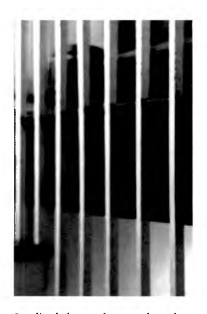
Landing balusters that pass through notches cut in the floorboard of the second-floor hall are an unusual feature.

The floors throughout the house are six-inch heart pine laid directly on the floor joists without a subfloor. The floorboards have tongue-and-groove joints and appear to have never been varnished or scrubbed with lye water to a gray finish like most floors of early 19th-century houses. Prior to the Civil War, wooden floors were periodically scrubbed to keep them a light bleached color. Varnishing was a post-Civil War fashion.