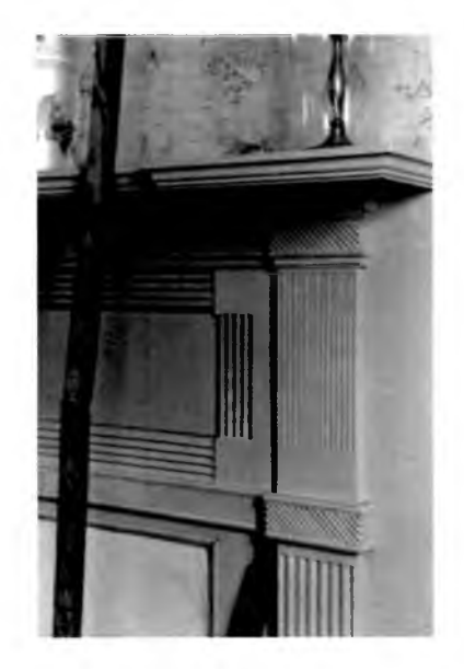
Detail of parlor mantel showing fluting and reeding. Photograph by Harvie Jones, F.A.I.A., 1981. Courtesy Architectural Collection of Harvie P. Jones, University of Alabama in Huntsville

The second-floor hall is lit by a window in the north wall and a fanlight over the door that originally opened to the second-floor portico. A door in the boxed stair on the south wall leads to the floored attic. which is lit by a pair of four-pane windows flanking each chimney. The east bedroom has an original cupboard with shelves on either side of the mantel. This mantel, which is similar to the one in the parlor, still retained its original black paint when photographed for HABS in 1935.