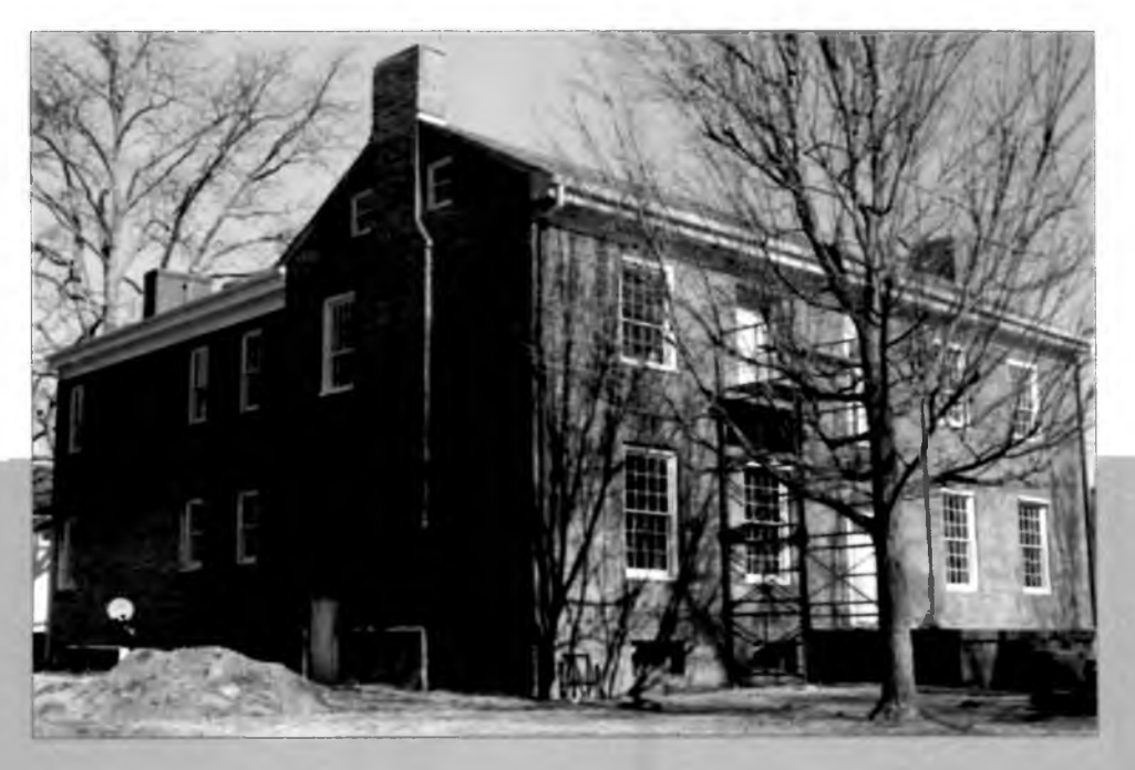
Cotton Hill, February 2004.

Volume 31, Numbers 1-2, Spring/Summer 2005 Six Dollars