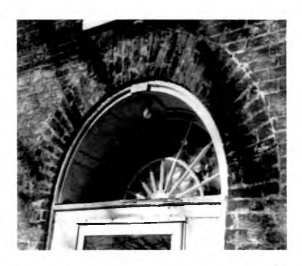
Front entry fanlight and brickwork of Cotton Hill; doorway infill is not original.

provides an elegant transition from the main wall to the thicker foundation wall. Tapered lintel bricks, as well as the arched bricks over the front entry and the door above it, are gauged and rubbed.