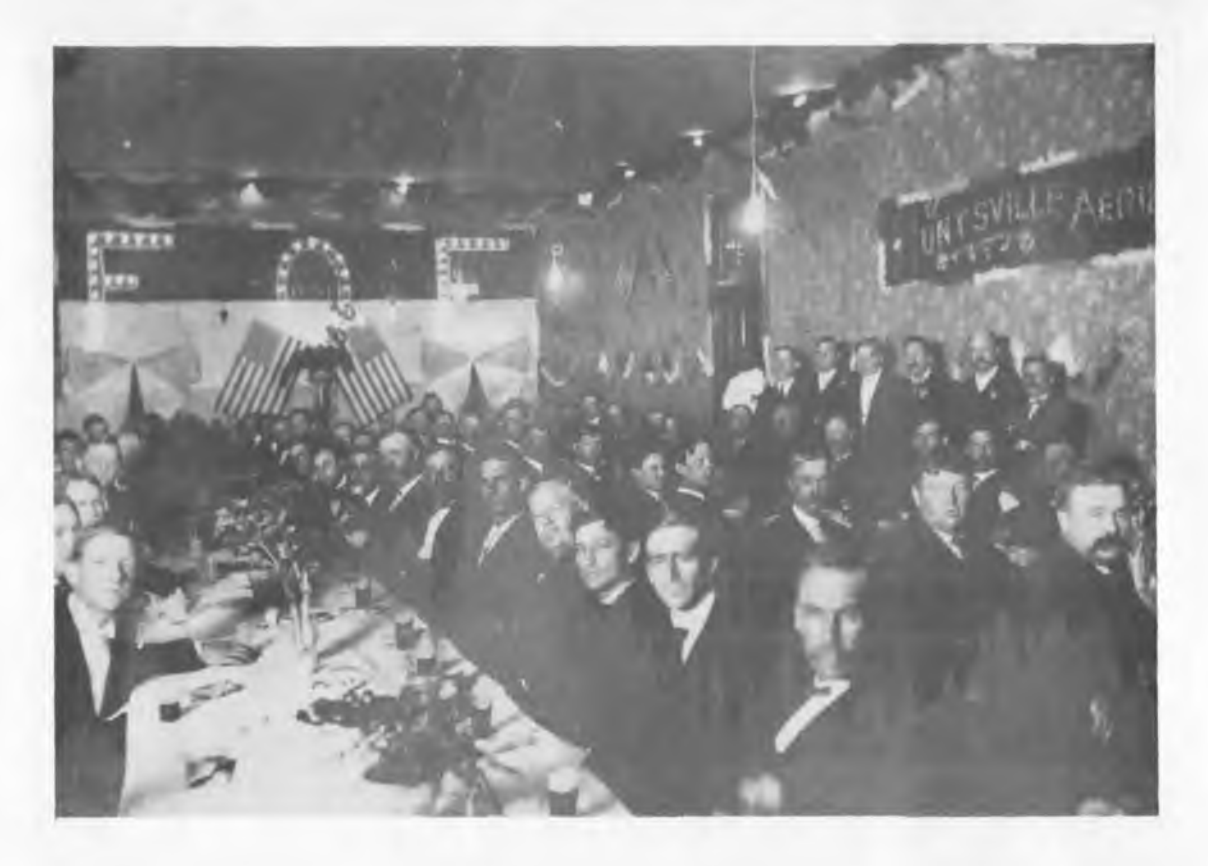
Elks Club—Huntsville, Alabama—taken about 1903.