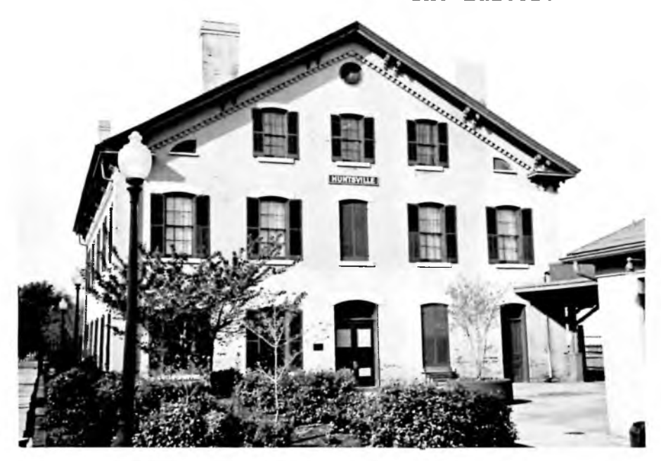
Huntsville Depot and Headquarters for Eastern Division, Memphis & Charleston Railroad, now Huntsville Depot Museum.