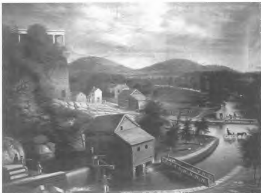
BIG SPRING WILLIAM FRYE - LANDSCAPE PAINTER (ca 1850)