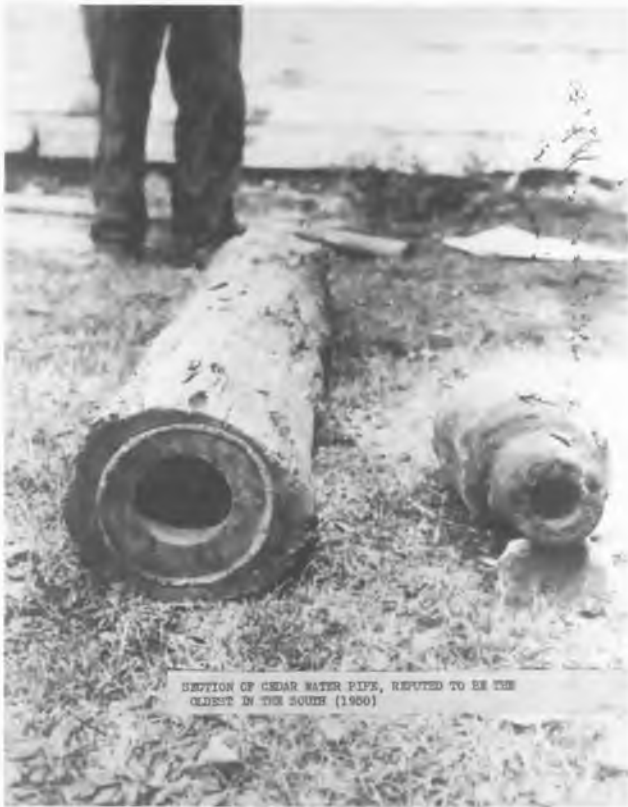
SECTION OF CEDAR WATER PIPE