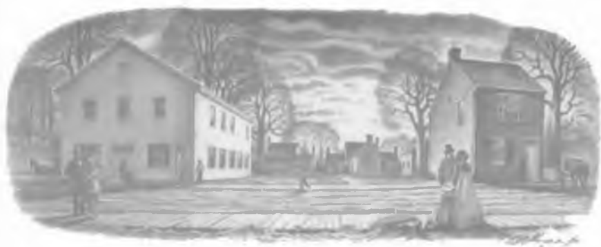
Huntsville, Alabama 1819

Published By The Huntsville-Madison County Historical Society