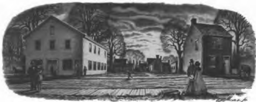
Huntsville, Alabama 1819

Published By The Huntsville-Madison County Historical Society