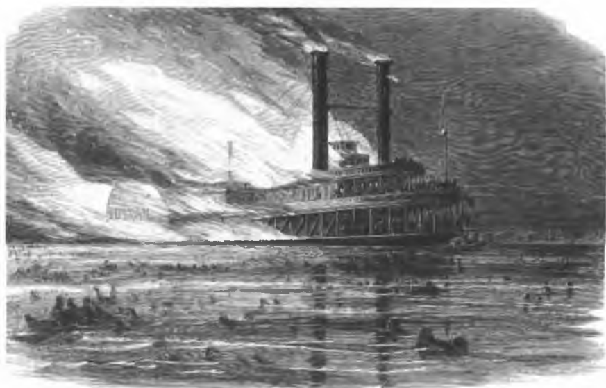
EXPLOSION OF THE STEAMER "SULTANA," APRIL 27, 1865.