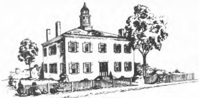
The State House at Cahaba

In 1818, a law was passed which established a committee to determine the most eligible site for establishment of the Seat of Government for the Alabama Territory. Competition was intense between the several backers of various sites that suited their political and economic purposes. The commission was prepared to recommend Tuscaloosa as the permanent site, but they were unaware that Governor William Wyatt Bibb had acted on his own authority and obtained a federal land grant at the site where the Cahaba and Alabama Rivers converged. The Governor stated his reasoning as follows: "The necessary advantages, approaching certainly nearer to the center of the Territory, and probably of its future permanent population than any other place equally eligible." Furthermore, the site itself was "beautiful" with "springs of good water and the prospect of good health."