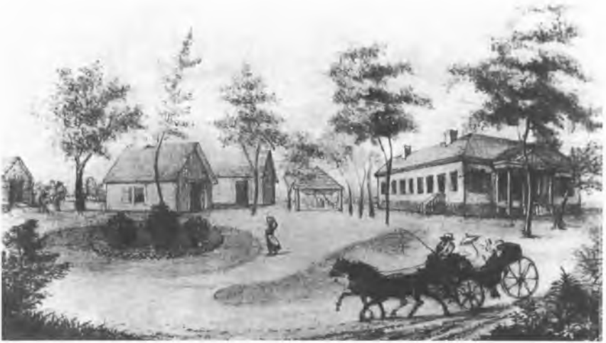
“King’s Bend” near Cahawba – Home of William Rufus King

voted to fill the office of Vice-President. But after only five months, King resigned due to his continuous struggle with tuberculosis. But his lapses of bad health were interspersed with periods of good health, and he continued his political career.