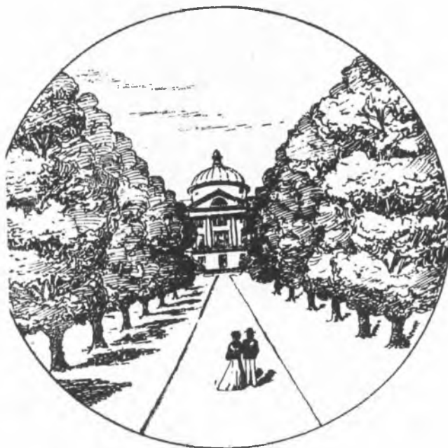
The Old Capitol at Cahawba