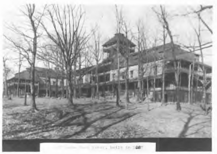
Monte Sano Hotel

A celebration ball was held on June 2nd with 400 guests in attendance. On July 1 there was a concert. A few days later another ball was attended by 400 people. Many of the guests had to dance on the porch for lack of room inside. By August 24, the hotel had registered over 1,000 guests. About that time 300 soldiers from Ft. Barancas in Pensacola, Florida, came to the mountain to recover from yellow fever, and they remained until the arrival of cold weather. In 1898, a large group of Spanish-American War veterans came to Huntsville, to recover from malaria. Many were sent to the mountain.