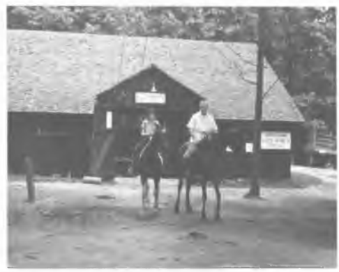
Horseback Riding on Monte Sano Mountain

The grounds were beautifully maintained and well-equipped with boardwalks. There were 14-mile buggy and carriage rides around the mountain that featured such names as Shelter Rock, Wildcat Glen, Vanishing Falls, Brigans Cavern, Hell's Half Acre, Chalybeate Spring, Alum Spring, Magnesia Spring, Cold Spring, and Inspiration Point. At the conclusion of the 1887 season, which ended in October, the hotel declared a profit! Only poor winter weather prevented yeararound operation.