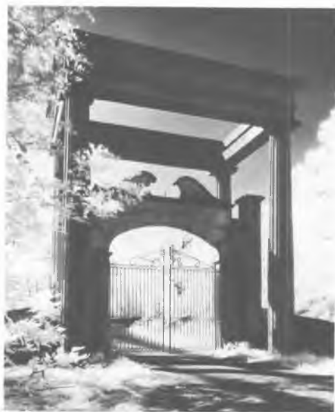
Entrance to Burritt on the Mountain