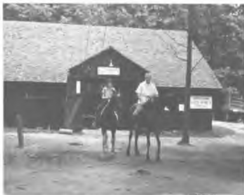
Horseback Riding on Monte Sano Mountain

The grounds were beautifully maintained and well-equipped with boardwalks. There were 14-mile buggy and carriage rides around the mountain that featured such names as Shelter Rock, Wildcat Glen, Vanishing Falls, Brigans Cavern, Hell's Half Acre, Chalybeate Spring, Alum Spring, Magnesia Spring, Cold Spring, and Inspiration Point. At the conclusion of the 1887 season, which ended in October, the hotel declared a profit! Only poor winter weather prevented year-around operation.