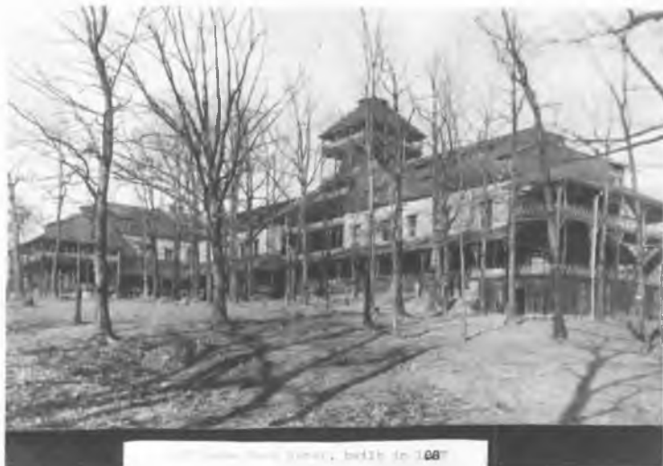
Monte Sano Hotel

A celebration ball was held on June 2nd with 400 guests in attendance. On July 1 there was a concert. A few days later another ball was attended by 400 people. Many of the guests had to dance on the porch for lack of room inside. By August 24, the hotel had registered over 1,000 guests. About that time 300 soldiers from Ft. Barancas in Pensacola, Florida, came to the mountain to recover from yellow fever, and they remained until the arrival of cold weather. In 1898, a large group of Spanish-American War veterans came to Huntsville, to recover from malaria. Many were sent to the mountain.