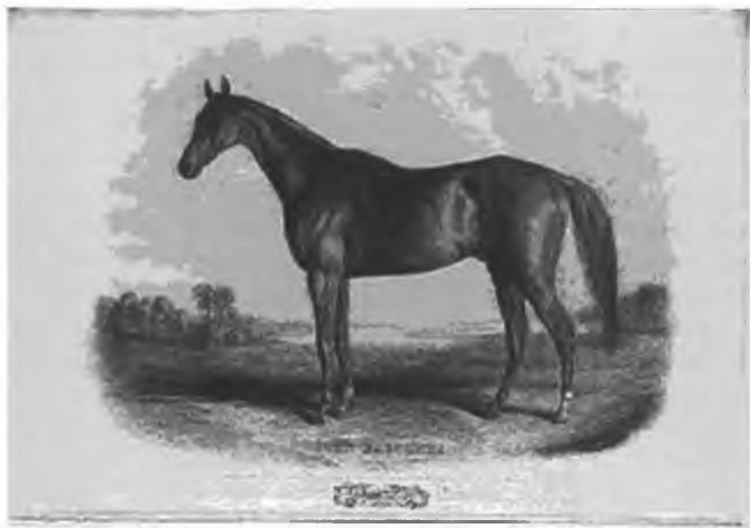
Painted by Edward Troye

New York and offered to race Post Boy, an unbeaten dark chestnut from New York at the Union Race Course on Long Island. John Bascomb's handlers walked the horse the entire 850 miles to allow admirers a chance to see the famed colt. Gamblers from across the country placed bets on the race, mostly on the northern horse. In what would become one of the most celebrated horse races of the nineteenth century, the contest began, as one poet remember, as "the drum was sounded by the judge . . . Bascomb won the first and second heat . . . taking in the knowing Northerners by the witty minded Southerners." Southerners rejoiced at the victory, and John Bascomb returned to the South amid great fanfare. 14