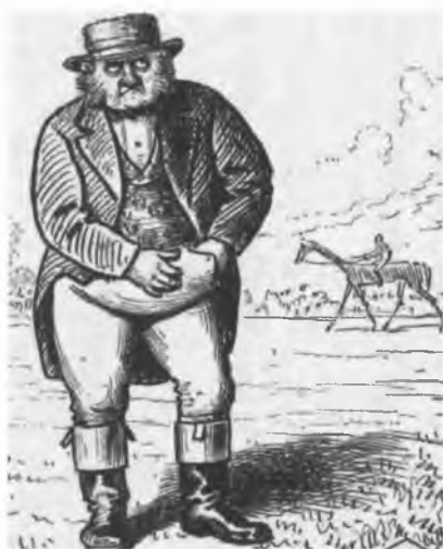
1879 Harper's Sketch of Horse Gambler

These gatherings became a time when white women, men, and children, both rich and poor, could mix freely. Of course, after the women and children went home, the men likely lingered to discuss the merits of the races while enjoying cigars and whiskey and perhaps playing cards. Many of the men would have added up their losses along the way home, perhaps already planning how to make it up at the next race day.