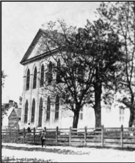
Masonic Lodge, Huntsville