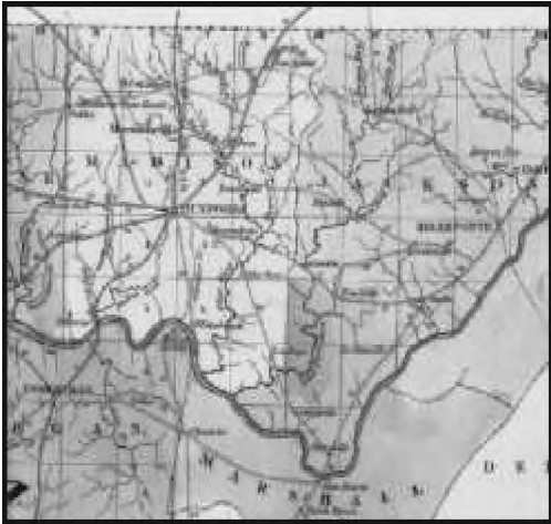
Map of Madison County, 1893

by Andrew Cross at one of Huntsville's two most prominent locations. The Huntsville Inn was in the center of town and the Grove, as the name suggested, offered a lovely accessible and sheltered location for townspeople. (Record, 70)