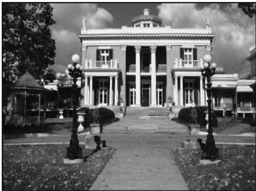
Belmont Mansion