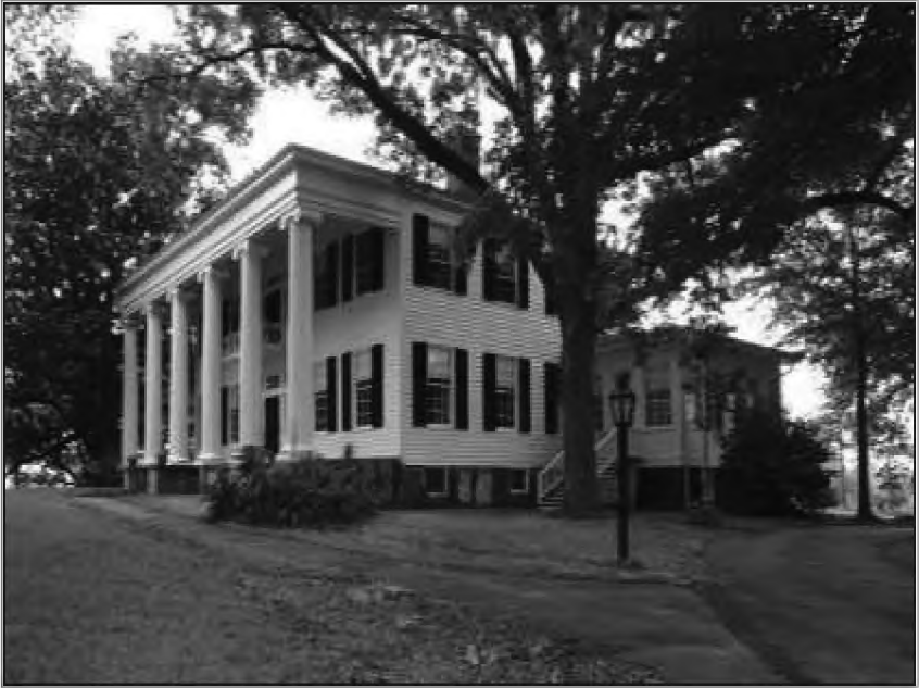
Thornhill House (HABS)