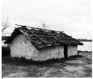
Early Cherokee House

In about 1765, some of the Chickasaws from the western portion of the Valley moved into an area near the Tennessee River in what is now the southern part of Huntsville. This was challenged by the Cherokees, and in 1769, there was a major battle at the settlement; the Chickasaws won, but