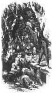
1819 Methodist camp meeting

Moreover, the Second Great Awakening was upon the land. A renewal of camp meetings flourished at Blue Springs and Jordan's Camp Ground, for example, and pointed people into wholesome directions. These religious meetings, with all their drama, were often led by an untrained preacher. He maintained nonstop preaching in daylong meetings that lasted far into the night, accompanied by singing, prayers, sermons and a fervent religious spirit. Preaching