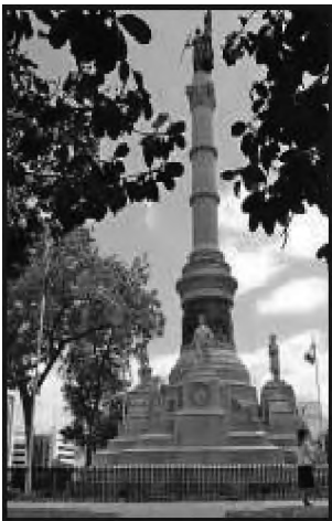
Montgomery Confederate Monument