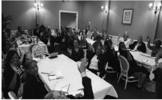
Mary Kay meeting in Ladies Card Room

and the city has continued to keep up rapid growth. The Huntsville Country Club survived the great depression, wars, growth and changes in the