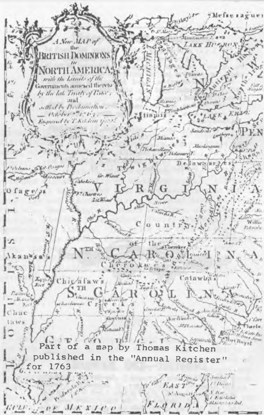
Part of a map by Thomas Kitchin published in the "Annual Register" for 1763