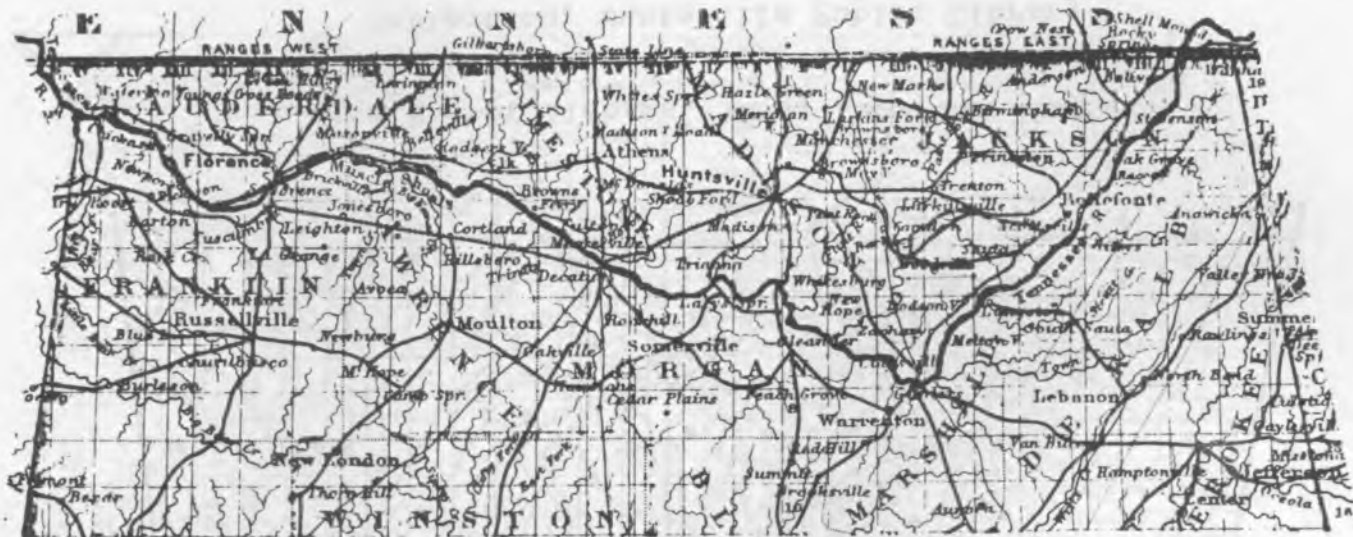
Part of a Johnson's Map of Georgia and Alabama, 1863, from the Historical Collection, Huntsville Public Library