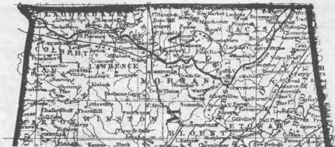
Part of a S. Augustus Mitchell Map of Georgia and Alabama, 1872, from the Historical Collection, Huntsville Public Library