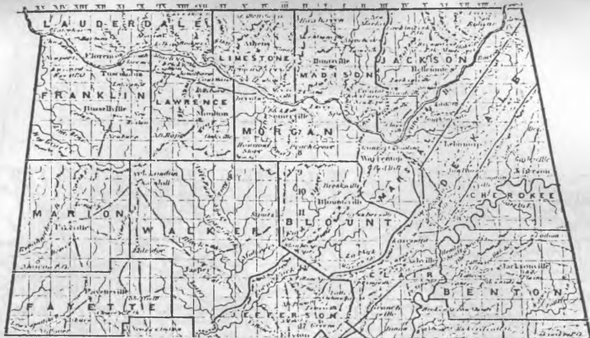
Part of a Map of Alabama, 1840, from the Historical Collection, Huntsville Public Library