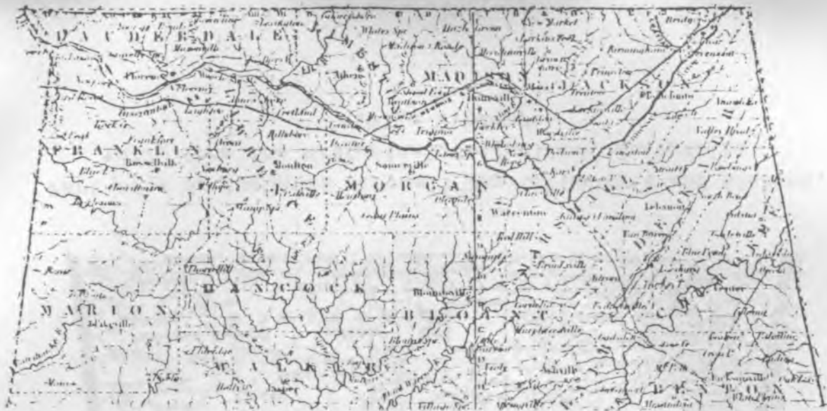
Part of a J. H. Colton Map of Alabama, 1855, from the Historical Collection, Huntsville Public Library