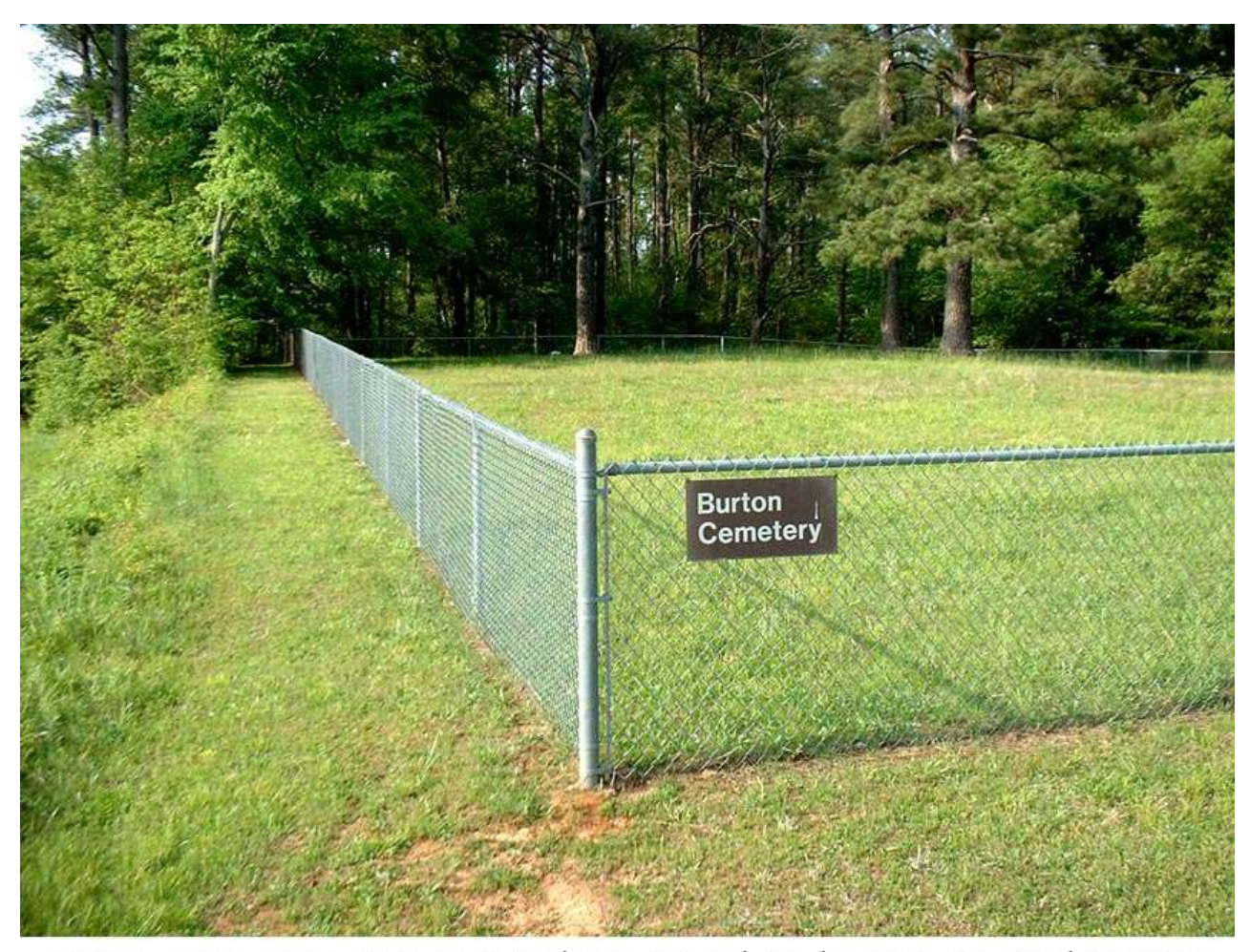
Burton - Morton Cemetery, 71-1, Redstone Arsenal, Madison Co. AL, April 28, 2003 No inscribed tombstones found

This cemetery is located in the east side of the arsenal, on the north shoulder of Redstone Road. As the caption of the above photo states, there are no inscribed tombstones above ground today. Accordingly, those who may be buried in this cemetery are unknown, leading to the assumption that this may a "black cemetery" due to the commonly encountered condition of few or no