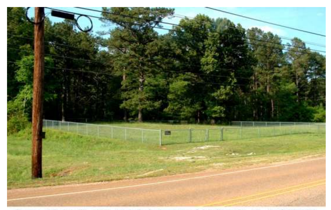
Burton - Morton Cemetery, 71-1, Redstone Arsenal, Madison Co. AL, April 28, 2003