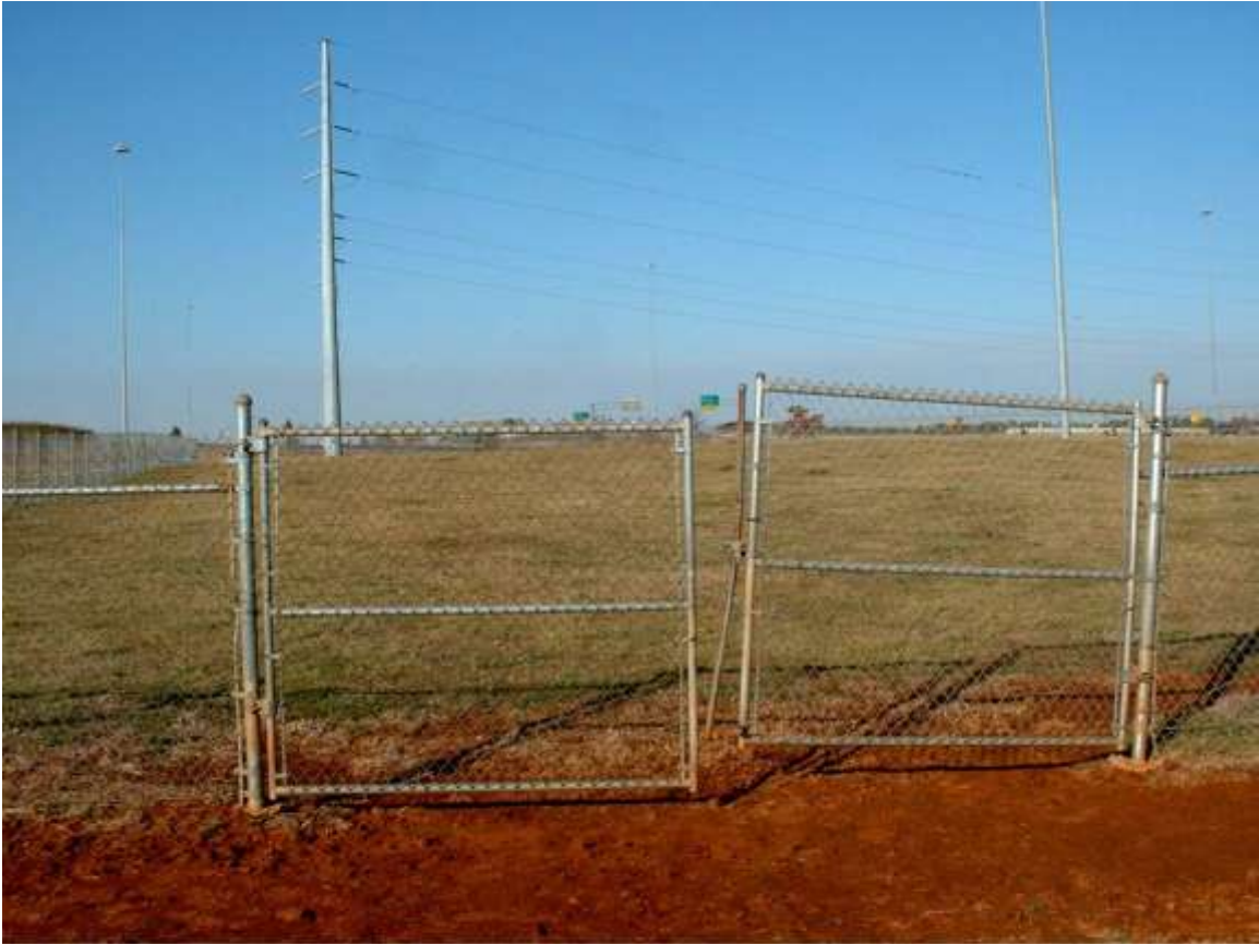
ELKO SWITCH CEMETERY, Redstone Arsenal, Madison Co. AL, January 21, 2004

This gate in the cemetery fence is located near the southwest corner; view is to the north, into the cemetery grounds.