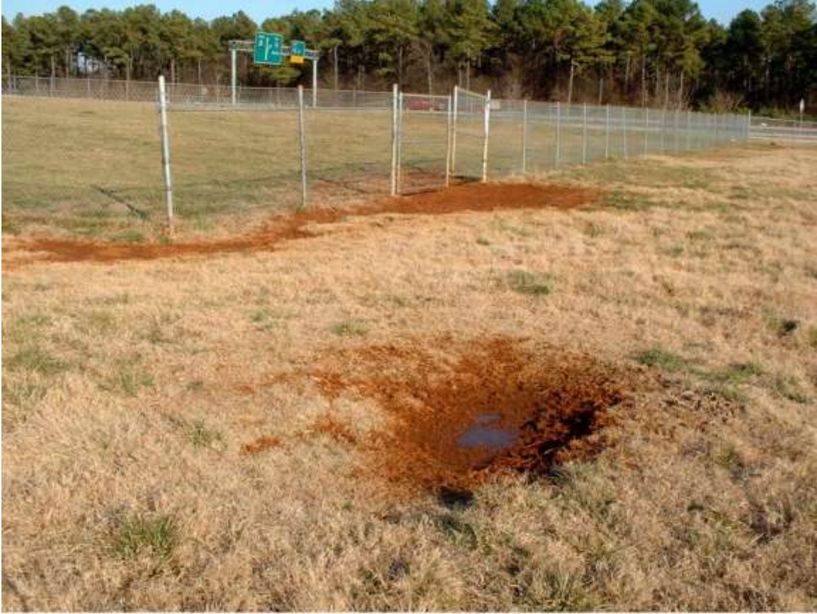
ELKO SWITCH CEMETERY, Redstone Arsenal, Madison Co. AL, January 21, 2004

This appears to be a grave depression located outside the fenced area, about 30 yards southwest of the gate into the cemetery. There appeared to be a few more slight depressions that might be indicative of graves in the area outside the cemetery fence, but it would take more than visual inspections to verify that they in fact are graves. The depression above was the most pronounced found in the area.