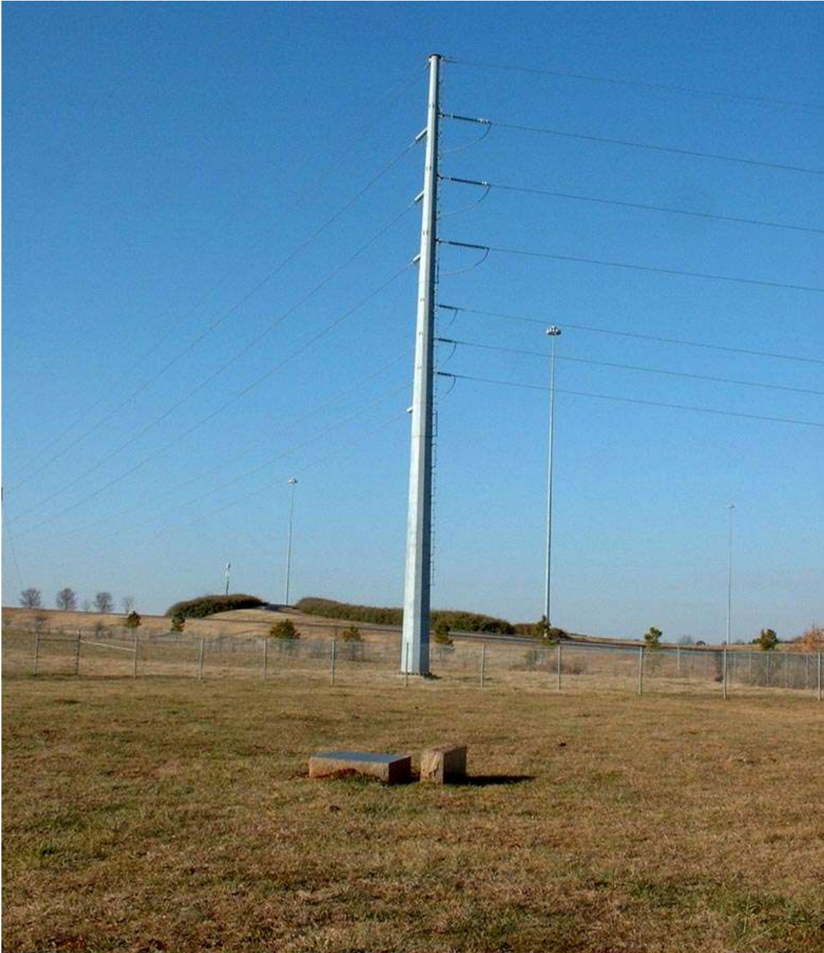
ELKO SWITCH CEMETERY, Redstone Arsenal, Madison Co. AL, January 21, 2004

New "Cemetery Monument" in center of fenced area; view to north, with exit ramp from I565 in background.