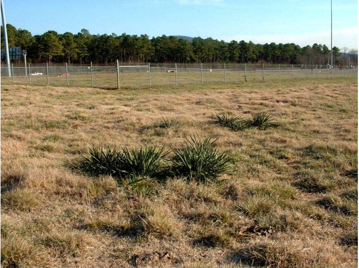
ELKO SWITCH CEMETERY, Redstone Arsenal, Madison Co. AL, January 21, 2004

The green vegetation above is part of several clusters of Yucca plants that typically indicate grave sites, as they are not indigenous to the area. These plants are located about 25 to 30 yards northwest of the cemetery fence.