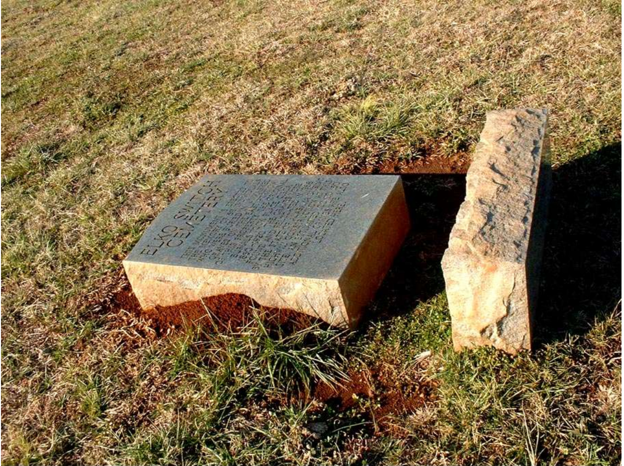
ELKO SWITCH CEMETERY, Redstone Arsenal, Madison Co. AL, January 21, 2004

The new cemetery monument is separated from its base, but lying face up.