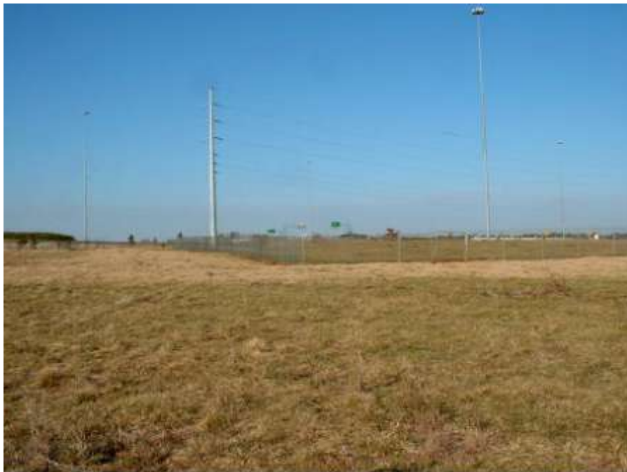
ELKO SWITCH CEMETERY, Redstone Arsenal, Madison Co. AL, January 21, 2004

Some of the photos made of the cemetery in January of 2004 are shown below: