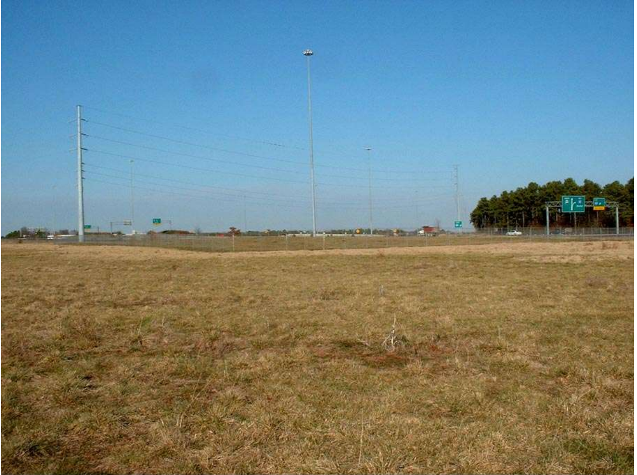
ELKO SWITCH CEMETERY, Redstone Arsenal, Madison Co. AL, January 21, 2004

View from southwest of cemetery fence toward northeast