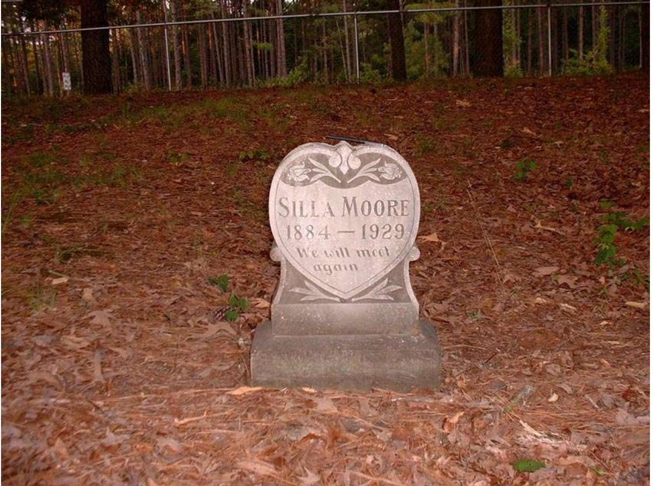
Fennil Cemetery, Redstone Arsenal, Madison Co., AL, June, 2002.