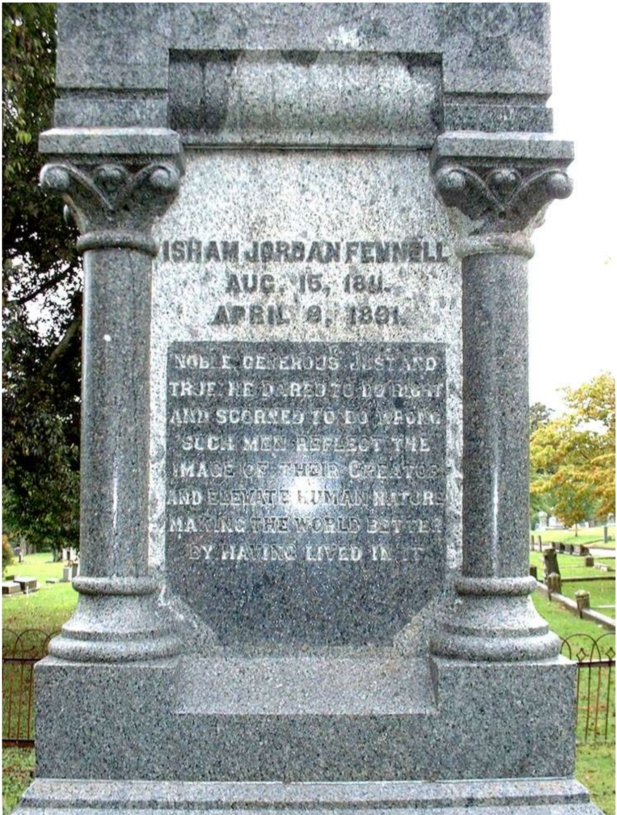
Maple Hill Cemetery (Huntsville, AL), September 7, 2004