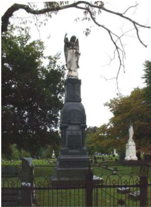
Maple Hill Cemetery (Huntsville, AL), September 7, 2004