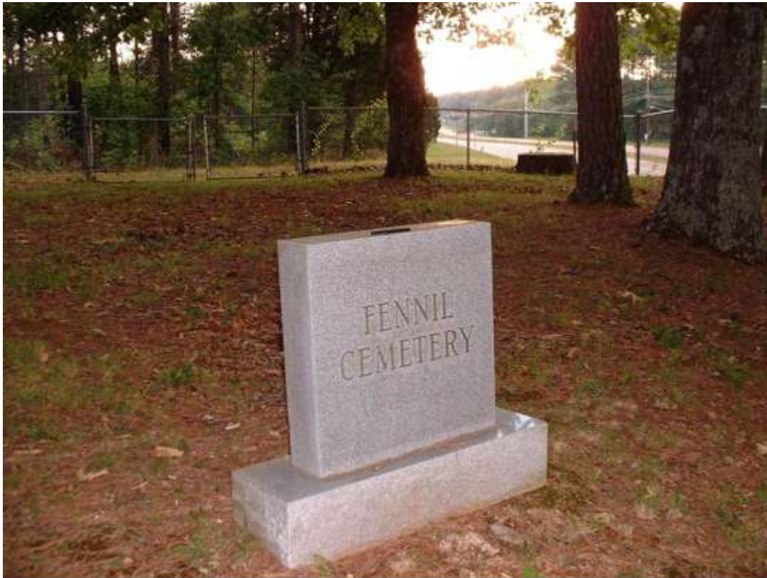
Fennil Cemetery, Redstone Arsenal, Madison Co., AL, June, 2002.

This cemetery is located in the Southeast Quarter of Section 32, Township 4 South, Range 1 West. It forms the southwest corner of the intersection of Mills Road with Martin Road on the arsenal today. The name on the cemetery marker is incorrectly spelled, as the true spelling of the name