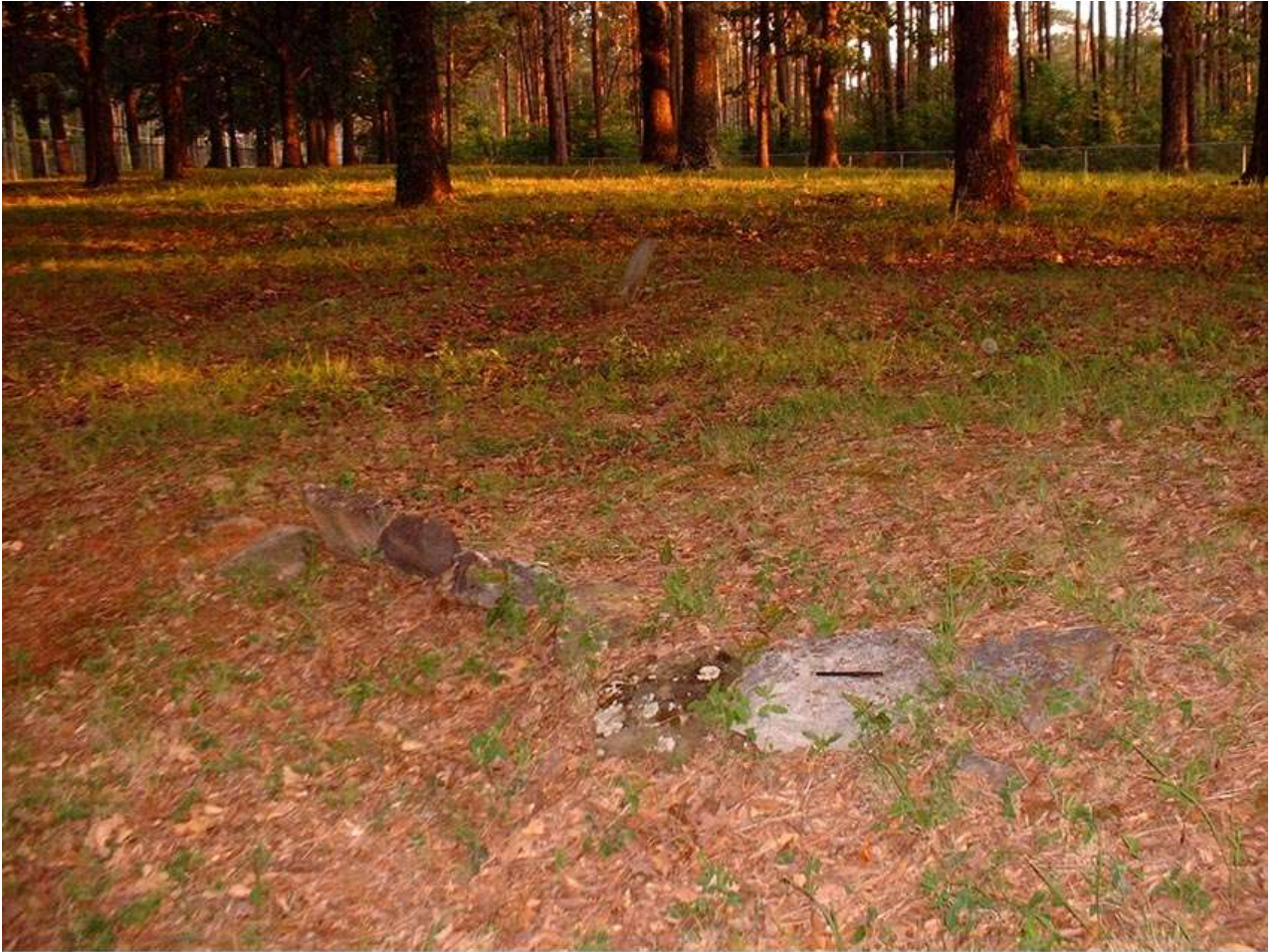
Fennil Cemetery, Redstone Arsenal, Madison Co., AL, June, 2002.

This photo shows an area bounded by stones to possibly denote a family area for burials. There is a leaning tombstone in the upper background, at center.