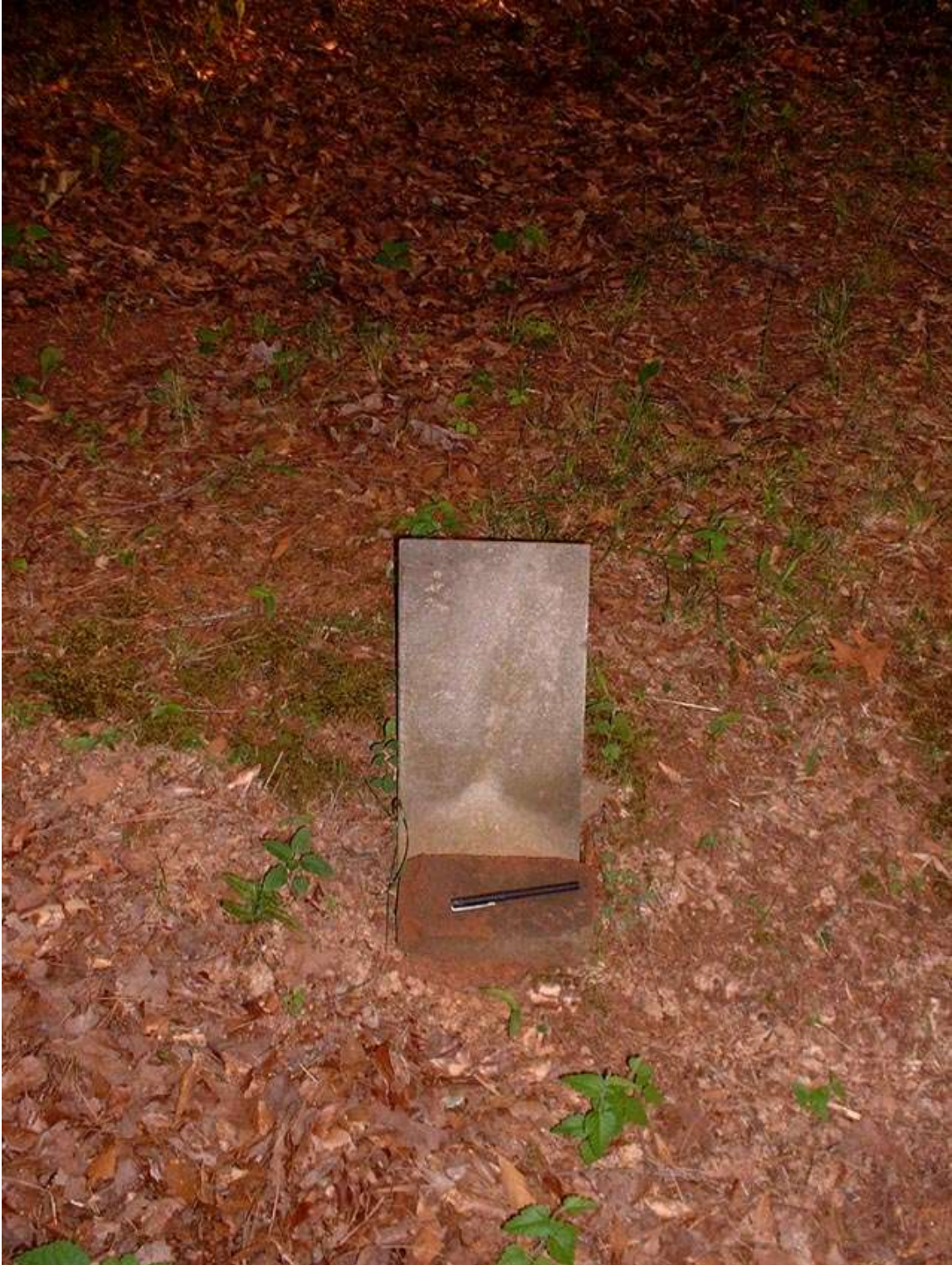
Fennil Cemetery, Redstone Arsenal, Madison Co., AL, June, 2002. This uninscribed rectangular concrete tombstone has a brick at its base.