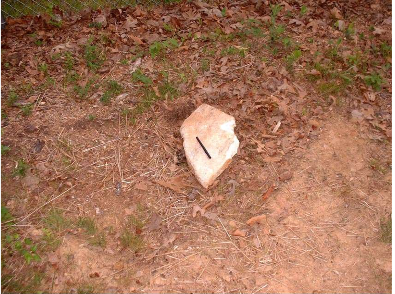
Fennil Cemetery, Redstone Arsenal, Madison Co., AL, June, 2002.

This broken piece of a tombstone contained no inscriptions, but it is located at an obvious gravesite.