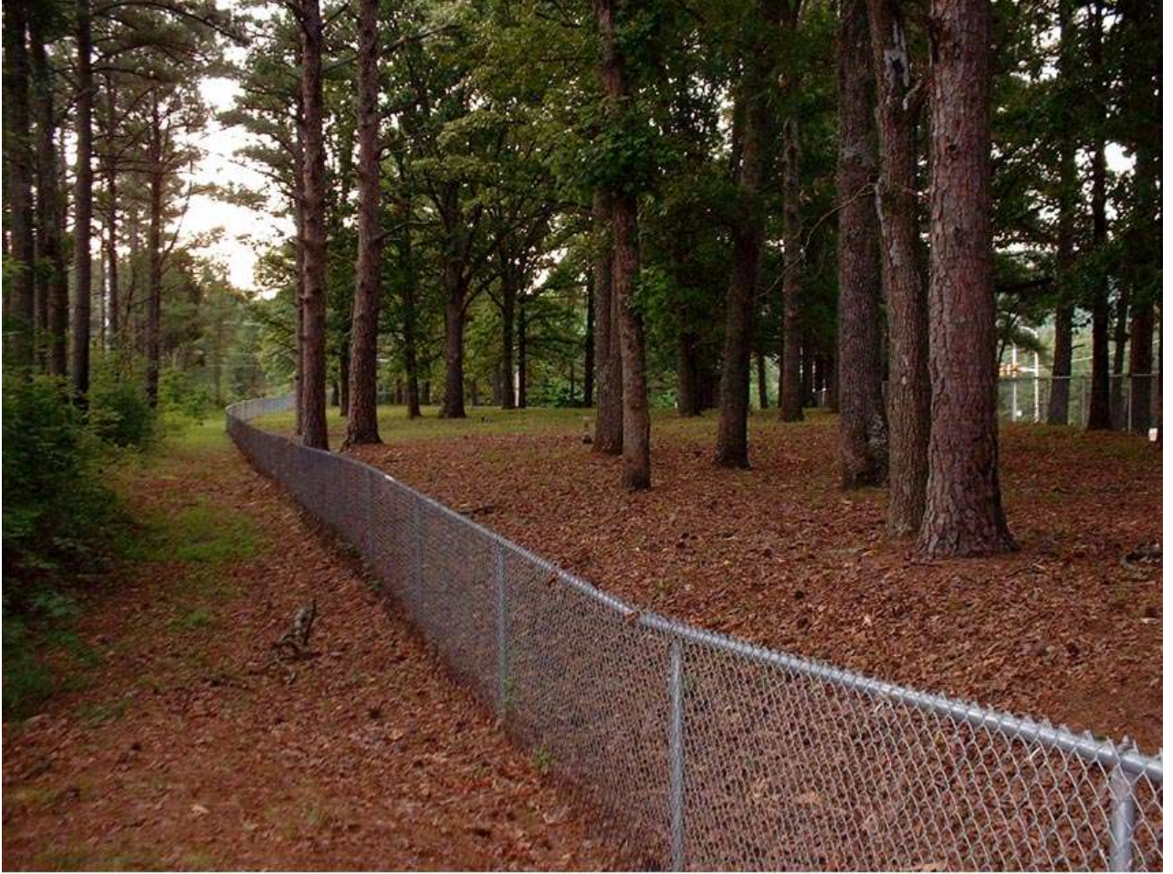
Fennil Cemetery, Redstone Arsenal, Madison Co., AL, June, 2002.

This overview from the southwestern portion of the cemetery perimeter looks toward the intersection of Martin Road with Mills Road, which can be seen as the traffic light in the background. Careful inspection of the photo will show the tombstone of Silla Moore in the center of the picture, very near the base of a pine tree.