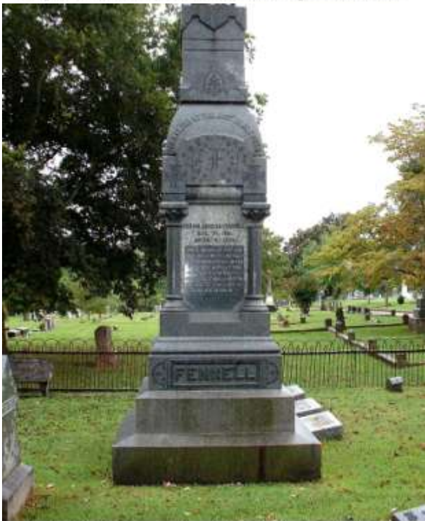
Maple Hill Cemetery (Huntsville, AL), September 7, 2004