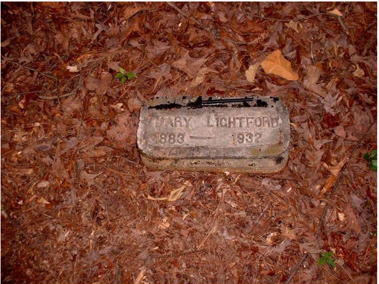
Fennil Cemetery, Redstone Arsenal, Madison Co., AL, June, 2002.