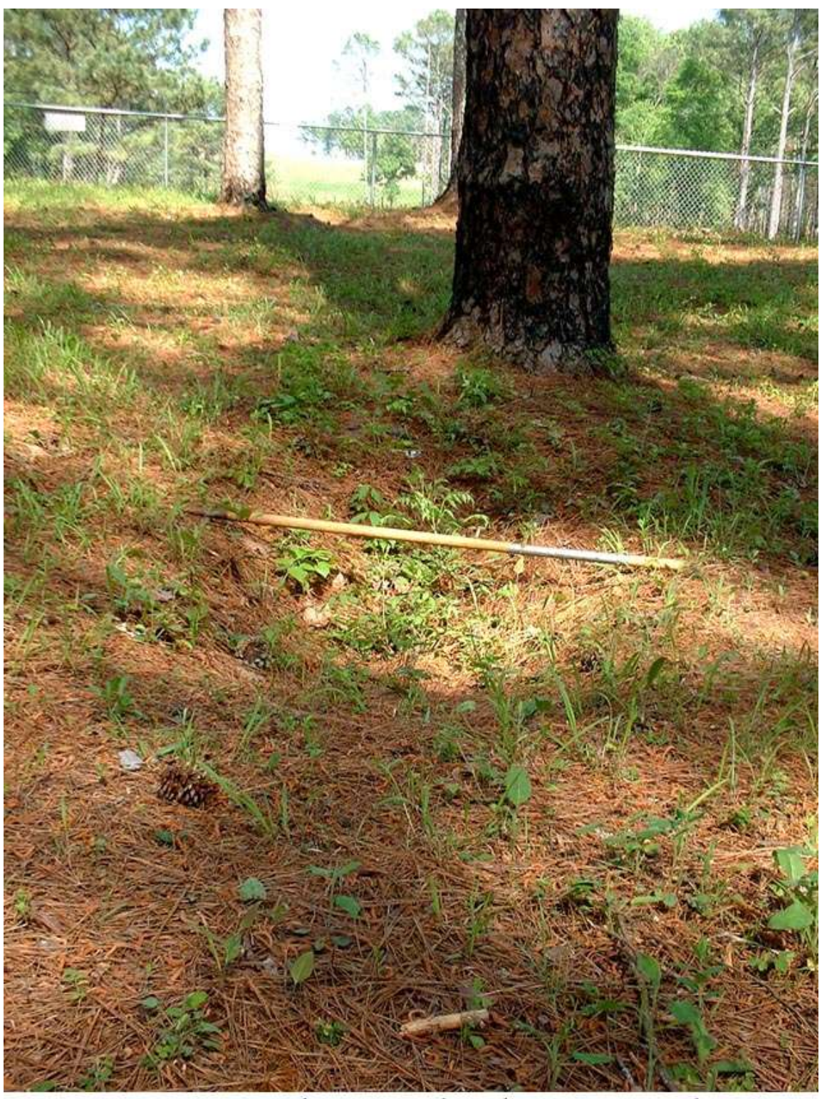
Jamar Cemetery, 88-1, Redstone Arsenal, Madison Co. AL, April 28, 2003

Just another example of the numerous grave depressions with no markers.