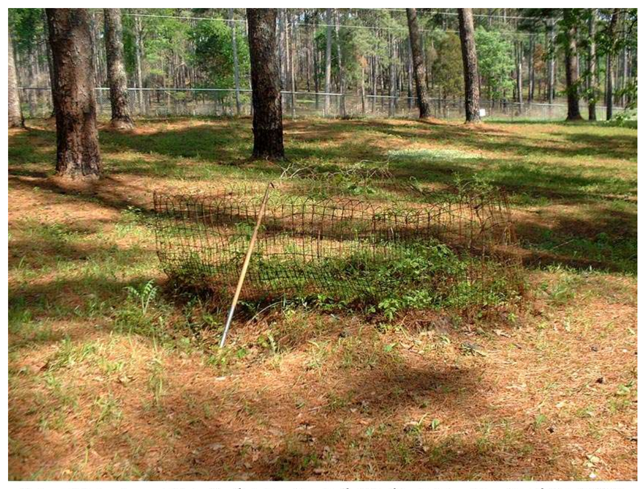
Jamar Cemetery, 88-1, Redstone Arsenal, Madison Co. AL, April 28, 2003

The inner fenced area is obviously a separated family plot, but it is not known which family is buried there, as there are no tombstones.