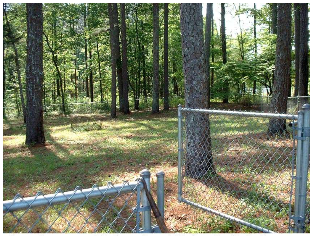
Jamar Cemetery, 88-1, Redstone Arsenal, Madison Co. AL, April 28, 2003

There is a small green growth area in the background above, just to the left of center, enclosed by an inner fence as shown below.