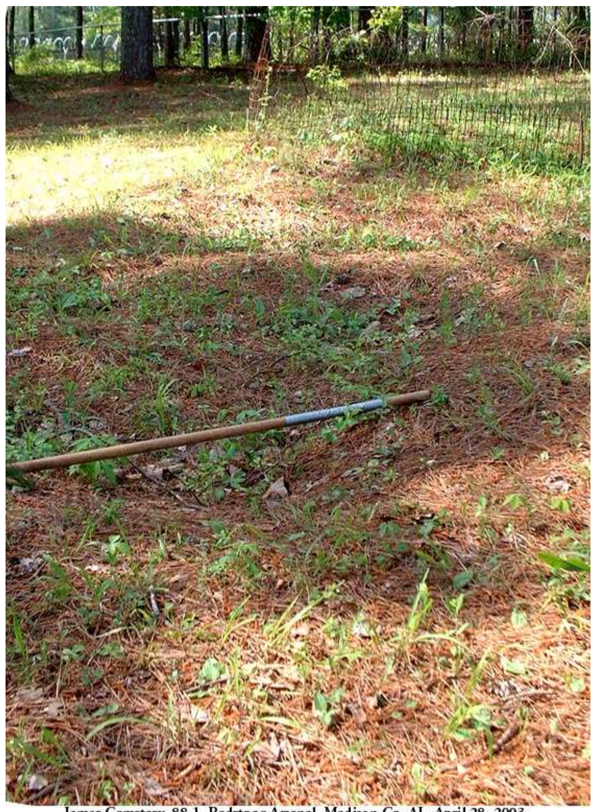
Jamar Cemetery, 88-1, Redstone Arsenal, Madison Co. AL, April 28, 2003 There are no stones at all in this cemetery, but there is one possible fieldstone marker thrown over the fence onto the shoulder of McAlpine Road about 15 feet south of the gate.