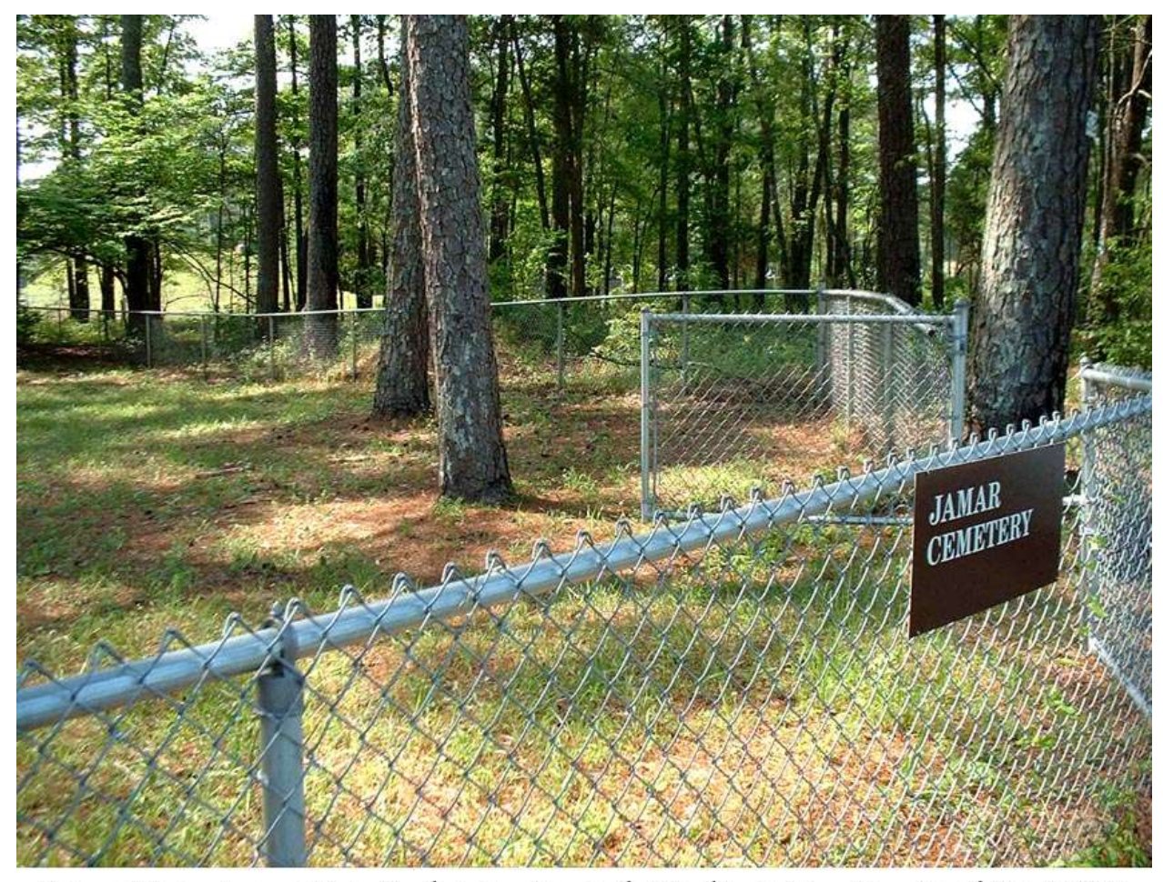
Jamar Cemetery, 88-1, Redstone Arsenal, Madison Co. AL, April 28, 2003

This view is toward the west, along the northern end of the cemetery.