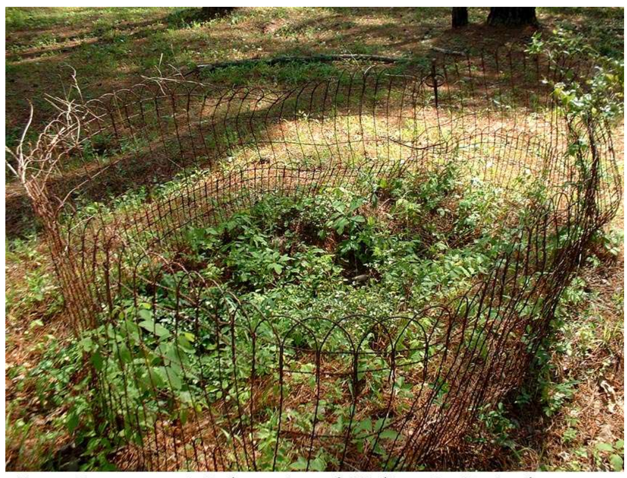
Jamar Cemetery, 88-1, Redstone Arsenal, Madison Co. AL, April 28, 2003

View into the inner fenced area, showing what appears to be two graves that are very deeply sunken and overgrown.