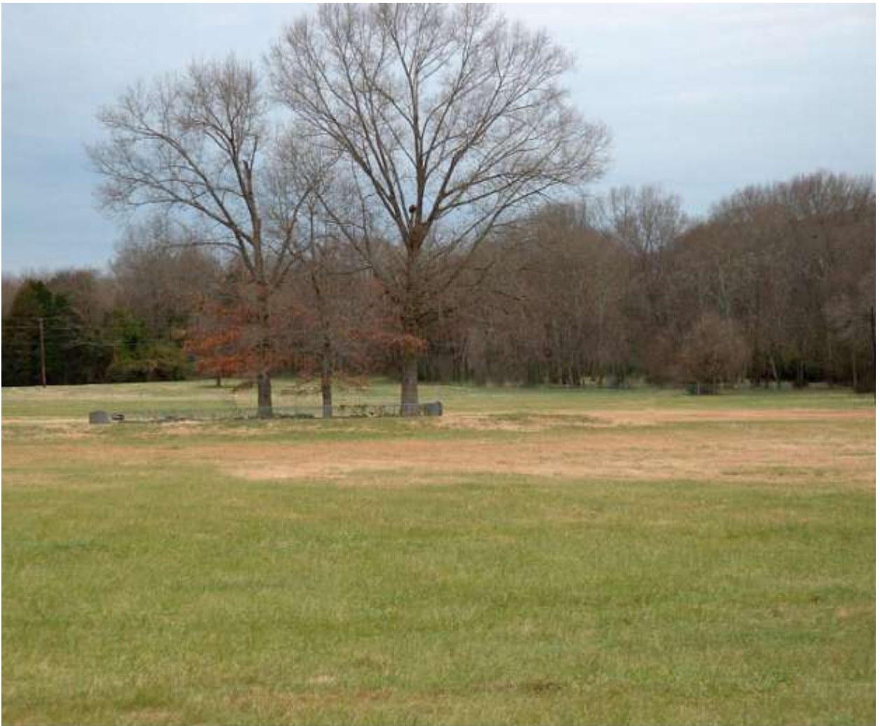
JONES CEMETERY, 37-5, Redstone Arsenal, Madison County, Alabama: E/2, S22-T4-R1W.