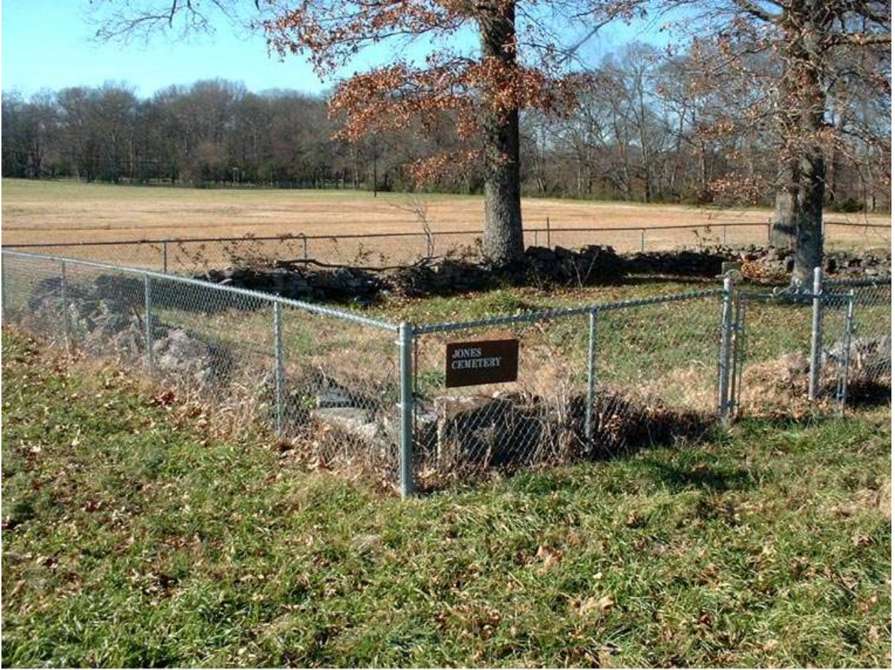
JONES CEMETERY, 37-5, Redstone Arsenal, Madison Co. AL Located west of Hipar Road in the National Guard area, E/2 of S22-T4-R1W. Access via south end of Triana Blvd., vehicle gate at Buildings 3795 & 3797. Pedestrian gates near Building 3793. Cemetery about 150 yards west of fence.