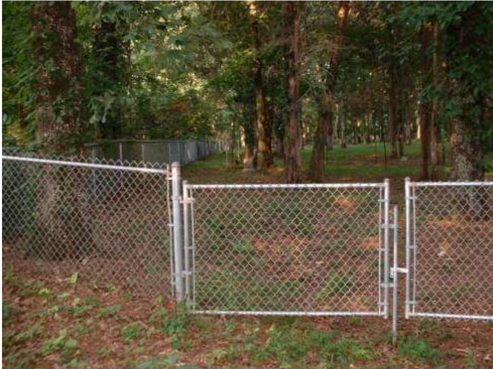
Jordan - Jacobs Cemetery, Redstone Arsenal, Madison Co., AL, June, 2002.

This cemetery is located approximately on the line between S33-T4S-R1W and S4-T5S-R1W.