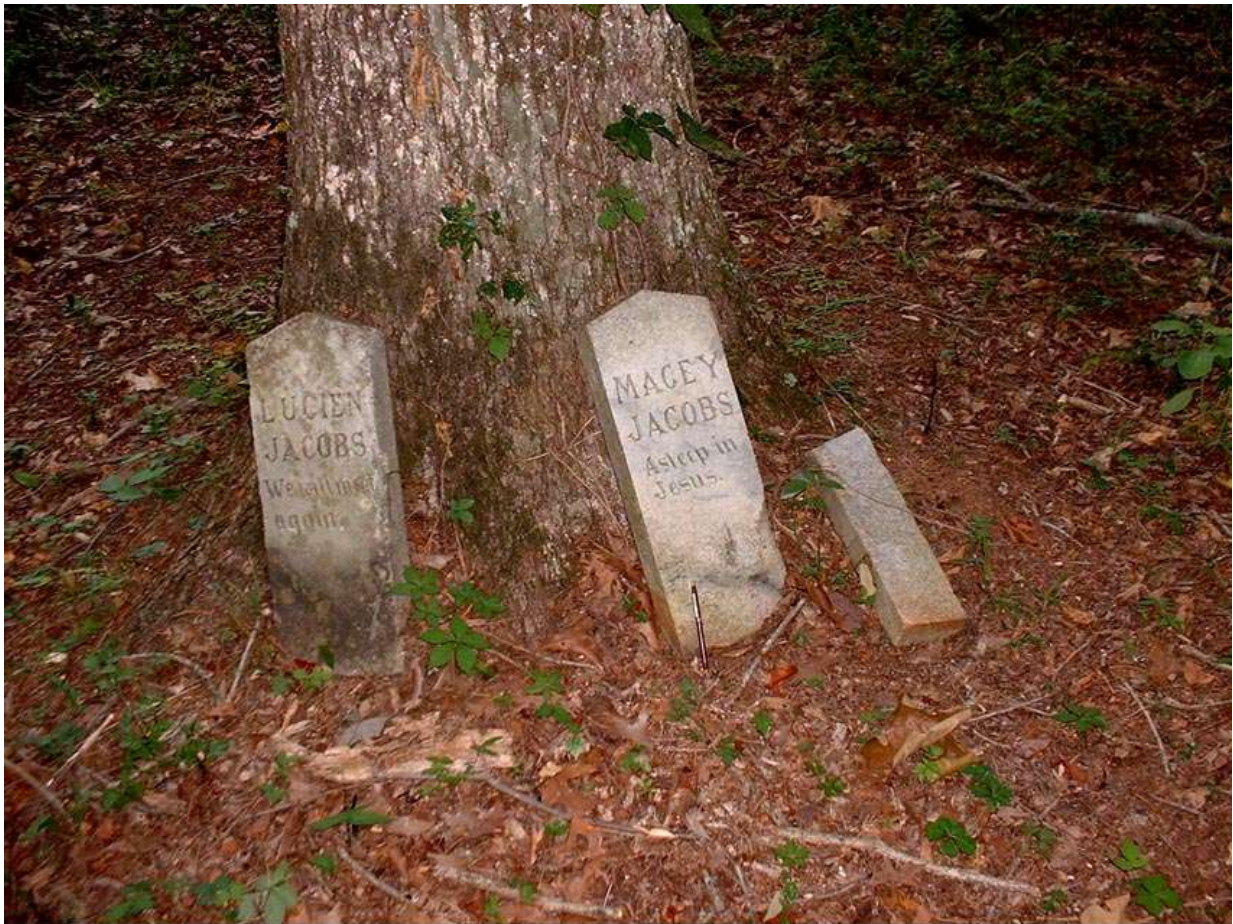
Jordan - Jacobs Cemetery, Redstone Arsenal, Madison Co., AL, June, 2002.