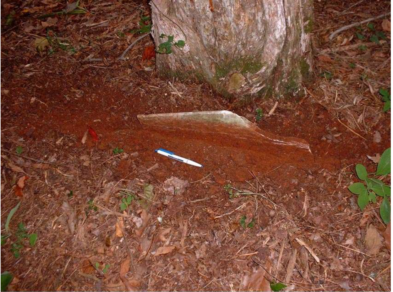
Jordan - Jacobs Cemetery, Redstone Arsenal, Madison Co., AL, June, 2002.

This marker will have to be dug out with a shovel to view both sides clearly in checking for inscriptions. It is firmly buried in very hard clay and could not be extricated with the hoe handle and hook used for the June 2002 visit.