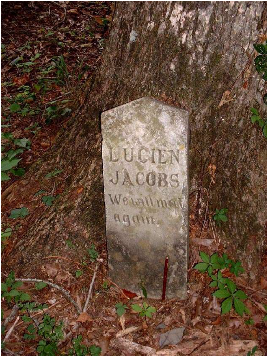
Jordan - Jacobs Cemetery, Redstone Arsenal, Madison Co., AL, June, 2002.