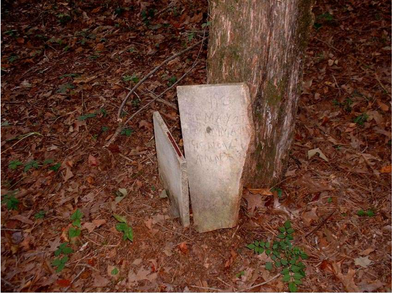
Jordan - Jacobs Cemetery, Redstone Arsenal, Madison Co., AL, June, 2002.

(A closer view of this marker is given below.)