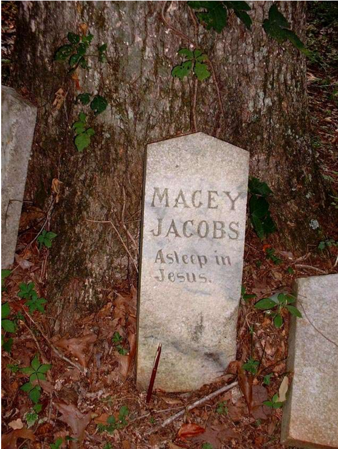
Jordan - Jacobs Cemetery, Redstone Arsenal, Madison Co., AL, June, 2002.