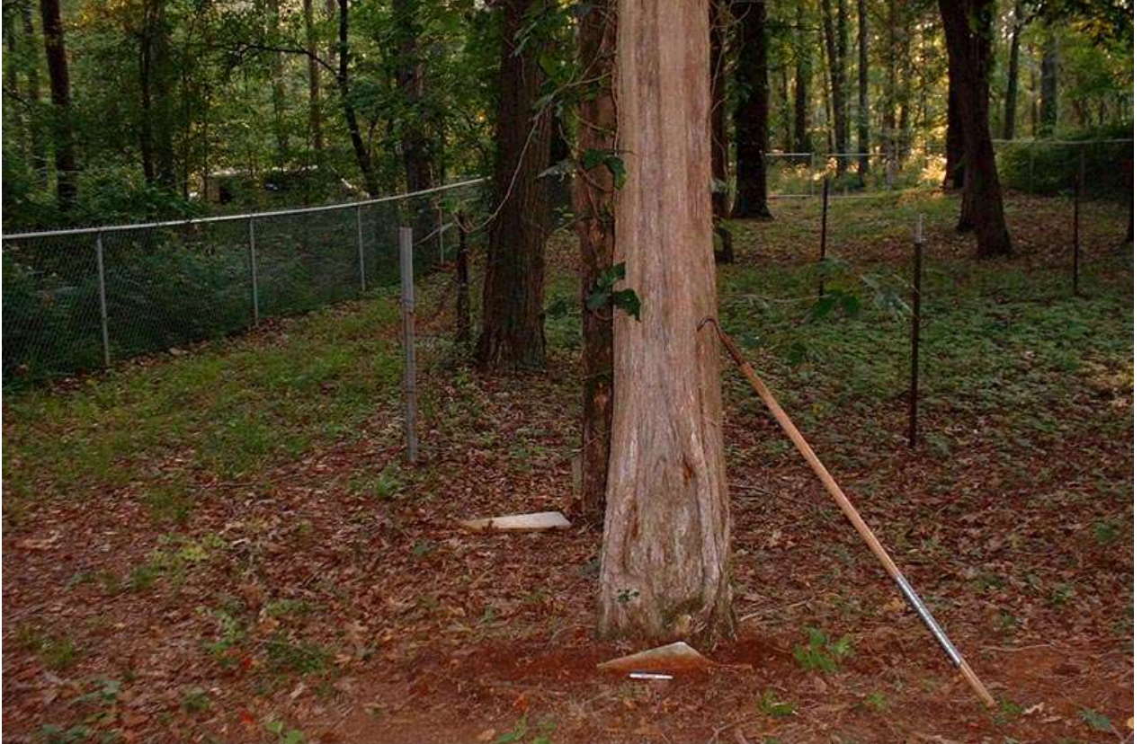
Jordan - Jacobs Cemetery, Redstone Arsenal, Madison Co., AL, June, 2002.