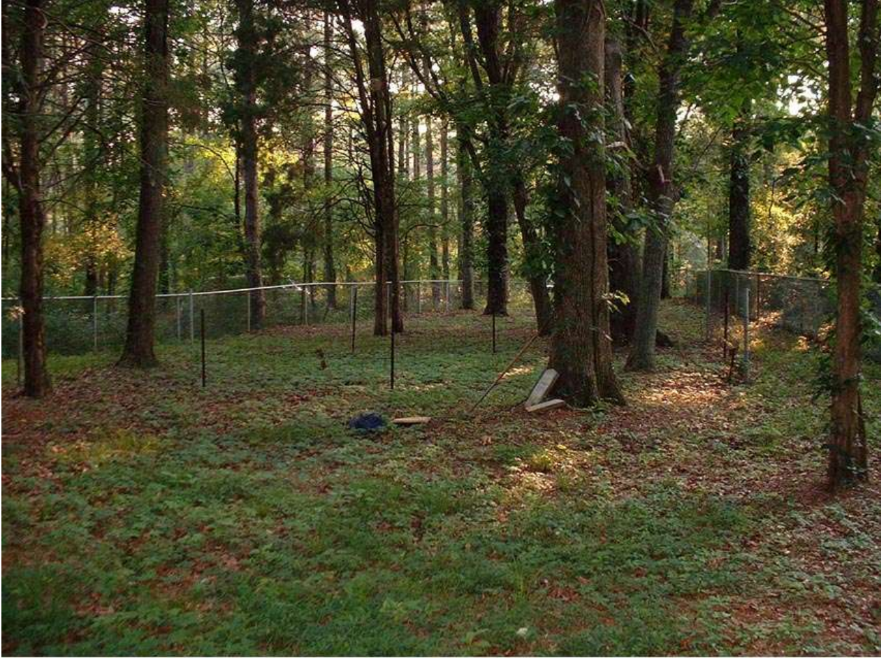
Jordan - Jacobs Cemetery, Redstone Arsenal, Madison Co., AL, June, 2002.

There are numerous rectangular grave depressions evident outside both the east and the west sides of the inner (hogwire) fenced area. The overall size of the cemetery could hold many hundreds of graves, but the depressions are only in evidence at the west end of the cemetery.