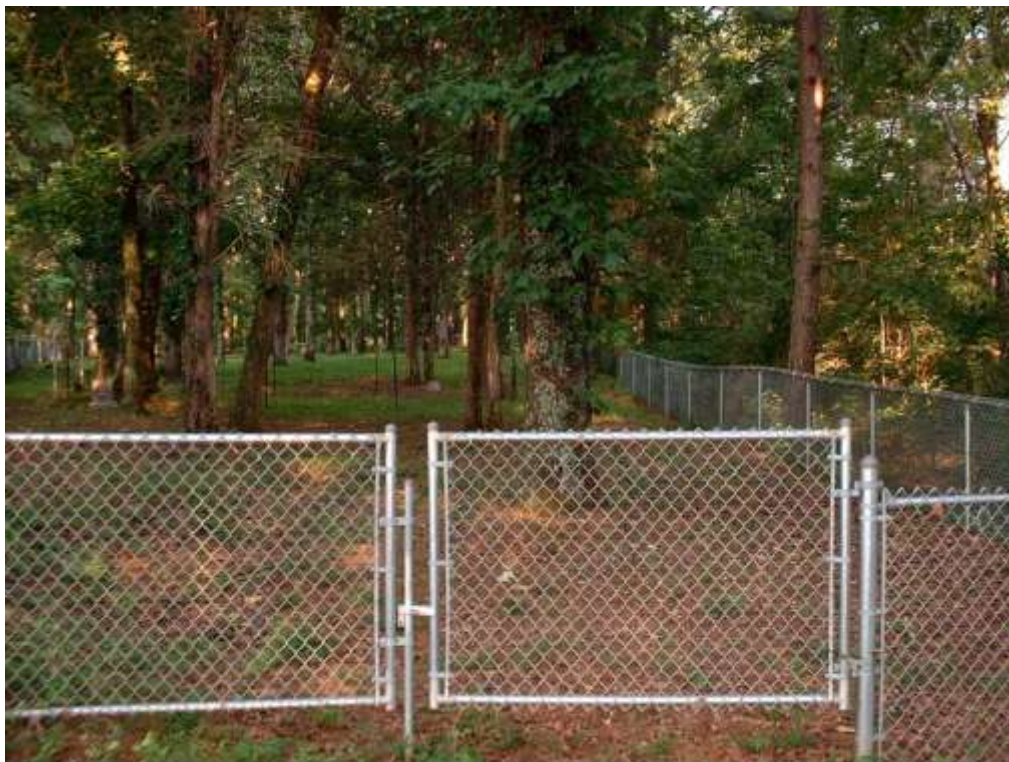
Jordan - Jacobs Cemetery, Redstone Arsenal, Madison Co., AL, June, 2002.

This cemetery is located approximately on the line between S33-T4S-R1W and S4-T5S-R1W.