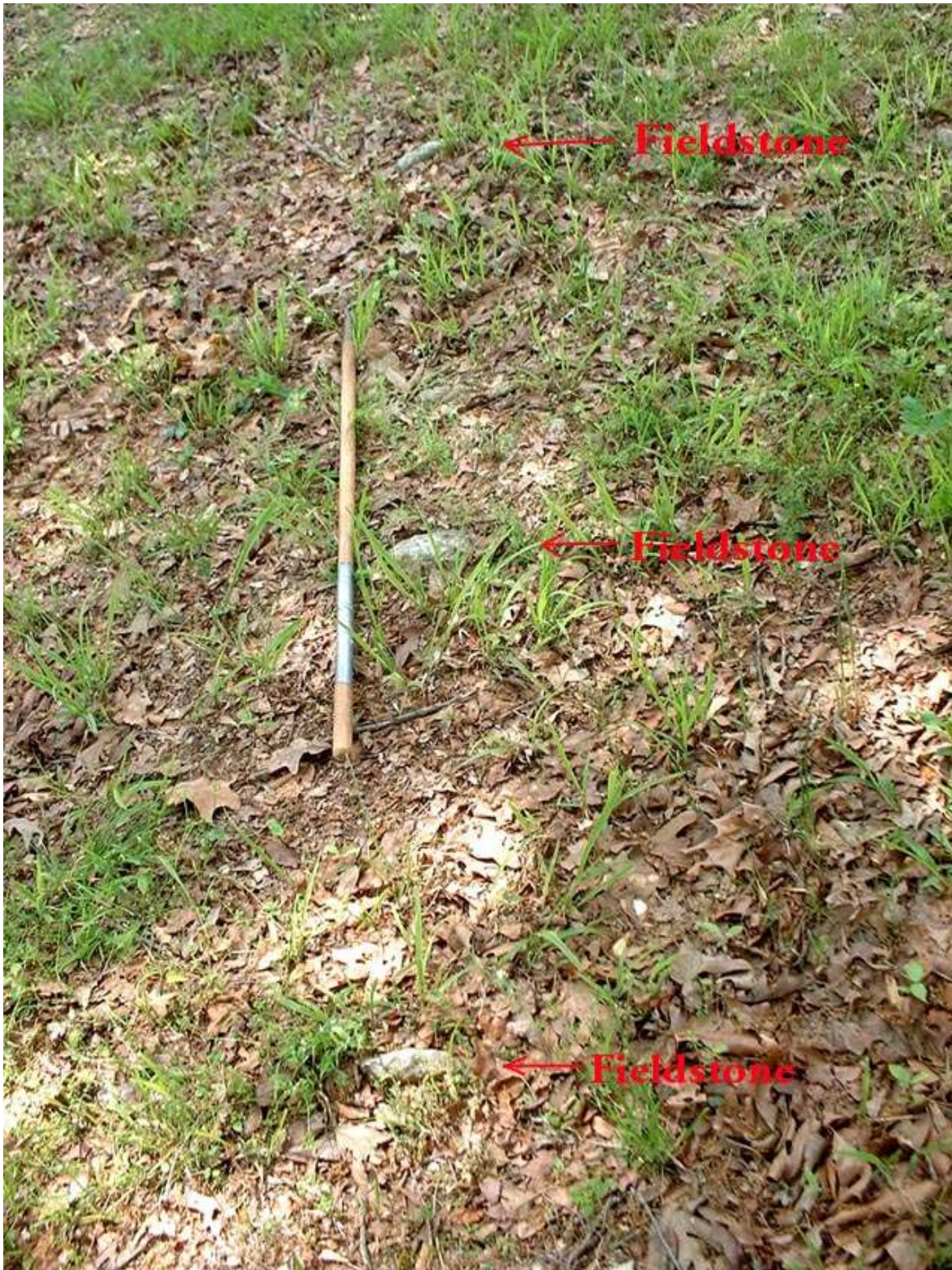
Lacy Cemetery, 75-1, Redstone Arsenal, Madison Co. AL, May 1, 2003 Grave depressions associated with these fieldstones were apparent to the eye, if not to the camera. These graves were located toward the eastern side of the cemetery, along the southern edge of the drainage area through the north end of the cemetery.