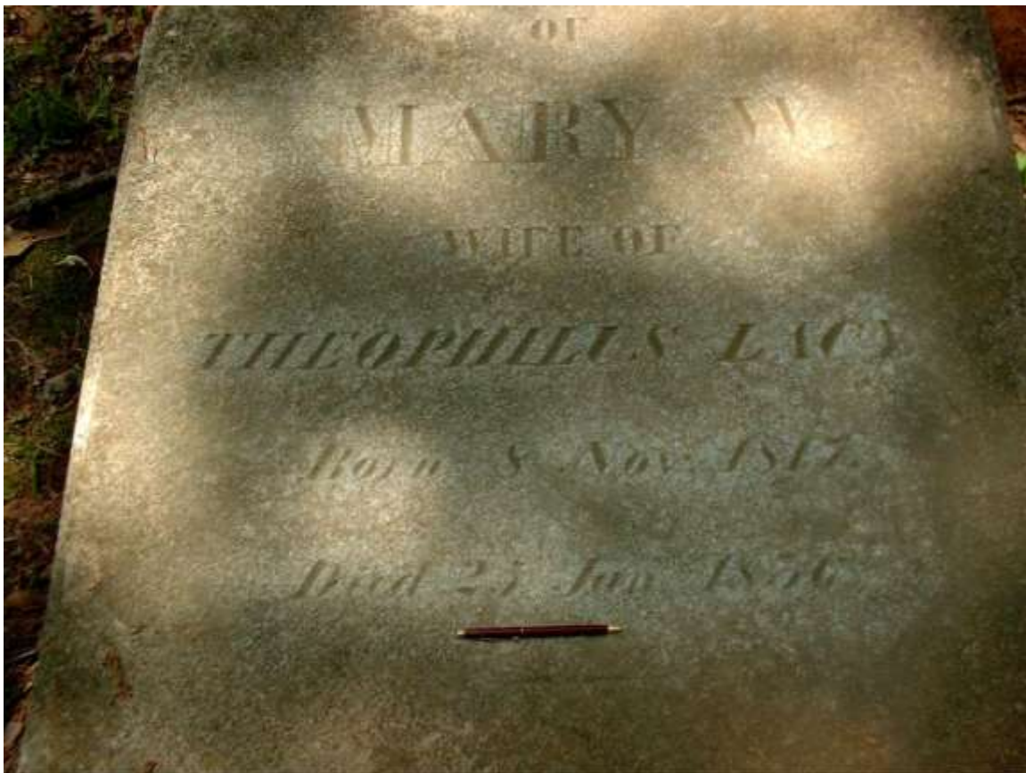
Lacy Cemetery, 75-1, Redstone Arsenal, Madison Co. AL, May 1, 2003