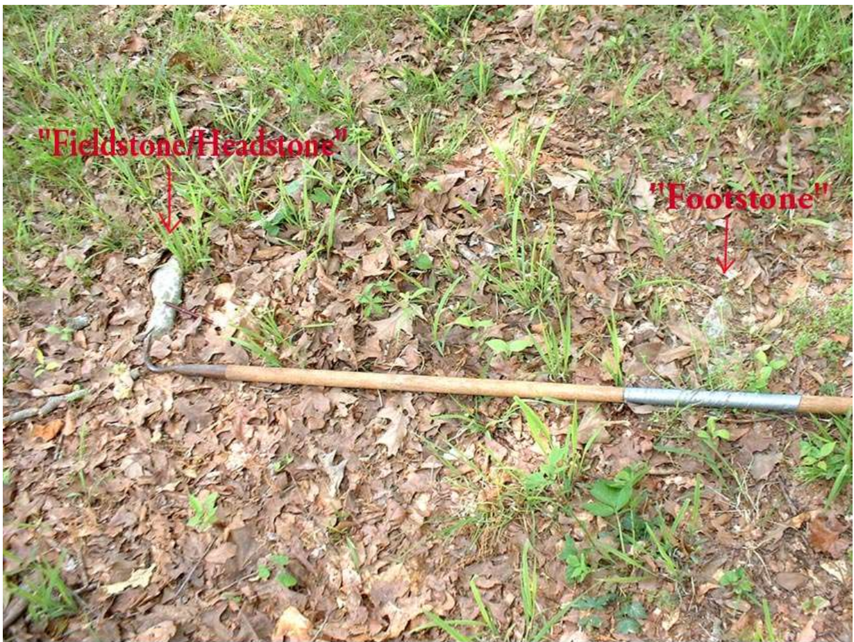
Lacy Cemetery, 75-1, Redstone Arsenal, Madison Co. AL, May 1, 2003 Child-sized grave east of box crypts, along south side of drainage area.