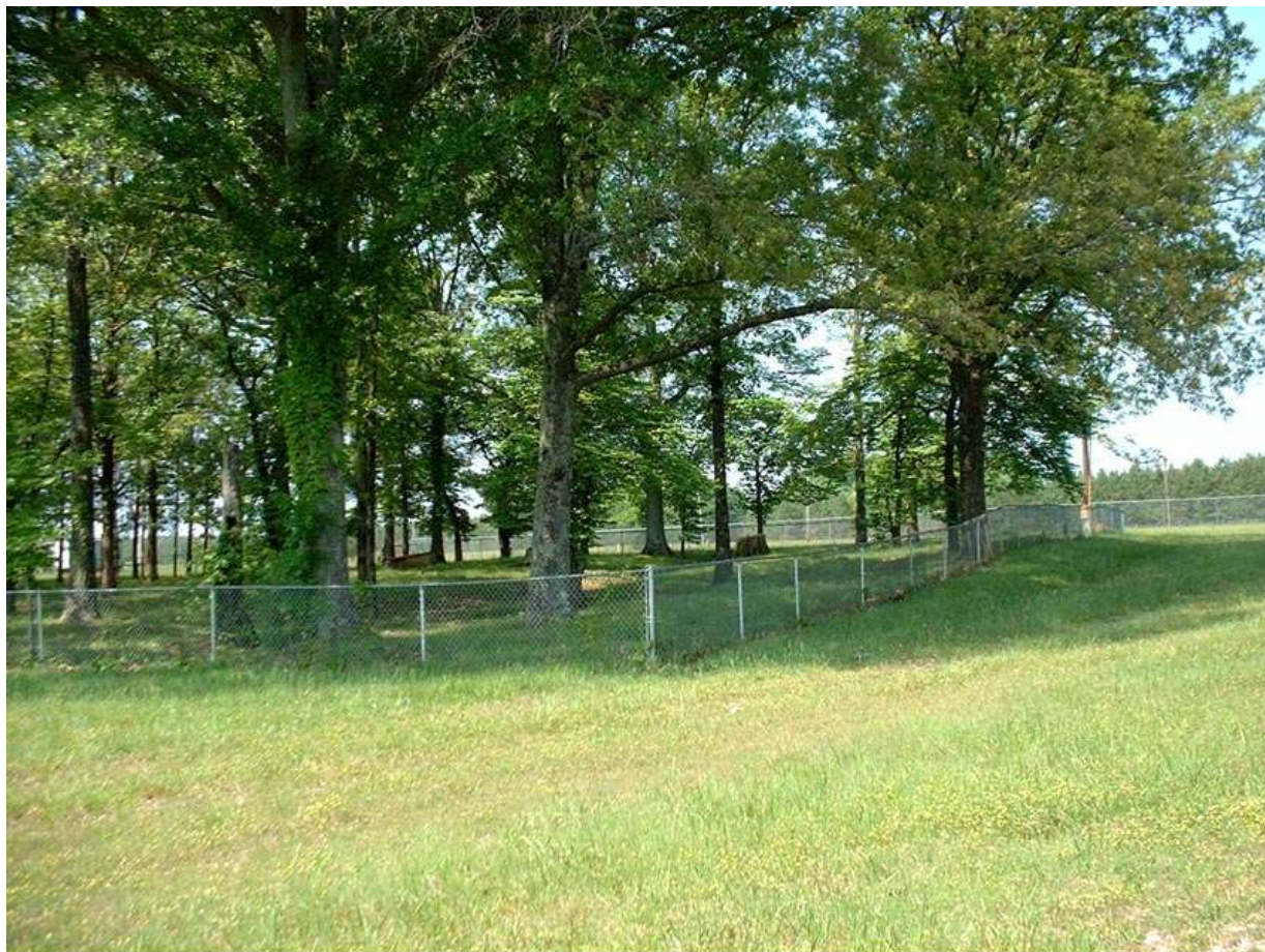
Lacy Cemetery, 75-1, Redstone Arsenal, Madison Co. AL, May 1, 2003 Large stump to right of center, box crypt to left of center

At the time of the 2003 visit to this cemetery, it was within the bounds of a highly secure area. Therefore, casual or impromptu visits are not allowed. The cemetery is the resting place of some of the early pioneer families of Madison County. It is found at the line between Sections 13 and 14 of