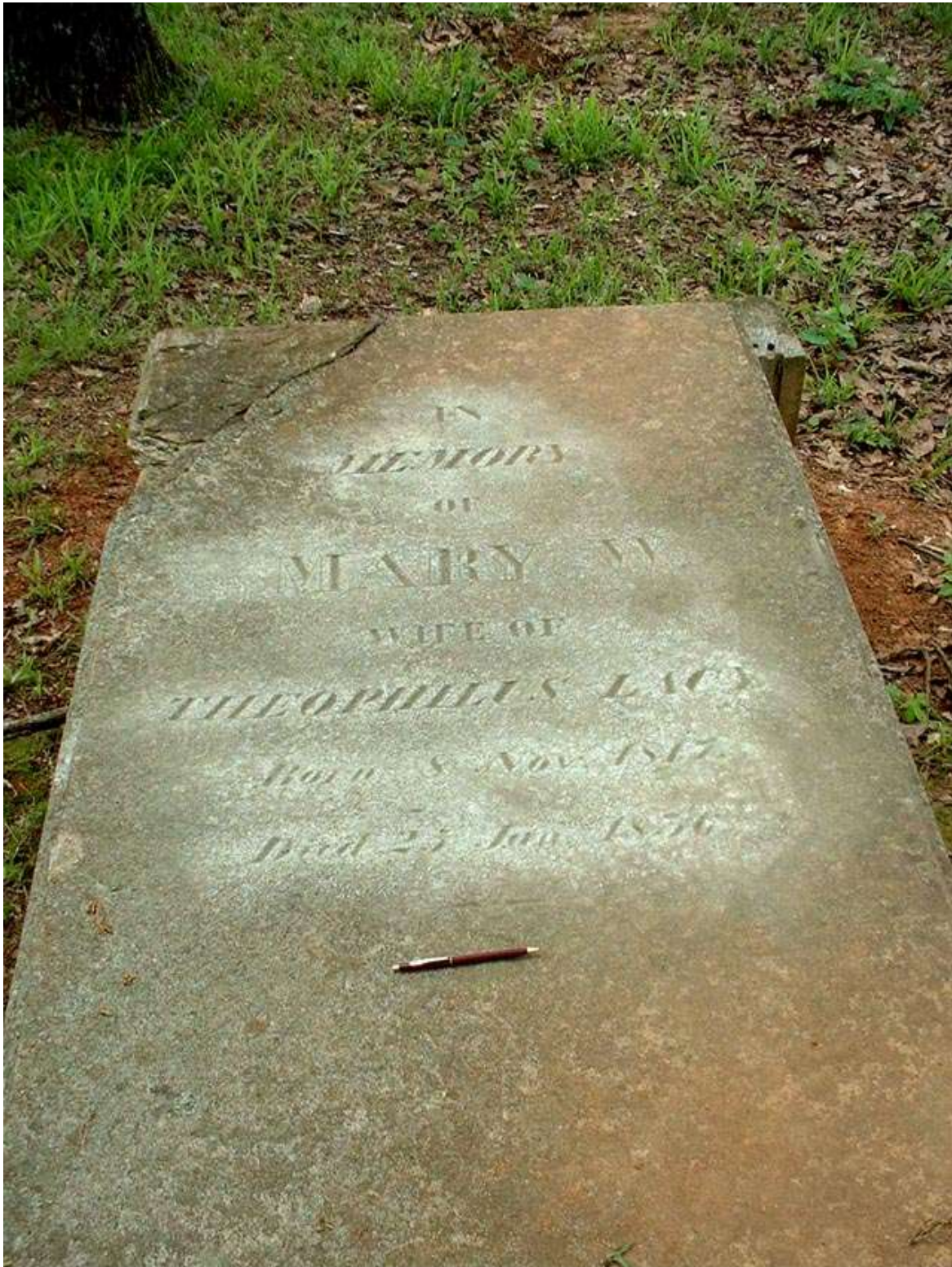
Lacy Cemetery, 75-1, Redstone Arsenal, Madison Co. AL, May 1, 2003