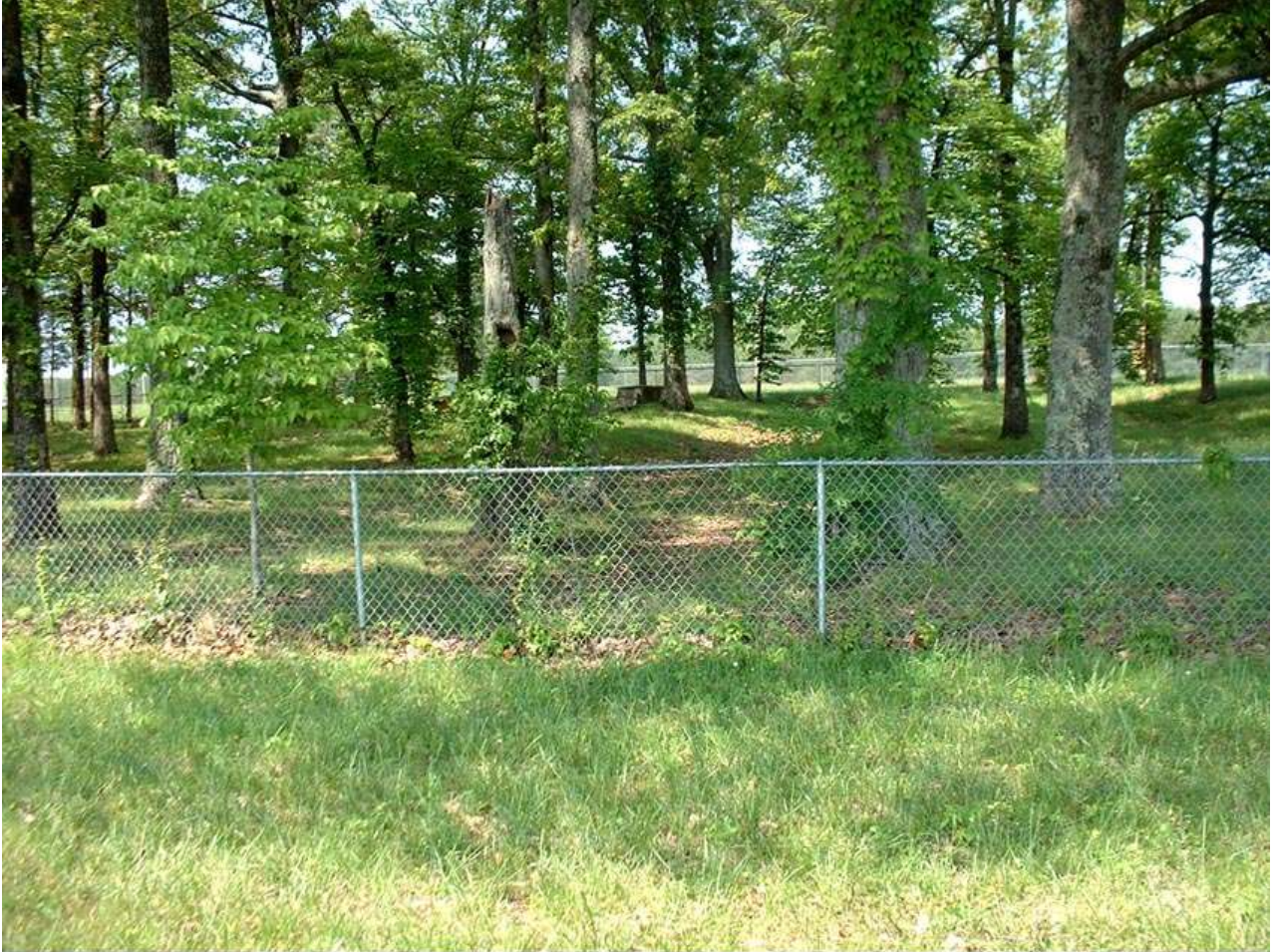
Lacy Cemetery, 75-1, Redstone Arsenal, Madison Co. AL, May 1, 2003 Note box crypt under trees on south side of drainage ditch through cemetery. Four uninscribed stones marking graves were found in this cemetery which can hold around 250 to 300 graves if full. However, only about 20 obvious grave depressions were located. These were mostly near the north end of the cemetery.

Prepared by John P. Rankin, August 12, 2005.