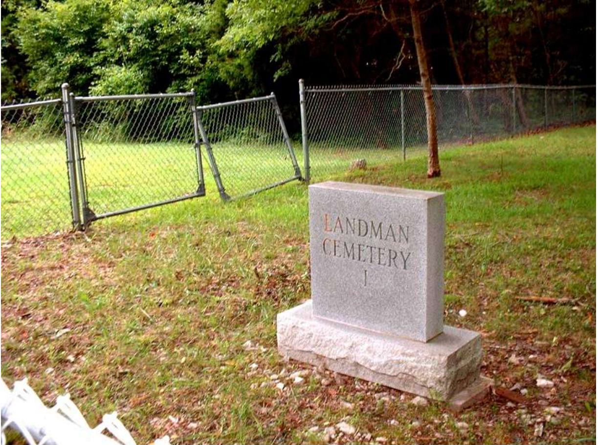
Landman Cemetery I, Redstone Arsenal, Madison County, Alabama, July 2002.