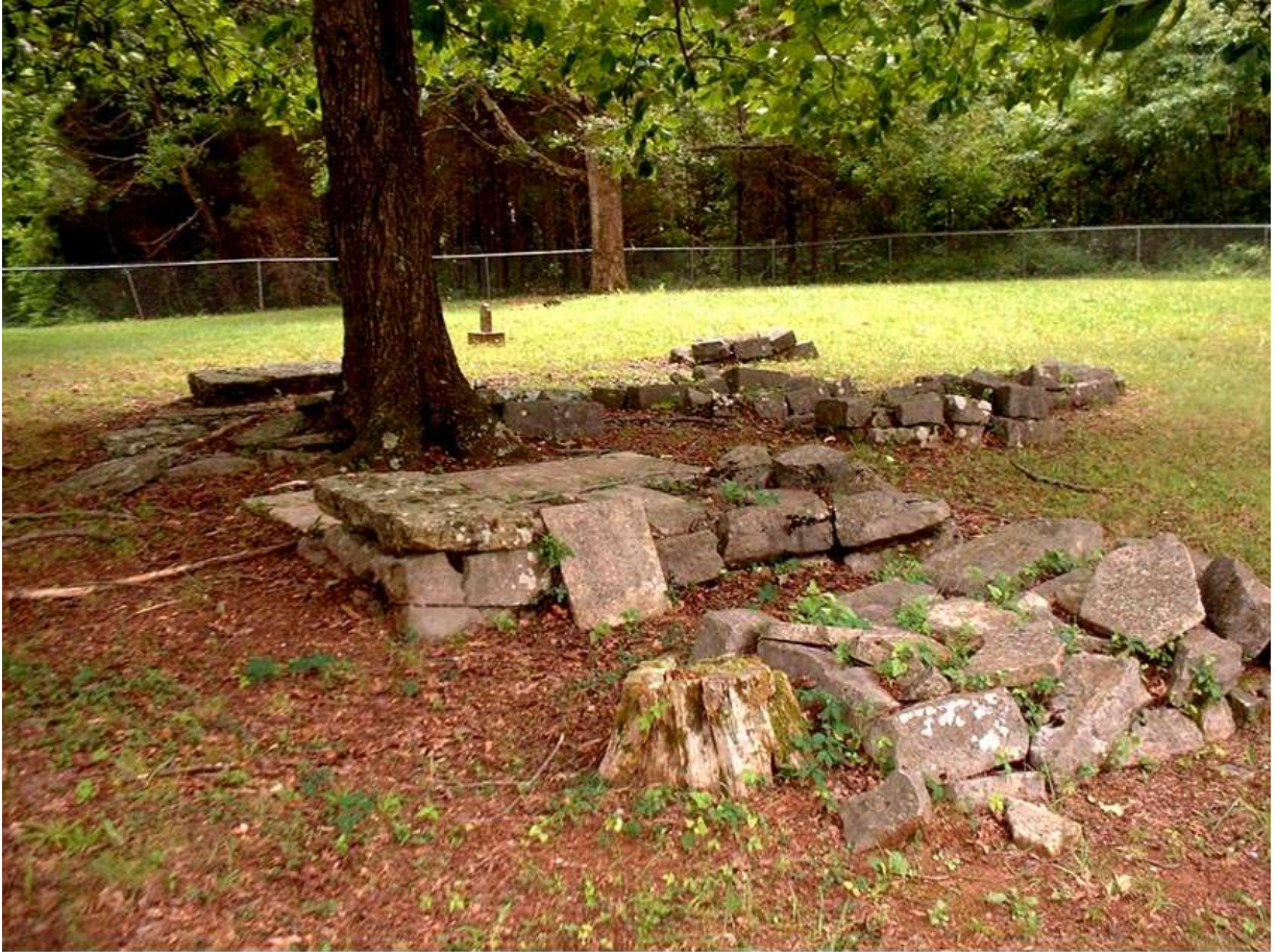
Landman Cemetery I, Redstone Arsenal, Madison County, Alabama, July 2002.