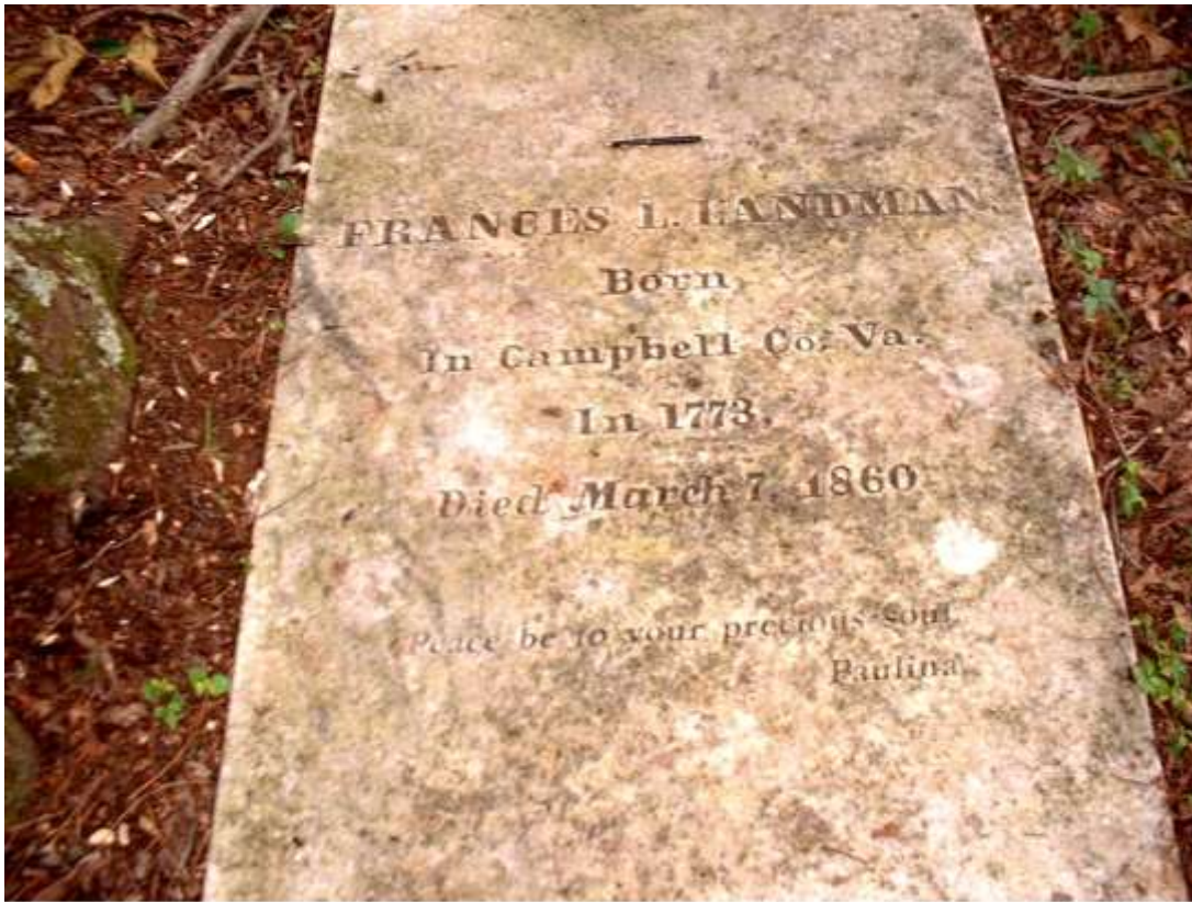
Landman Cemetery I, Redstone Arsenal, Madison County, Alabama, July 2002.