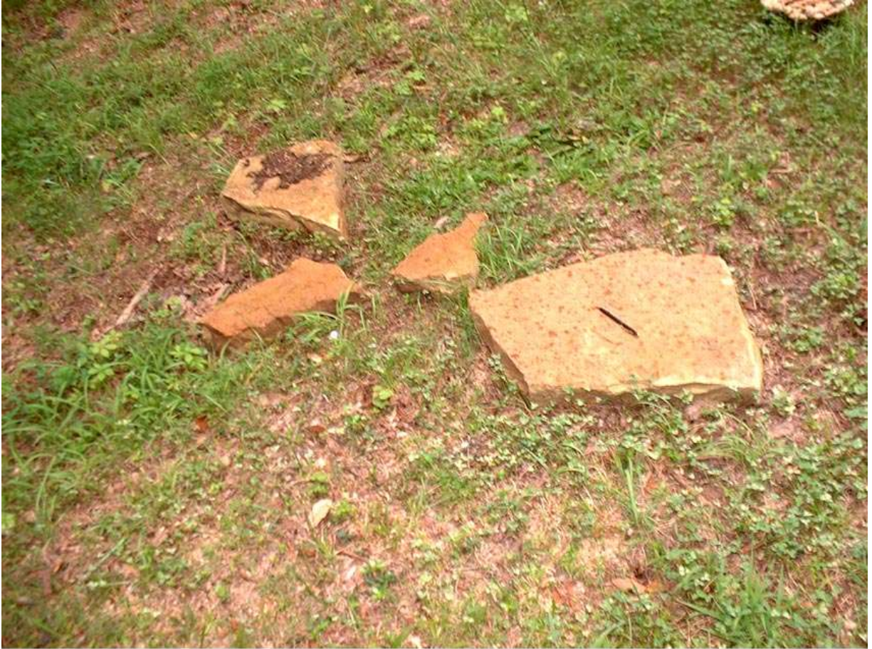
Landman Cemetery I, Redstone Arsenal, Madison County, Alabama, July 2002.