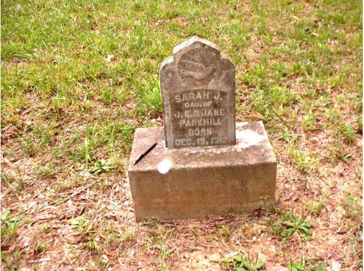
Landman Cemetery I, Redstone Arsenal, Madison County, Alabama, July 2002.