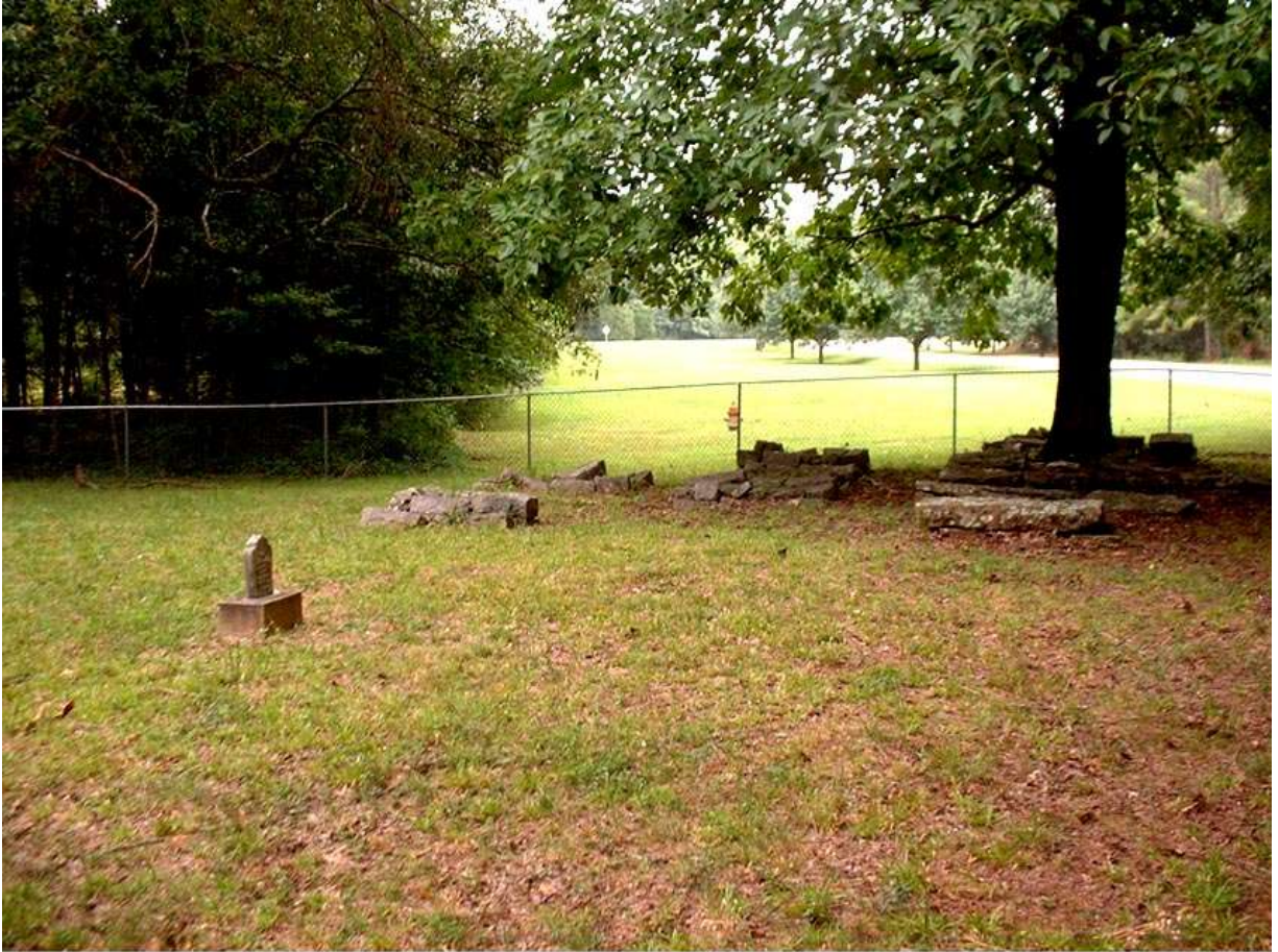
Landman Cemetery I, Redstone Arsenal, Madison County, Alabama, July 2002.