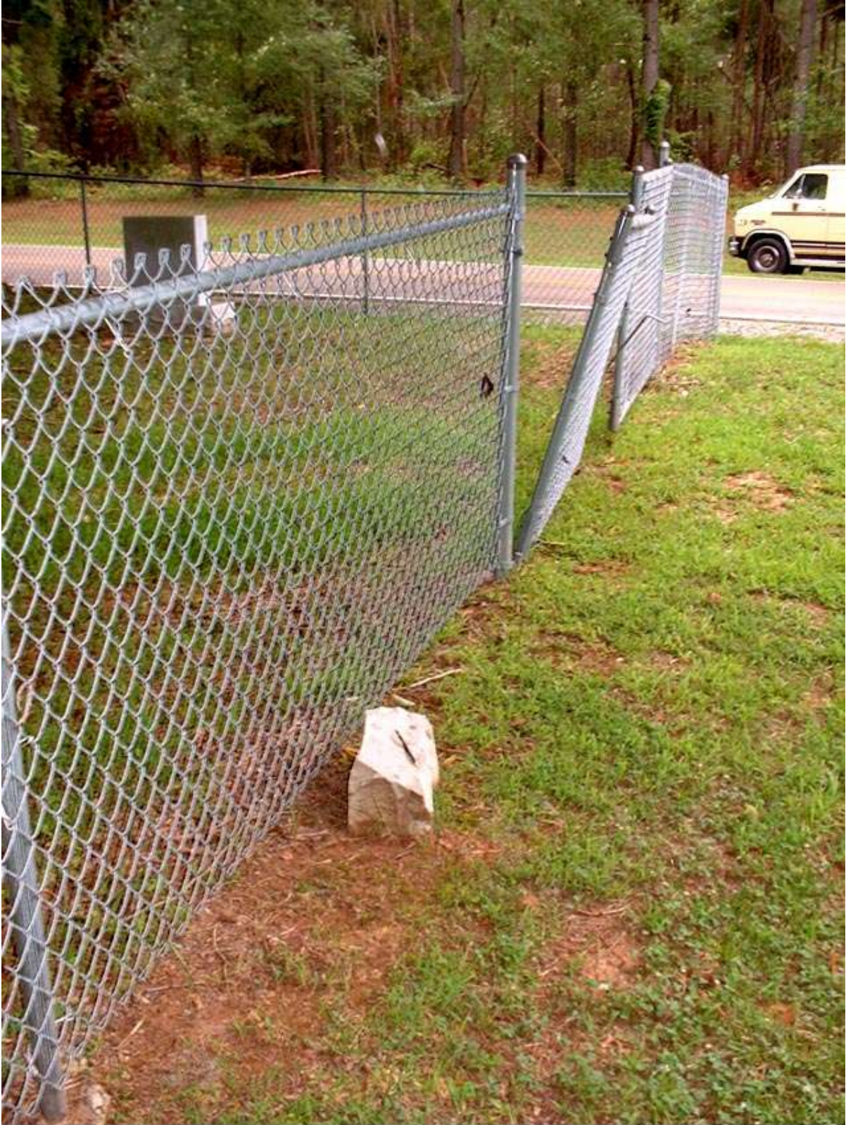
Landman Cemetery I, Redstone Arsenal, Madison County, Alabama, July 2002.