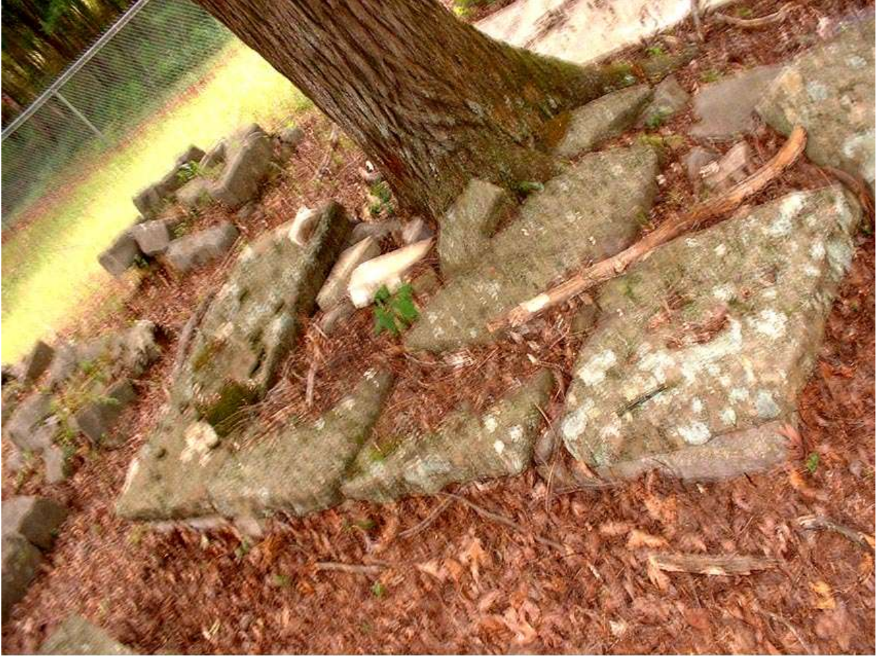
Landman Cemetery I, Redstone Arsenal, Madison County, Alabama, July 2002.