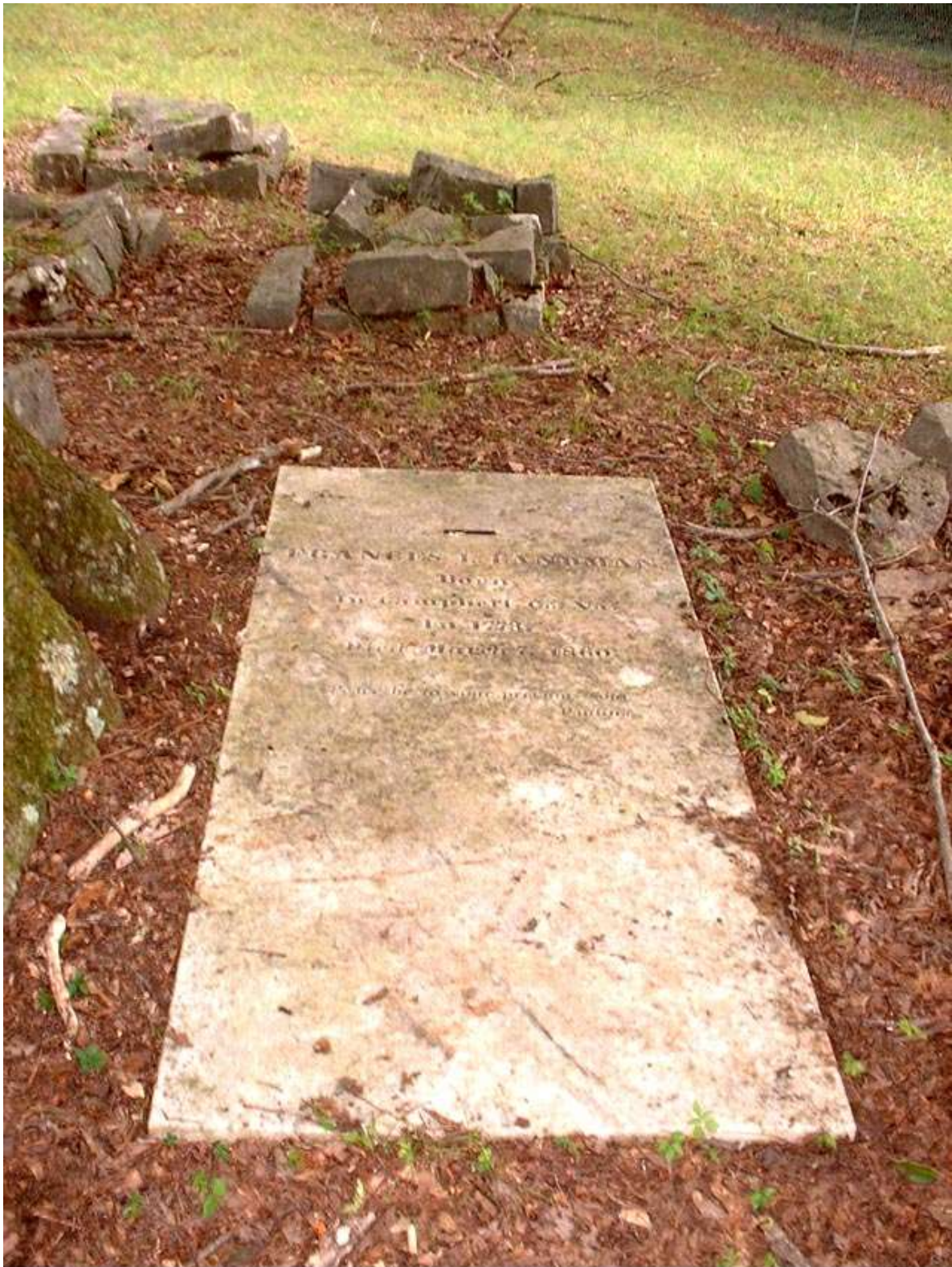
Landman Cemetery I, Redstone Arsenal, Madison County, Alabama, July 2002.