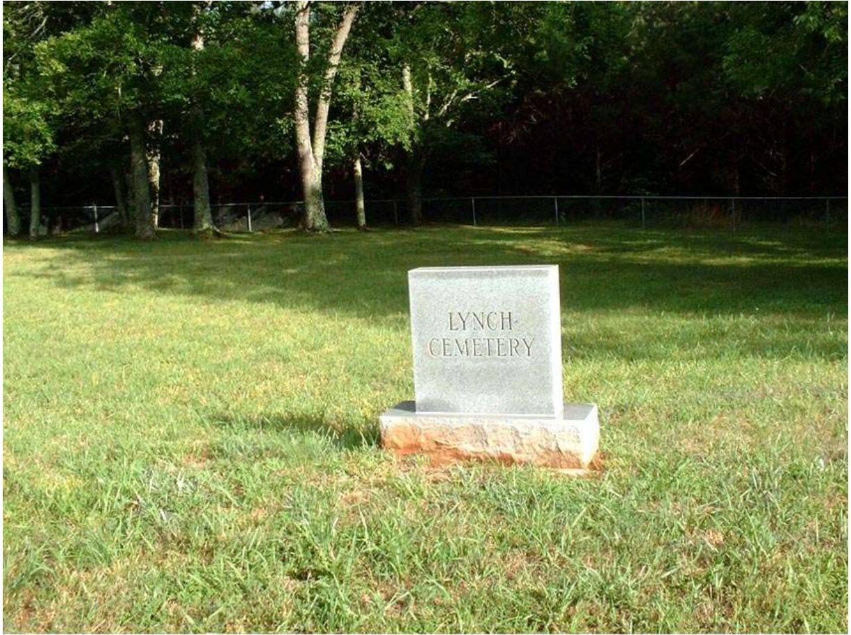
Lynch Cemetery (89-3), Redstone Arsenal, Madison County, Alabama, July 2002.

maps used in this study cannot precisely fit the cemetery into either quarter section with authority.