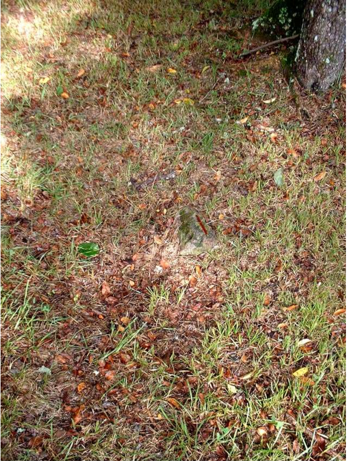
Lynch Cemetery (89-3), Redstone Arsenal, Madison County, Alabama, July 2002.