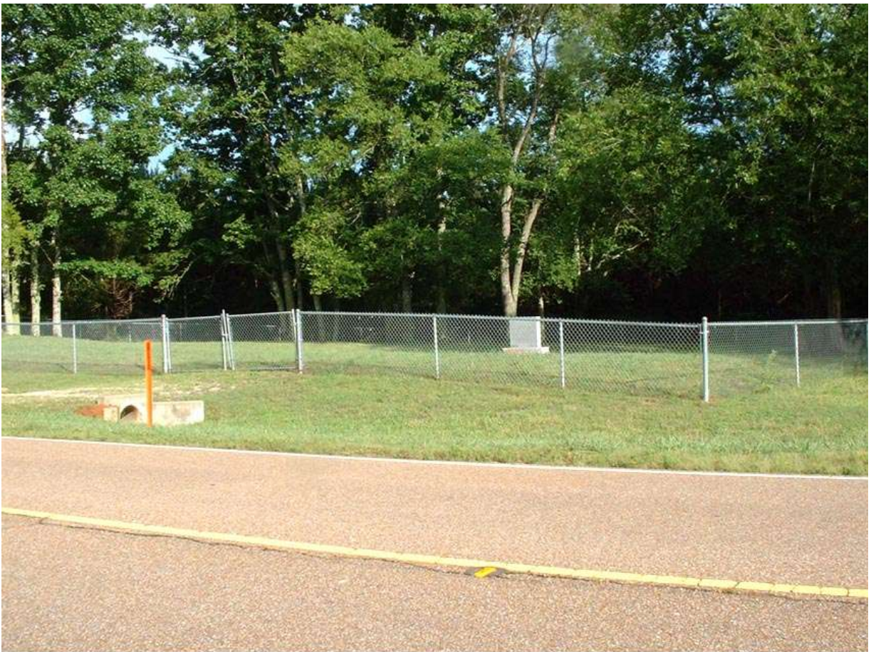
Lynch Cemetery (89-3), Redstone Arsenal, Madison County, Alabama, July 2002.

This cemetery is located on the south side of Buxton Road, east of the Timmons Cemetery Road and Briar Road intersections. It is about on the line between the NW/4 and the NE/4 of Section 22, Township 5, Range 1W. It may be entirely within either the NW/4 or the NE/4, but the accuracy of