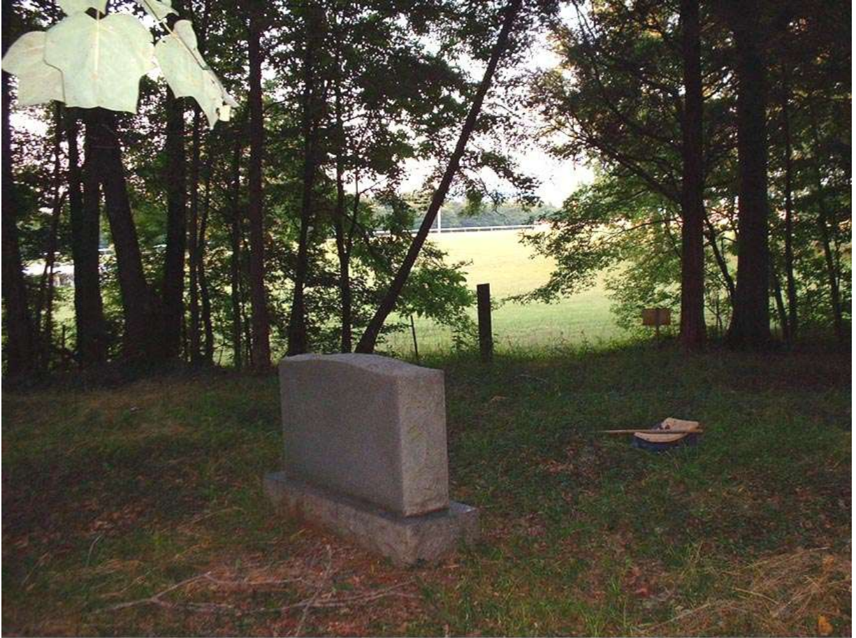
Moore - Landman Cemetery, Redstone Arsenal, Madison Co., AL, June, 2002.

Backside of the memorial to the Burns families, looking from center of the cemetery toward the north.