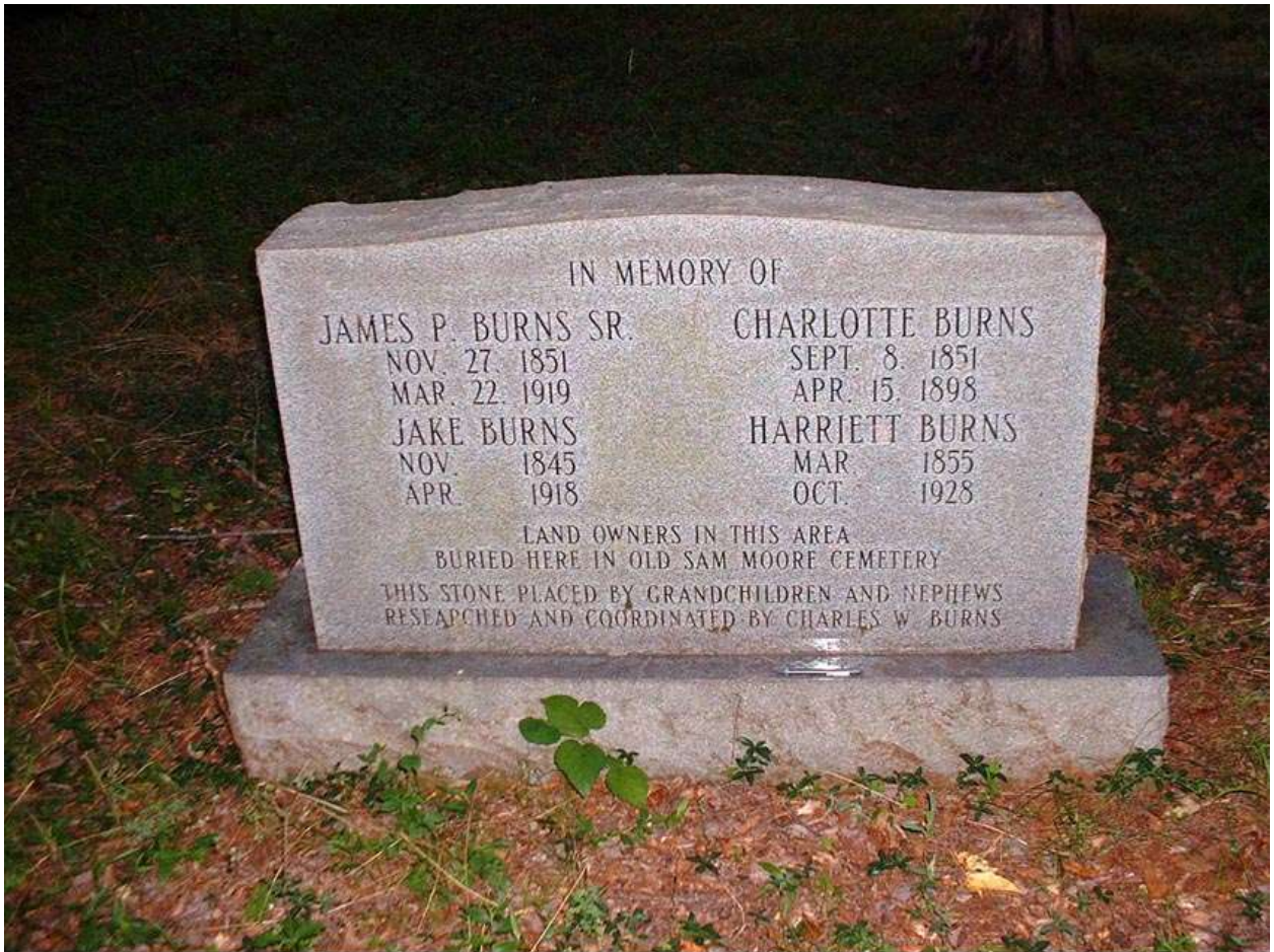
Moore - Landman Cemetery, Redstone Arsenal, Madison Co., AL, June, 2002.

Monument in the center of the cemetery. This is the only marker with inscriptions in the cemetery.