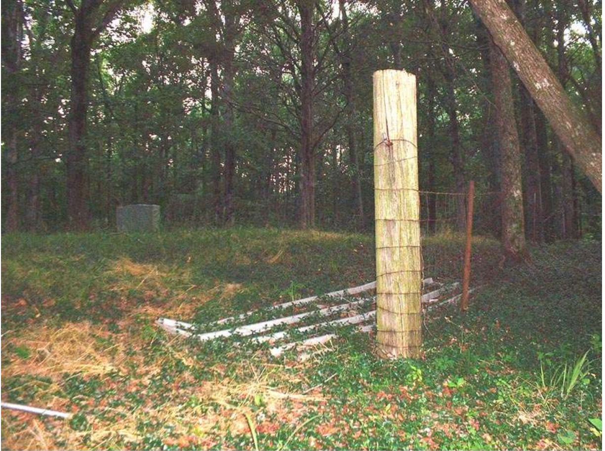
Moore - Landman Cemetery, Redstone Arsenal, Madison Co., AL, June, 2002.

View to the southwest from the entrance at the northeastern corner.