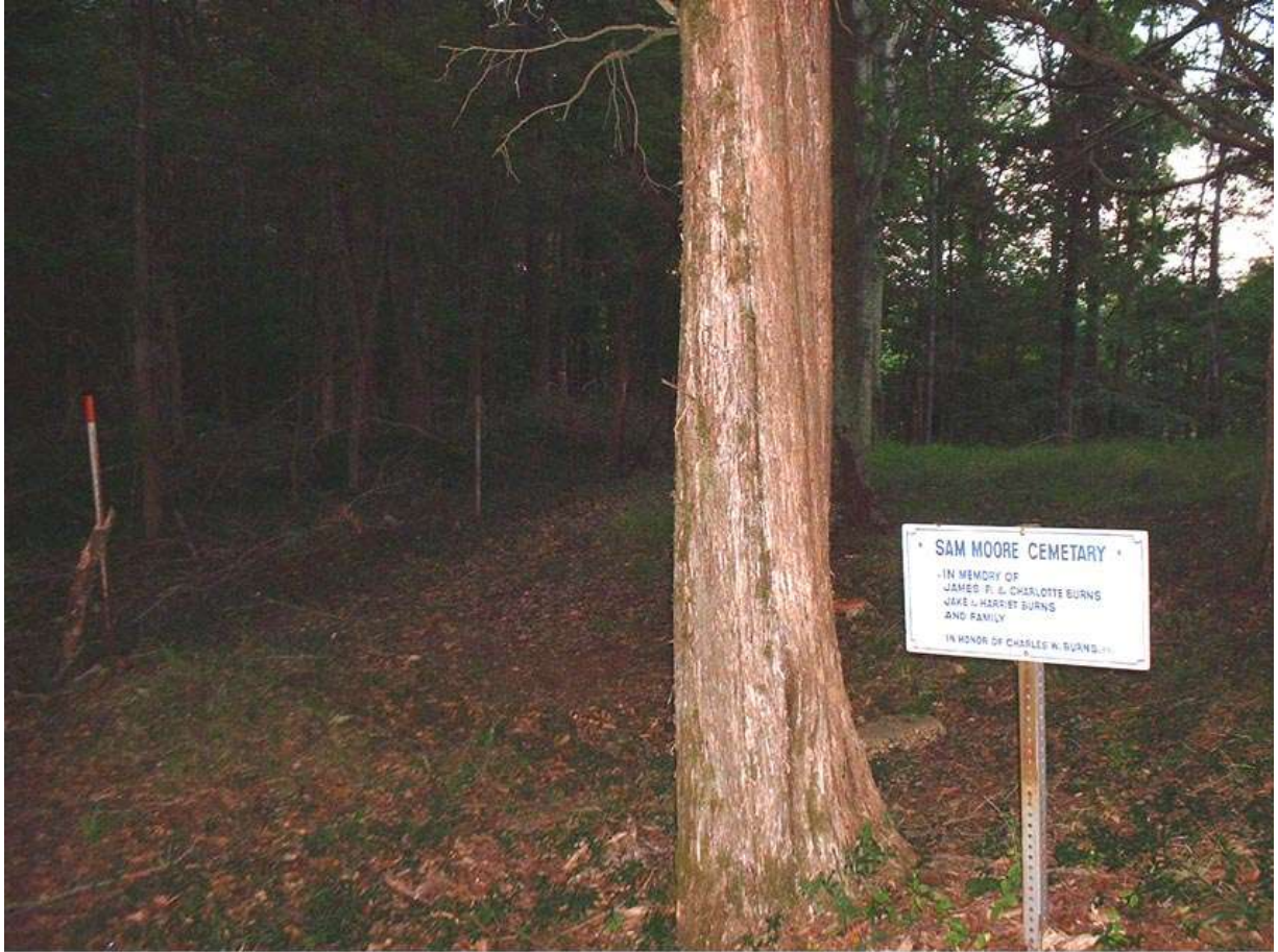
Moore - Landman Cemetery, Redstone Arsenal, Madison Co., AL, June, 2002.

View along the eastern edge of the cemetery, looking from the north.