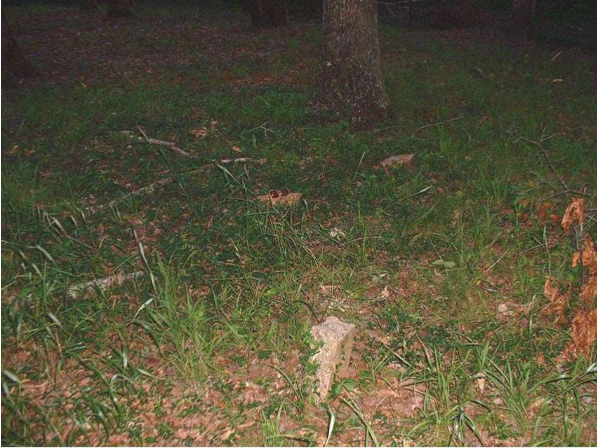
Moore - Landman Cemetery, Redstone Arsenal, Madison Co., AL, June, 2002.

More fieldstones, in foreground. Fieldstones in background (with sunglasses) appeared in previous photo.