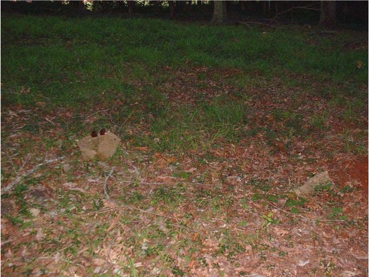
Moore - Landman Cemetery, Redstone Arsenal, Madison Co., AL, June, 2002.