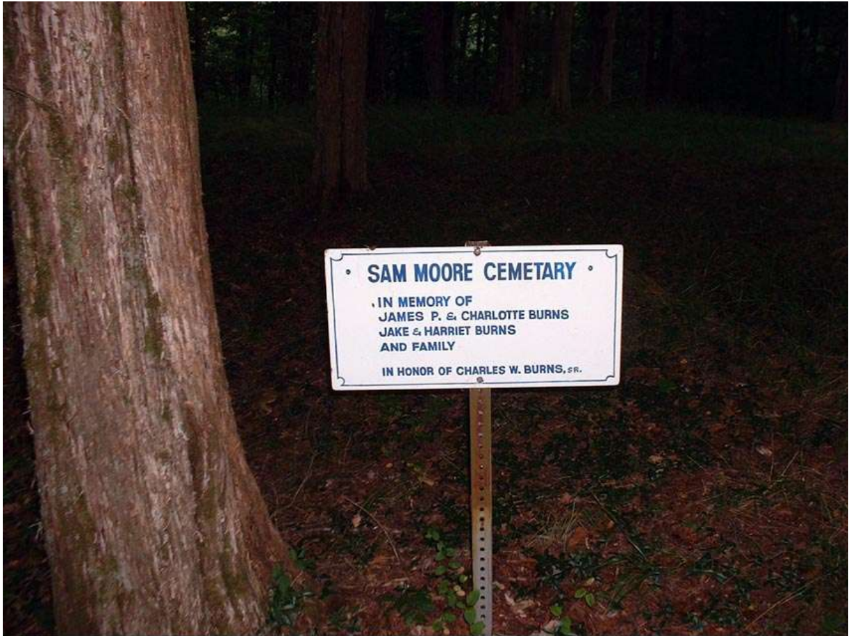
Moore - Landman Cemetery, Redstone Arsenal, Madison Co., AL, June, 2002.

Sign at entrance of cemetery, on left side.