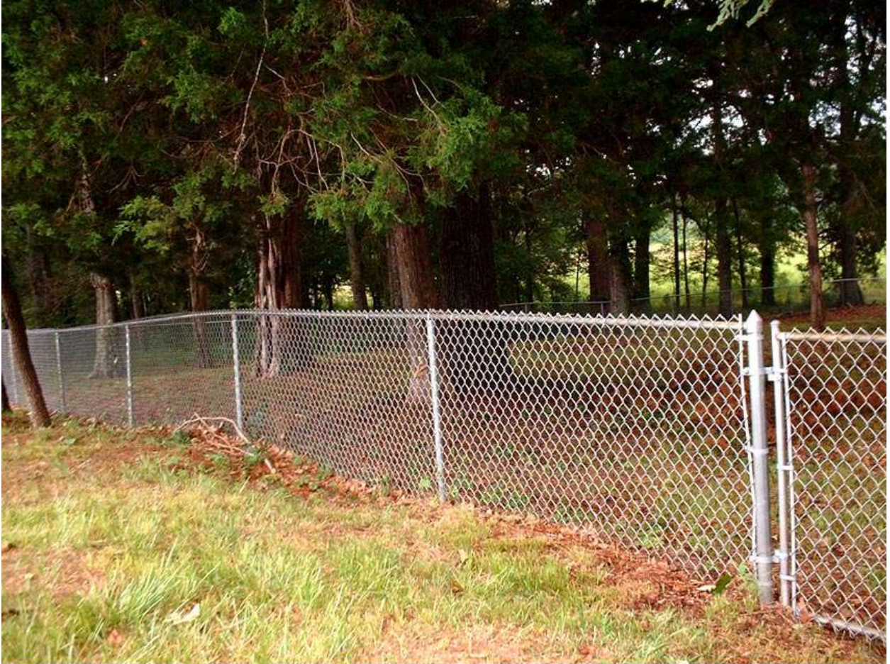
Smith Slave Cemetery (72-1), Redstone Arsenal, Madison County, Alabama, July 2002.

(View over fence into cemetery from SE corner at gate)