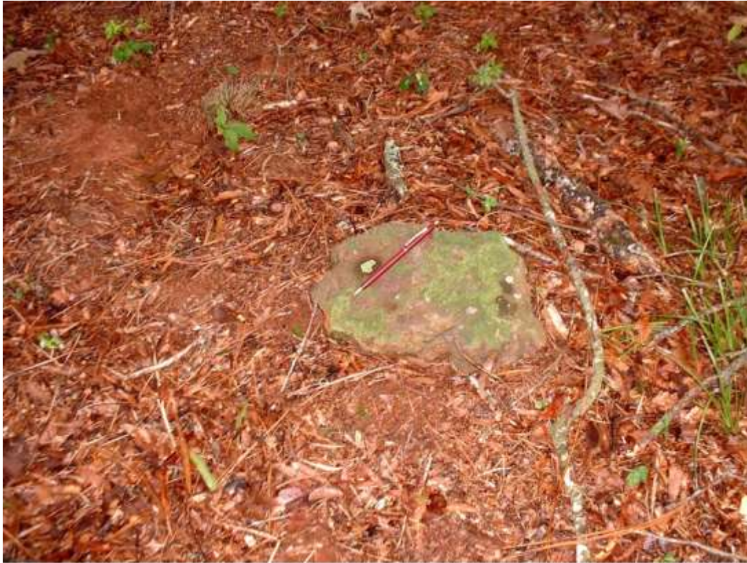
Smith Slave Cemetery (72-1), Redstone Arsenal, Madison County, Alabama, July 2002. (Top view of one of the few fieldstones found)