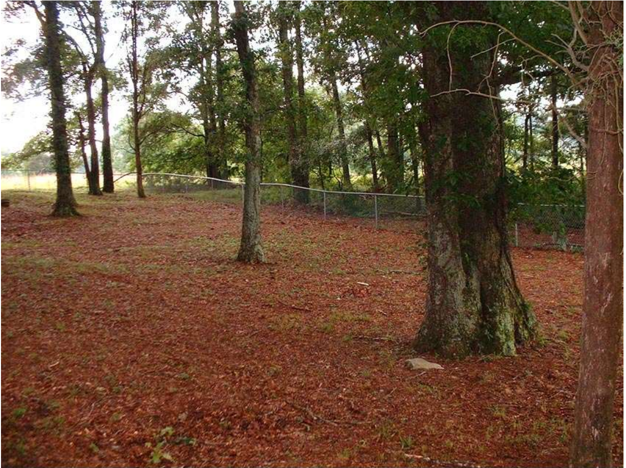
Smith Slave Cemetery (72-1), Redstone Arsenal, Madison County, Alabama, July 2002. (View to southwest from NE end)

At the base of the oak tree to the right can be seen one of the few fieldstones found in this cemetery. The photos below enlarge on views of that fieldstone, which carries no inscribed information.