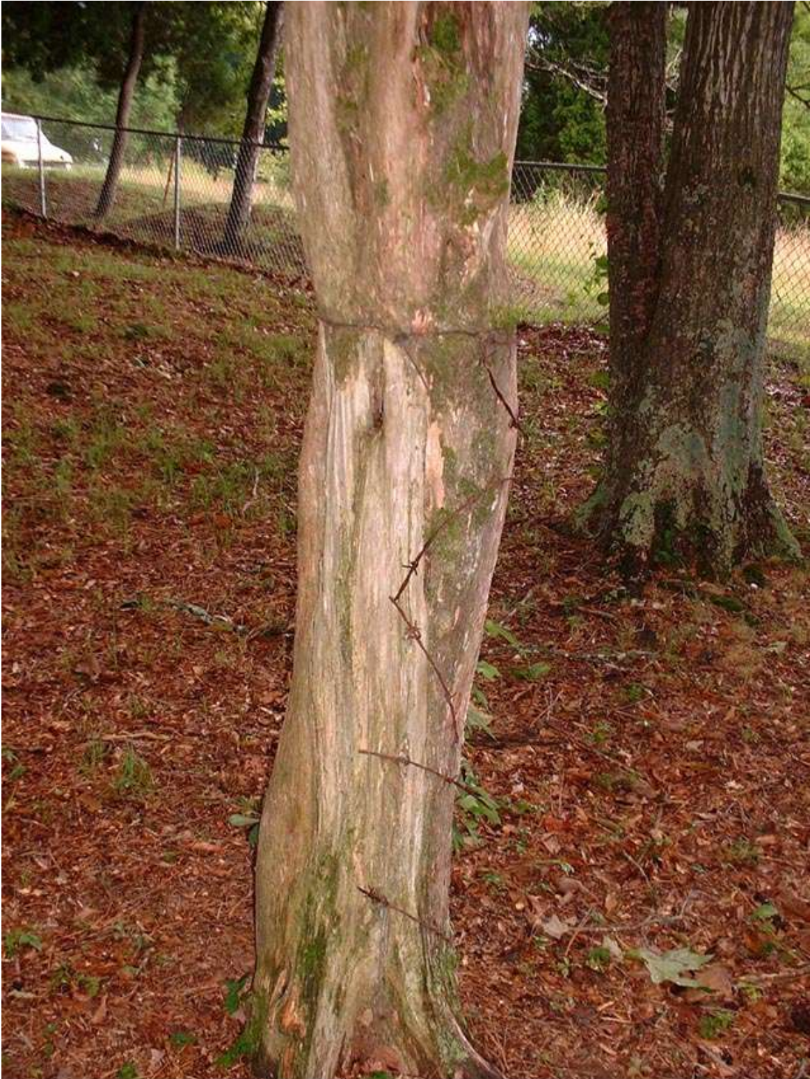
Smith Slave Cemetery (72-1), Redstone Arsenal, Madison County, Alabama, July 2002.

(Close view of barbed wire in a cedar tree trunk)