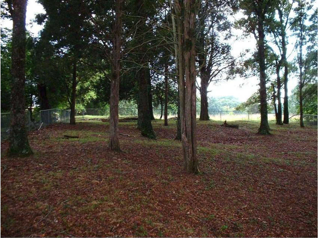
Smith Slave Cemetery (72-1), Redstone Arsenal, Madison County, Alabama, July 2002. (View to south along east fence from north end)