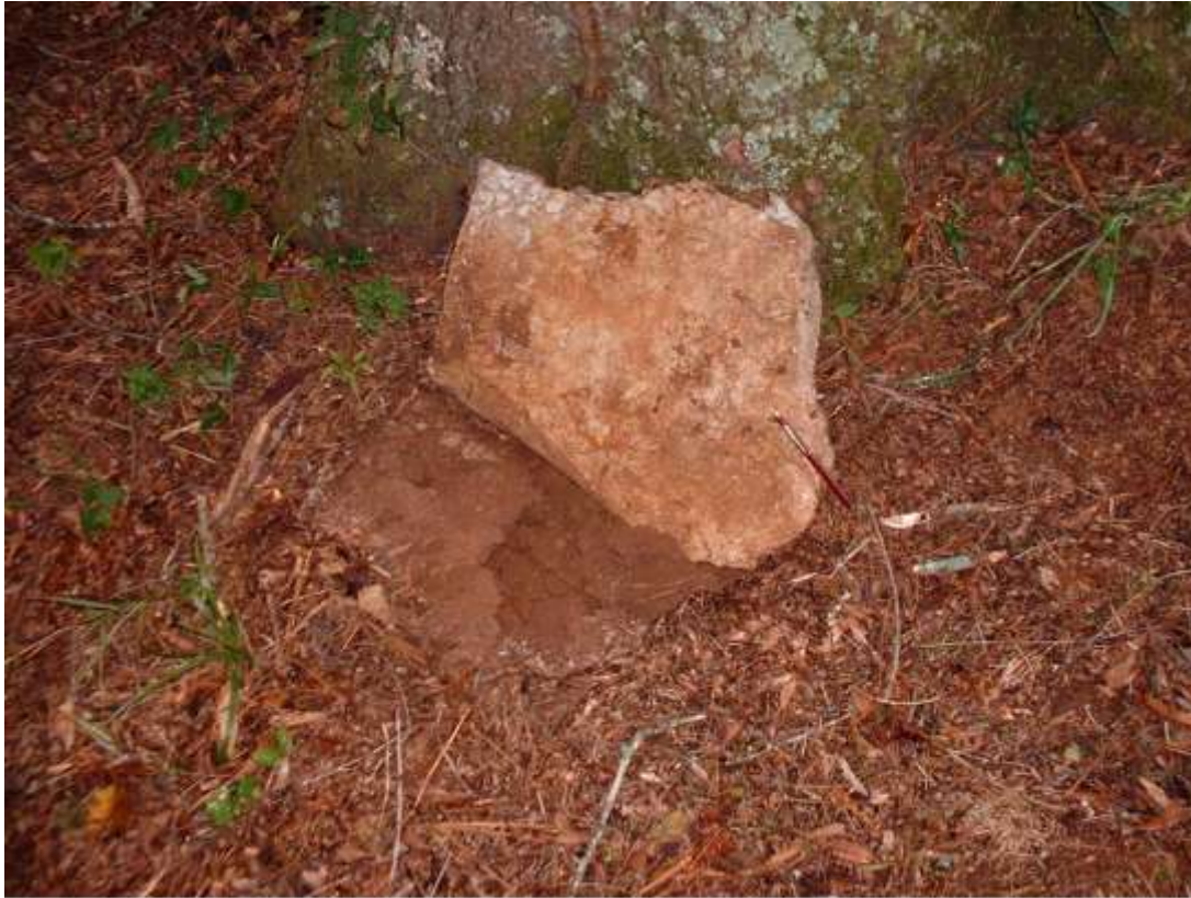
Smith Slave Cemetery (72-1), Redstone Arsenal, Madison County, Alabama, July 2002. (Same fieldstone as above, flipped up to reveal other side)