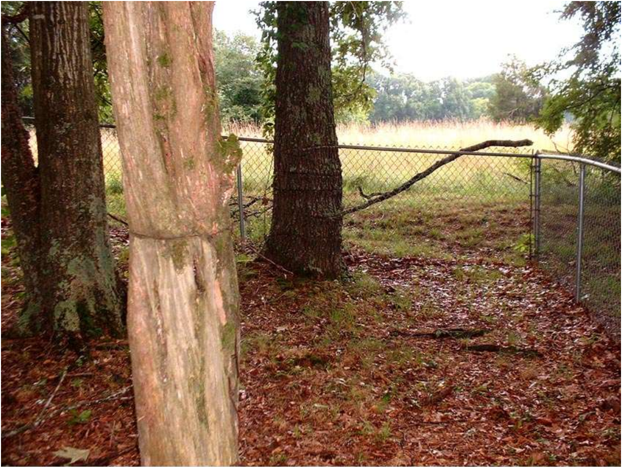
Smith Slave Cemetery (72-1), Redstone Arsenal, Madison County, Alabama, July 2002. (Evidence of old fence in several tree trunks of SW corner)

There was apparently an old fence in the southwest portion of the cemetery, as indicated by remnants of barbed wire embedded in several tree trunks. However, there was no particular pattern perceived regarding the route of the old fence, so it is not known whether it was part of a perimeter fence or perhaps an internally separated family plot.