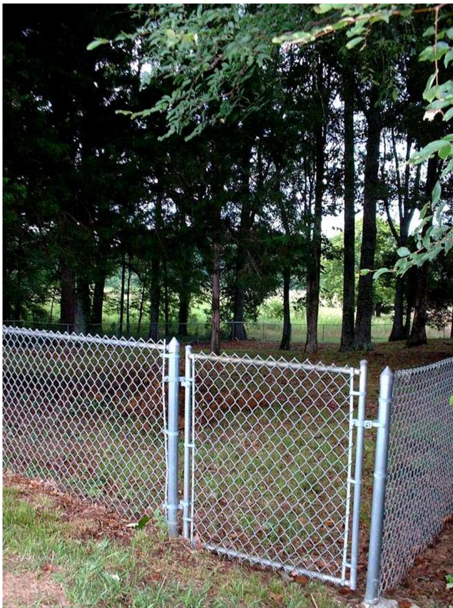
Smith Slave Cemetery (72-1), Redstone Arsenal, Madison County, Alabama, July 2002.