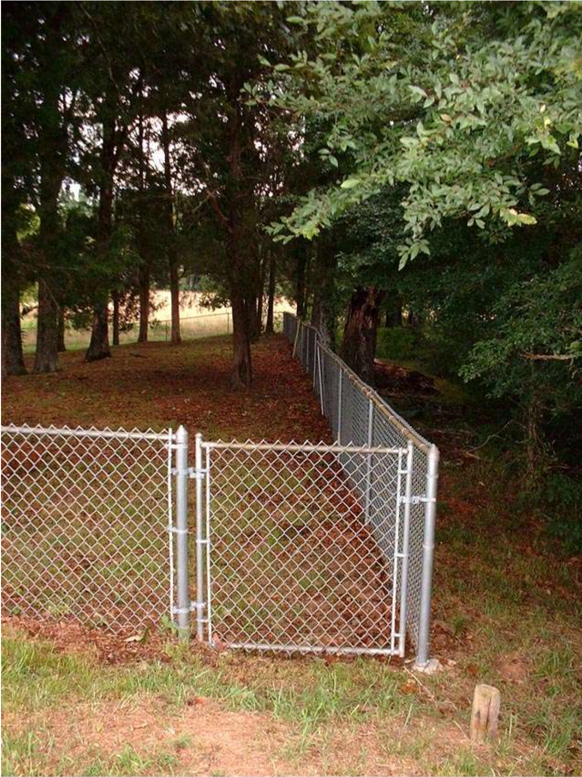
Smith Slave Cemetery (72-1), Redstone Arsenal, Madison County, Alabama, July 2002.

(View from gate at SE corner into shaded cemetery)