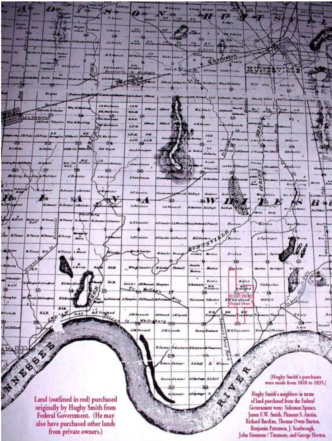
1875 Map showing landowners of record in Madison County, AL (Redstone Arsenal Portion)