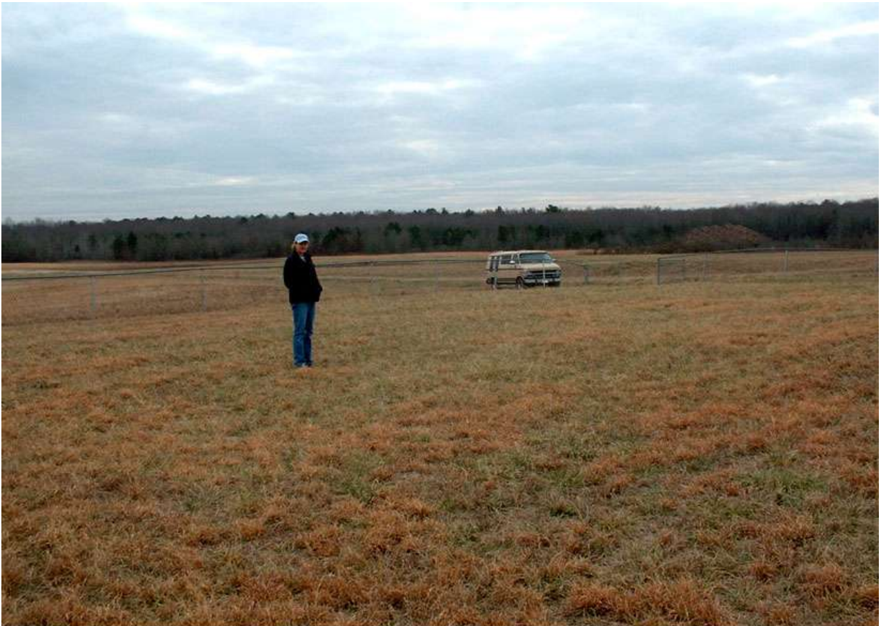
Overview to South-Southeast within UNNAMED CEMETERY in Test Area 1, NW/4, S17-T5S-R1W

When this cemetery was visited in January of 2003, it was found to have no tombstones, no fieldstones, and no surface evidence of grave depressions. It is a large, fenced area that could contain many hundreds of graves, if full. The location is within Test Area 1, south of Center Line Road, about halfway to Dodd Road from the entrance at the Test Area Control Gate. It is near the Clark Cemetery (65-1) and the Simpson – Jones Cemetery (65-3). The immediate theory due to location and lack of definitive surface features