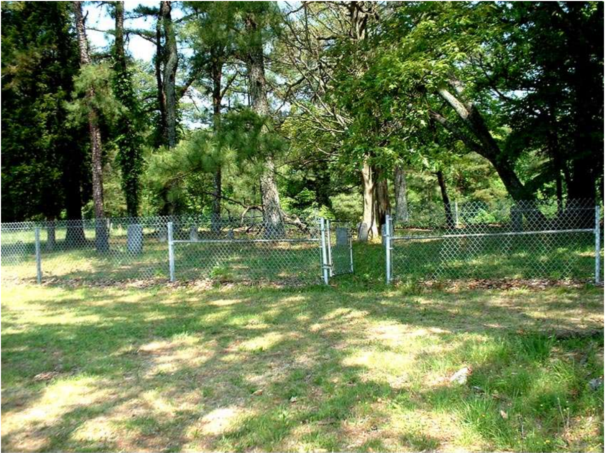
Woodward Cemetery, 88-2, Redstone Arsenal, Madison Co. AL, April 28, 2003

Appropriately near the “end of the road” is the Woodward family cemetery, just a little west and north of the southernmost part of Pershing Road.