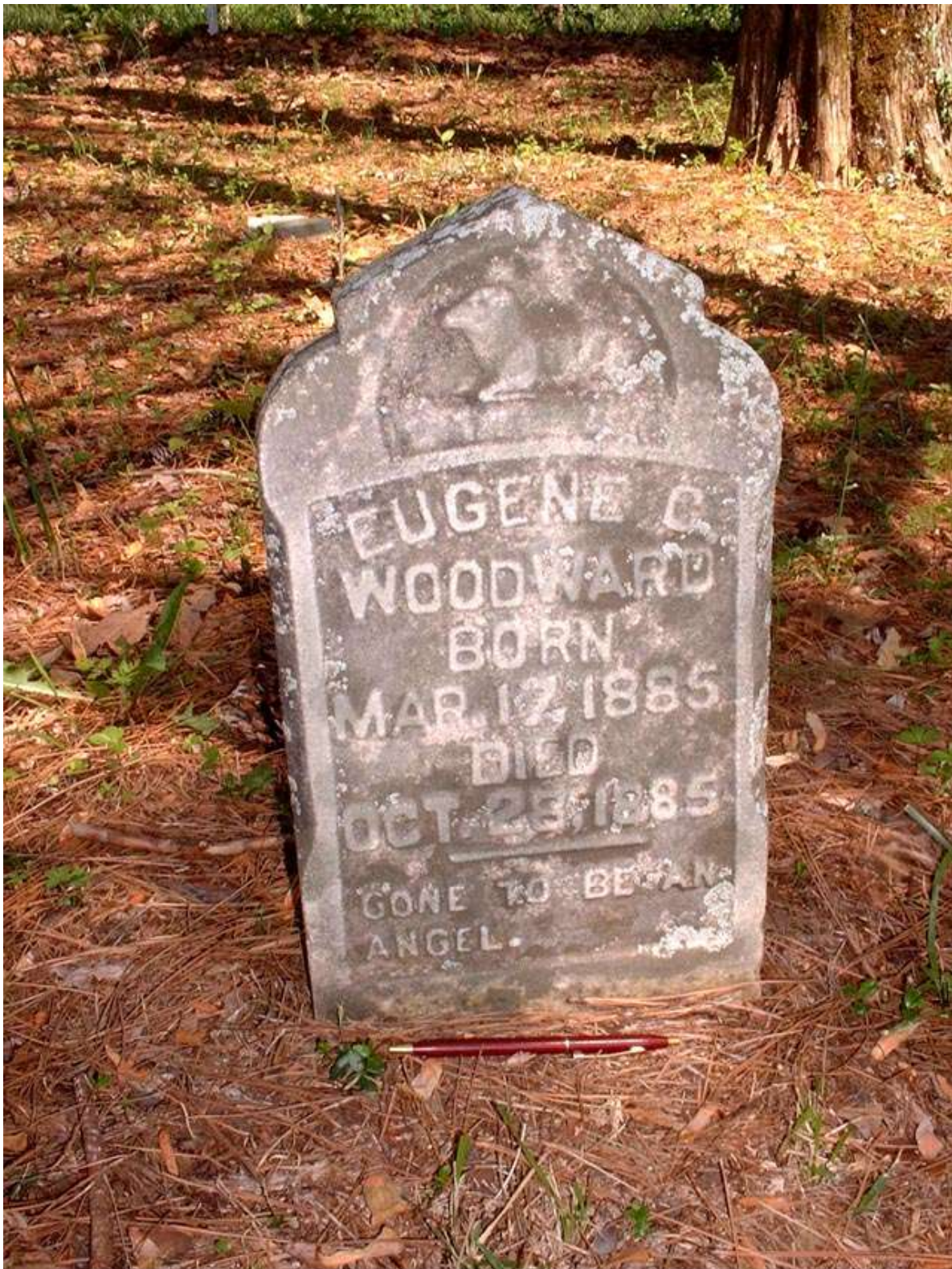
Woodward Cemetery, 88-2, Redstone Arsenal, Madison Co. AL, April 28, 2003