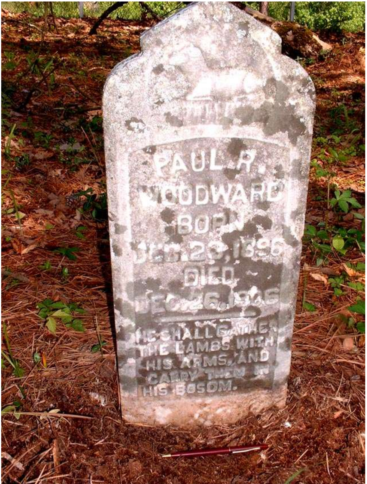
Woodward Cemetery, 88-2, Redstone Arsenal, Madison Co. AL, April 28, 2003