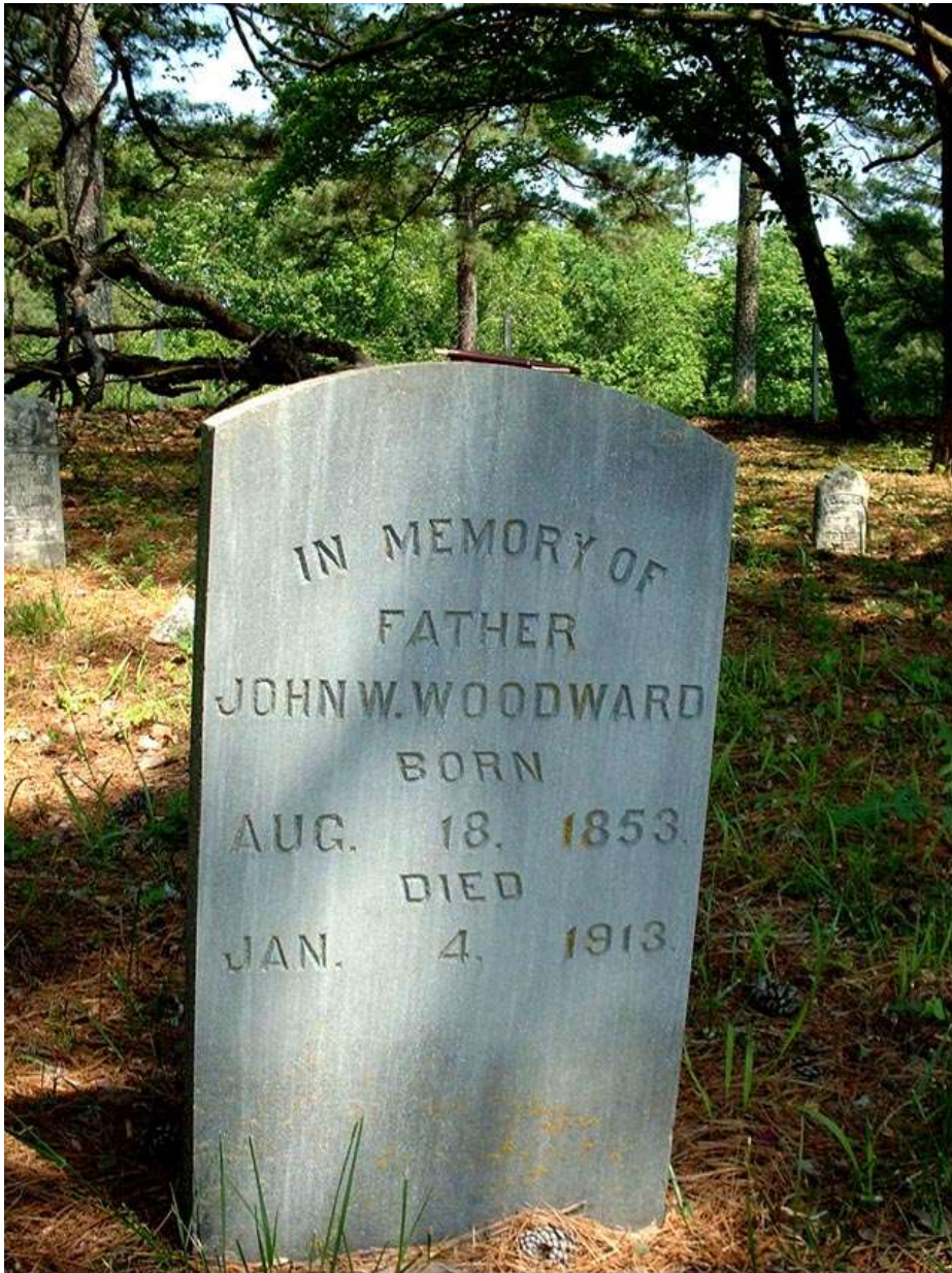
Woodward Cemetery, 88-2, Redstone Arsenal, Madison Co. AL, April 28, 2003