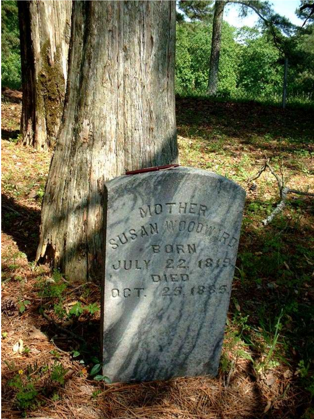
Woodward Cemetery, 88-2, Redstone Arsenal, Madison Co. AL, April 28, 2003