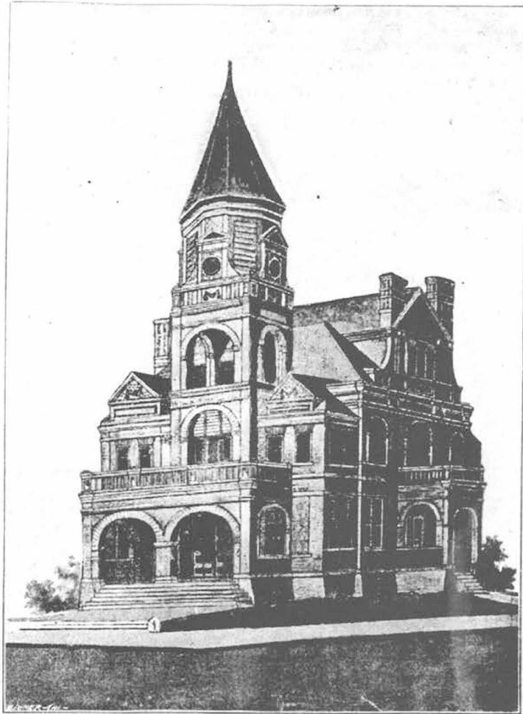
MARSHALL COUNTY COURT HOUSE, GUNTERSVILLE, ALA. (Now under construction, to be completed Feb. 1, 1896, for $20,000.)