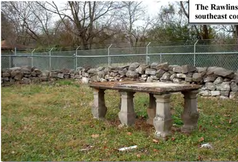
The Rawlings-Lanier Cemetery. View from southeast corner.